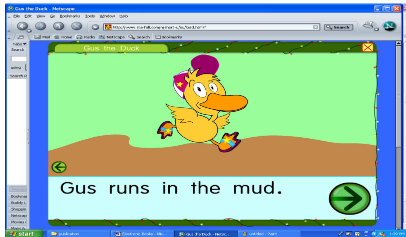
Figure 3: Electronic Books A Screen from www.starfall.com

The electronic books also enable beginning readers to become more familiar with phonemic awareness, semantics, and comprehension. Personally, I find it vital to incorporate technology into interactive, integrative lessons in order to ensure the best possible outcome for developing reading strategies and comprehension. I used electronic books (Figure 3) as an alternative to promoting phonemic awareness and to invite my students to empathize with various characters and their situations. The children absolutely loved these programs and were eager to learn.