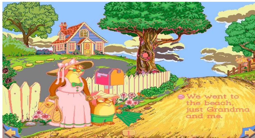
Figure 1: Electronic Book A screen from Just Grandma and Me

The electronic books, which animated popular story books like Mercer Mayer's Grandma and Me , reinforced students' listening and speaking skills (Figure -1). The story was read by an amusing critter, Mercer Mayer, and the words were highlighted through the audio visual reinforcement. Many of the objects danced, sang, spun around, or made humorous comments if they were accessed. The critter read any single word in the text if the word was clicked. The students read along, cross-checked information, tried that again and reheard those words through the video and sound. Because the books were very appealing, students spent lengthy periods of time repeating readings.