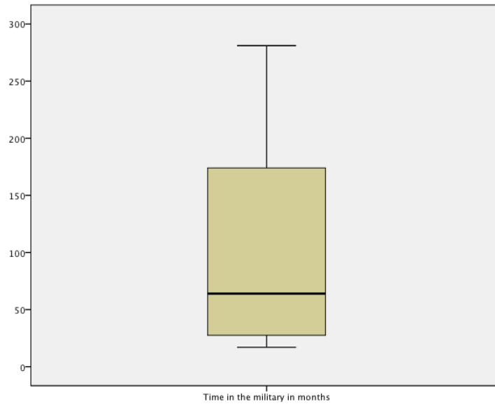
Figure 1. Boxplot graph to assess outliers for Time in Military (months).

The 29 participants' time in Germany ranged from 4 to 156 months with a mean of 30 months ( SD=34 ). Using Pallant's (2010) boxplot method, two participants were identified as outliers (more than 1.5 box-lengths from the edge of the box) and two participants were identified as extreme outliers (more than 3 box-lengths from the edge of the box) (Figure 2). Once these participants were removed from the analysis, the mean time in Germany was 18.2 months ( SD=8.2 ). The demographic data are presented in Tables 2 and 3.