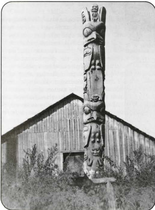
Totem pole, Kispiox, British Columbia, 1899.