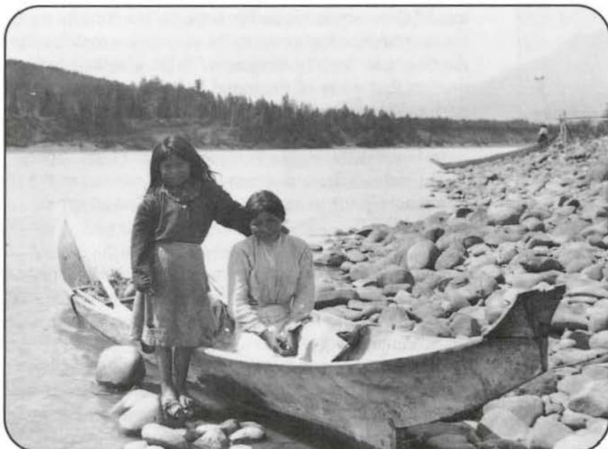
Native girls in boat on Skeena River, Kitwauga, British Columbia, 1915.