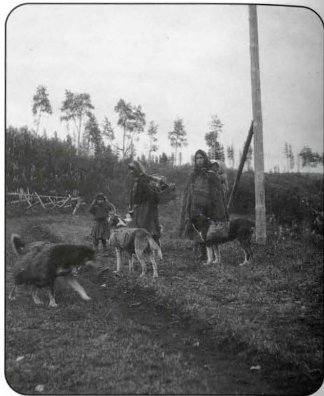
Indian women packers, Moricetown, British Columbia, ca. 1900.

As the oral histories of Aboriginal peoples are passed on from generation to generation, from the perspective of the rules of evidence applied by Canadian courts they are largely hearsay. The actual witnesses of most of the recounted events are dead, and thus are unavailable to give direct evidence themselves. However, in situations