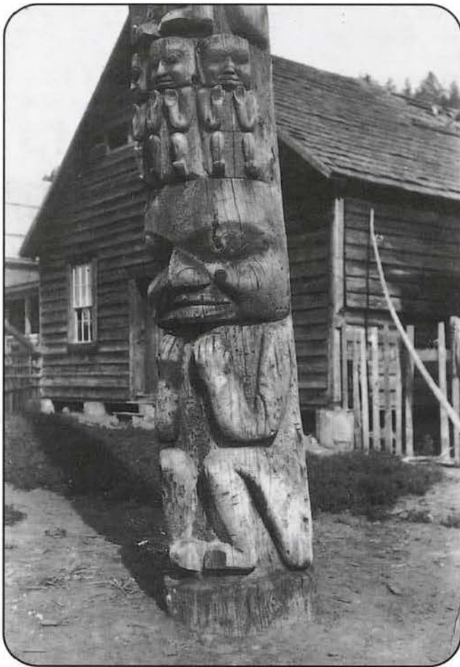
Indian totem pole, Hazelton, British Columbia, 1910.

Dickson (later Chief Justice of Canada) had said that “[c]laims to aboriginal title are woven with history, legend, politics and moral obligations.” 26 As Lamer noted,