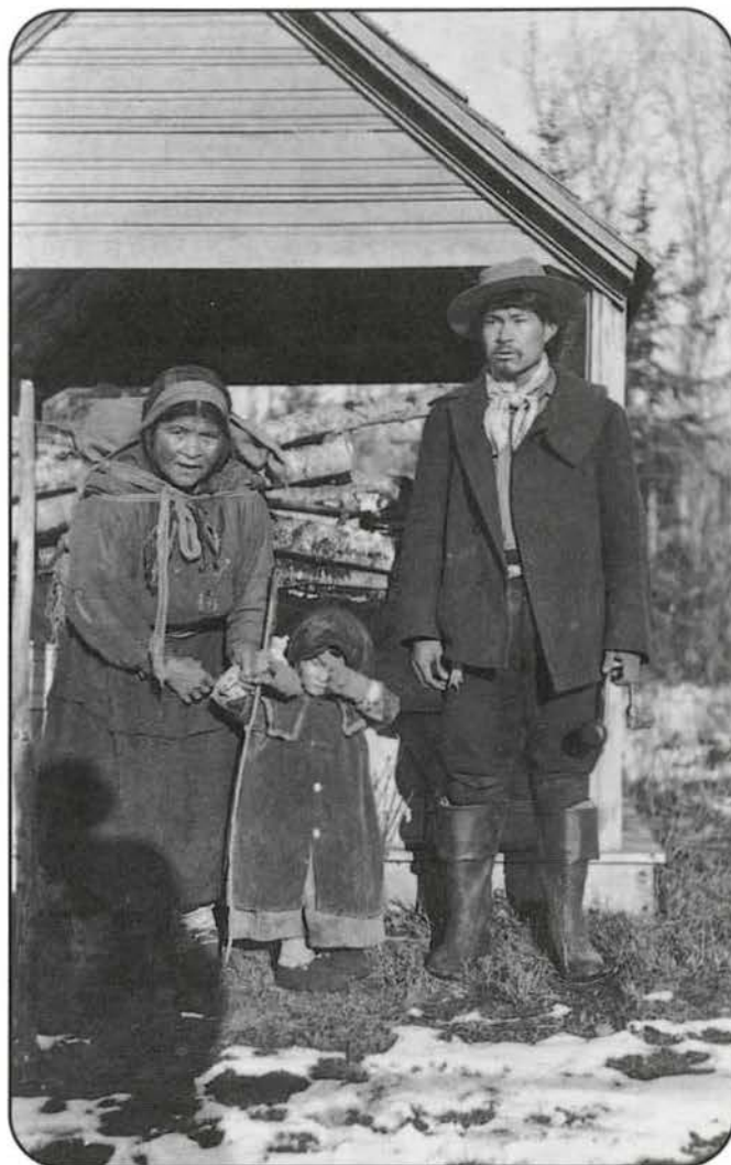
Indians, Hazelton, British Columbia, 1907-1912.