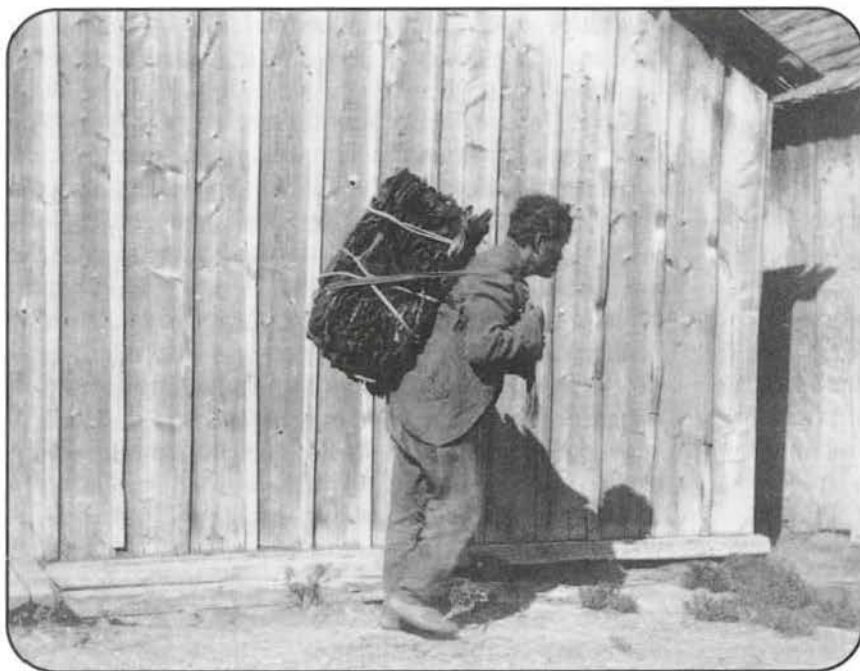
Indian carrying bundle of skins, Kispiox, British Columbia, 1899.

I am satisfied that the lay witnesses honestly believed everything they said was true and accurate. It was obvious to me, however, that very often they were recounting matters of faith which have become fact to them. If I do not accept their evidence it will seldom be because I think they are untruthful, but rather because I have a different view of what is fact and what is belief . 17 [emphasis added]