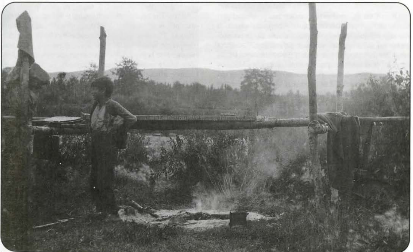
Indians drying cooked berries, Moricetown, British Columbia, ca. 1900.

The Supreme Court of Canada has acknowledged the difficulty of proving Aboriginal claims and has directed that impossible burdens of proof should not be placed on