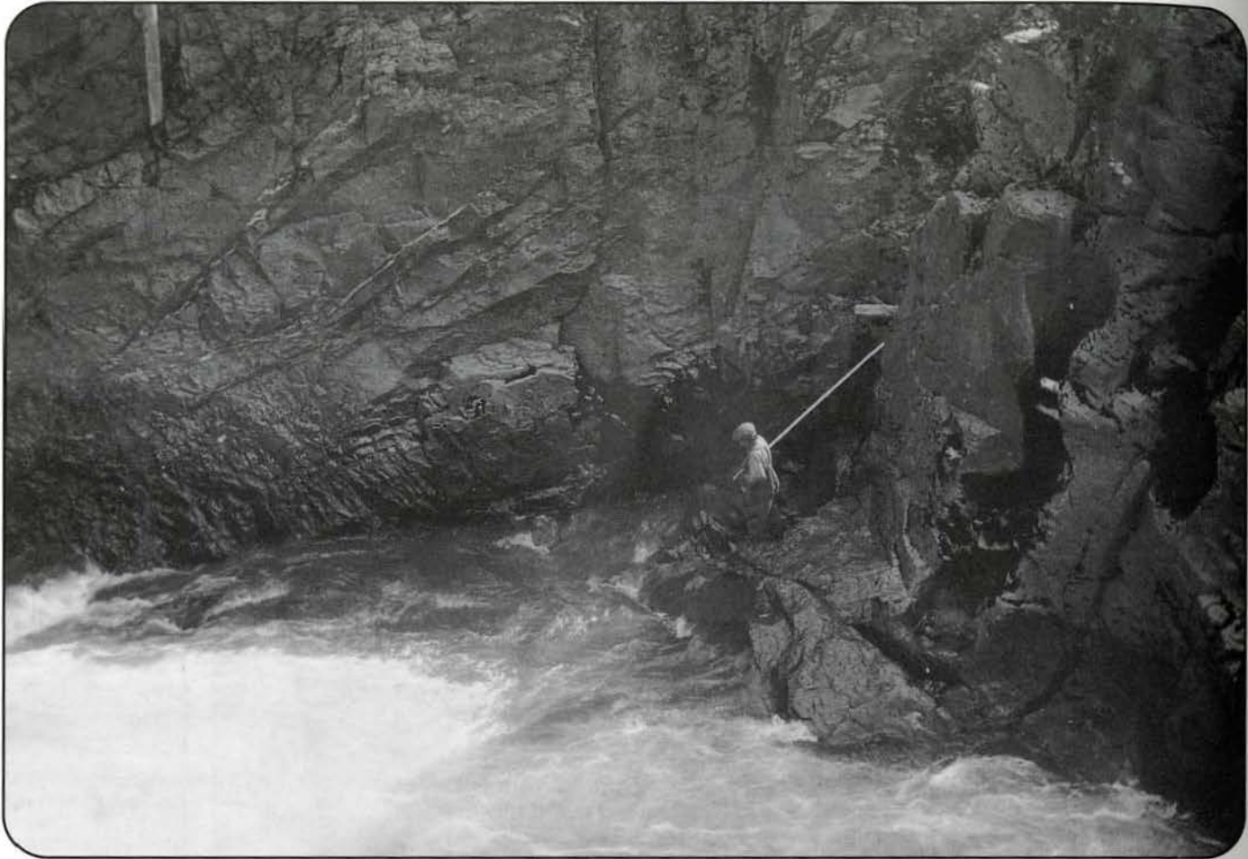
Indians fishing, Moricetown, British Columbia, 1901. While the information accompanying these photographs in the archives does not specify whether the persons in them are Gitksan or Wet'suwet'en, they probably are, as the photographs were taken within the territories of those nations.