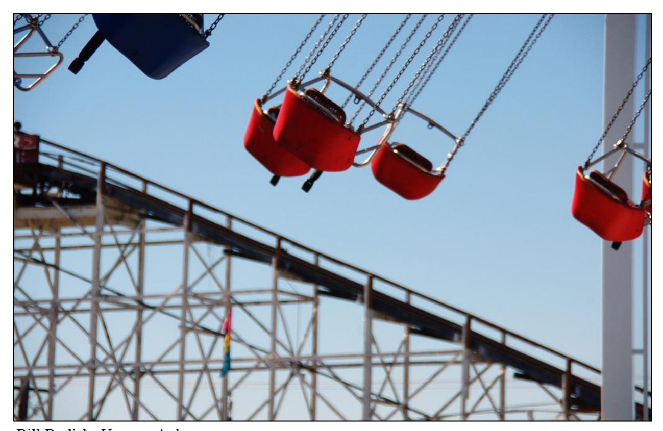
Bill Bodish, Unoccupied