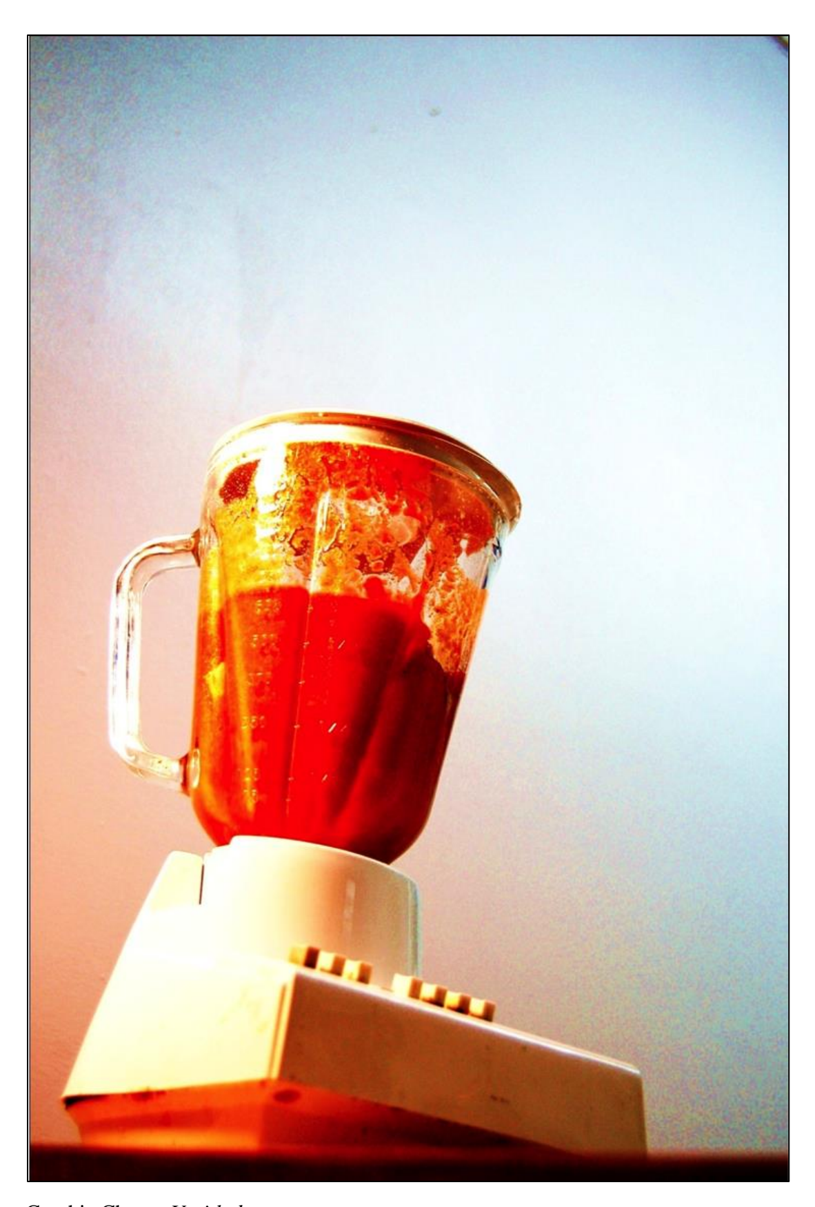
Cynthia Chang, Untitled