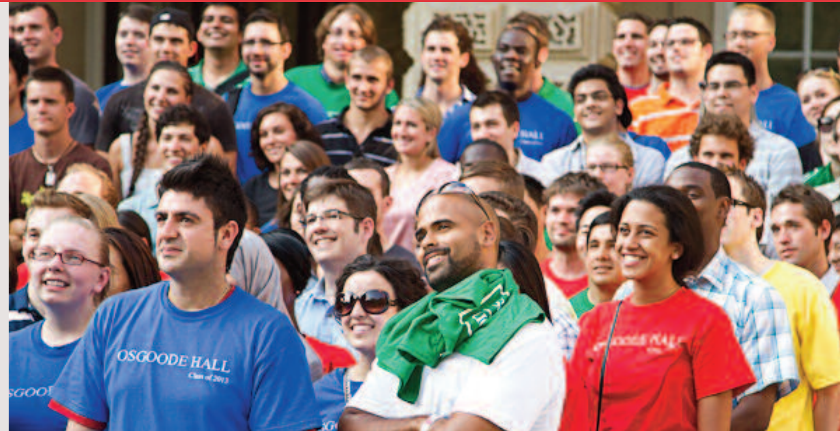
Some members of the JD Class of 2013 photographed outside Osgoode Hall in downtown Toronto during Orientation Week 2010.

Osgoode's Faculty Council has approved a new upper-year JD curriculum, the product of three years of intensive consultation and collaboration between students, faculty, and staff.