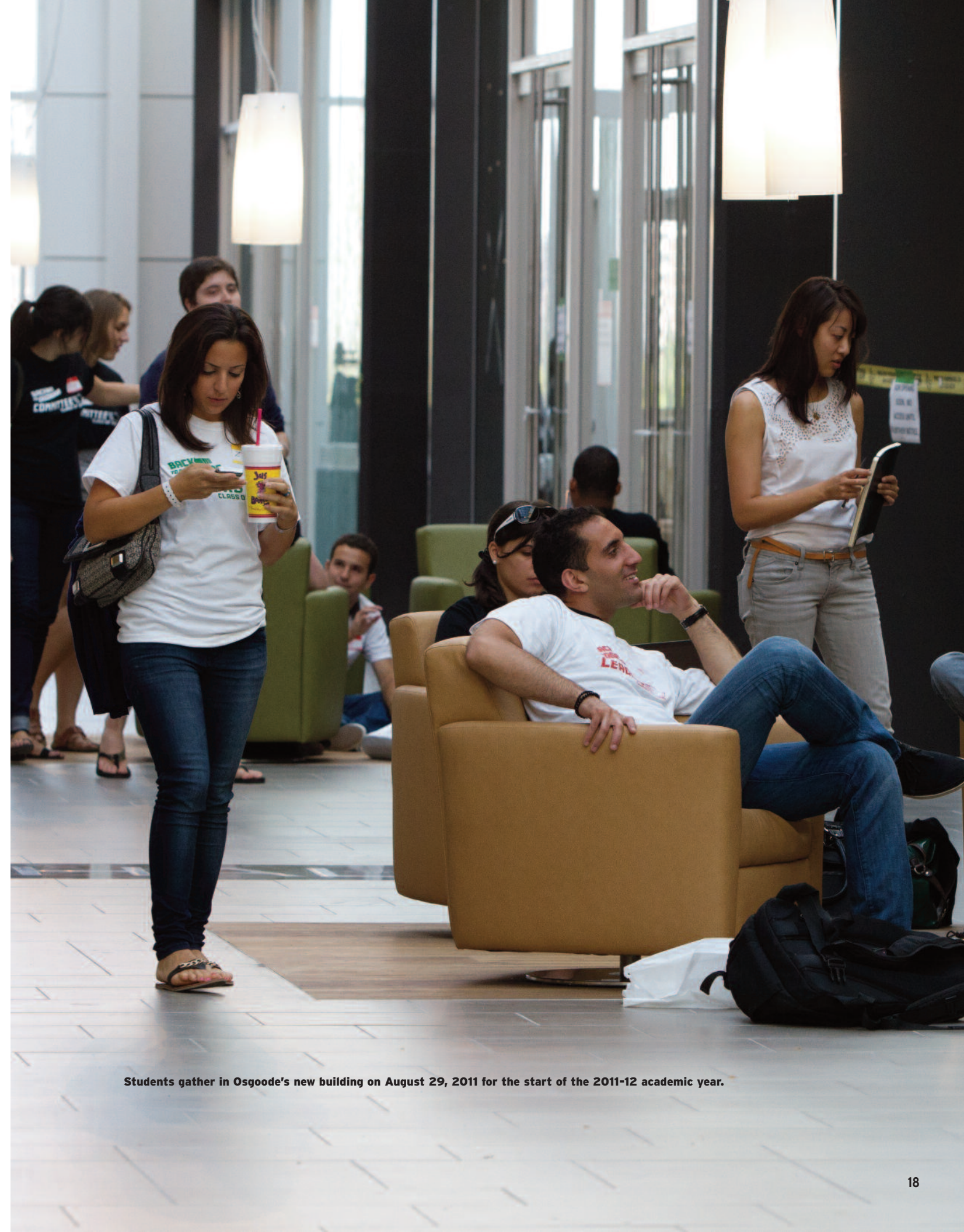
Students gather in Osgoode's new building on August 29, 2011 for the start of the 2011-12 academic year.

The strategic direction for Osgoode is an approach as much as it is a set of projects and initiatives. We plan to be creative and ambitious in seizing initiatives. It is of course impossible to set out the kinds of opportunities which will emerge over the next five years. Rather than itemizing what the future may hold, we feel it is more appropriate to conclude with a word about Osgoode's attitude toward the future. We embrace change. We seek opportunities to experiment, to push boundaries, to expand horizons, and to lead. We take enormous pride in our accomplishments but recognize that we have much work ahead of us, and that the ideas and commitment of each member of Osgoode's community matter. As we move forward, we must do so together, and with a clear sense of our identity, our mission, and our potential. With optimism and confidence, we welcome the challenge.