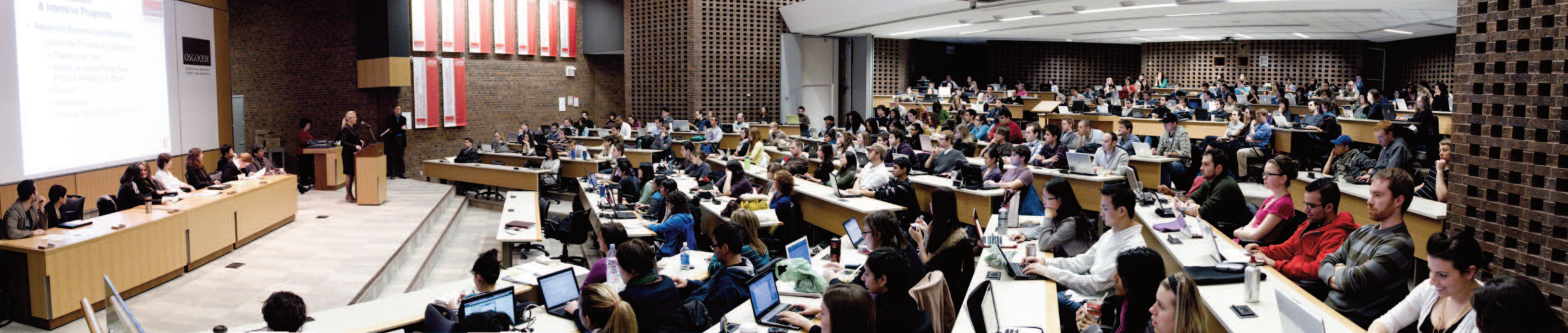
Clinical Education and Intensive Programs Information Session 2010.

to ensure leadership in the Law School's Aboriginal research, curricular and community activities. In addition to infusing existing courses and seminars with materials that reflect the Aboriginal experience, Osgoode hopes to offer courses covering Indigenous Laws in Ontario, Canadian and Global settings. Osgoode also will seek out partners among the Aboriginal community in order to expand the reach of the Law School's research and teaching.