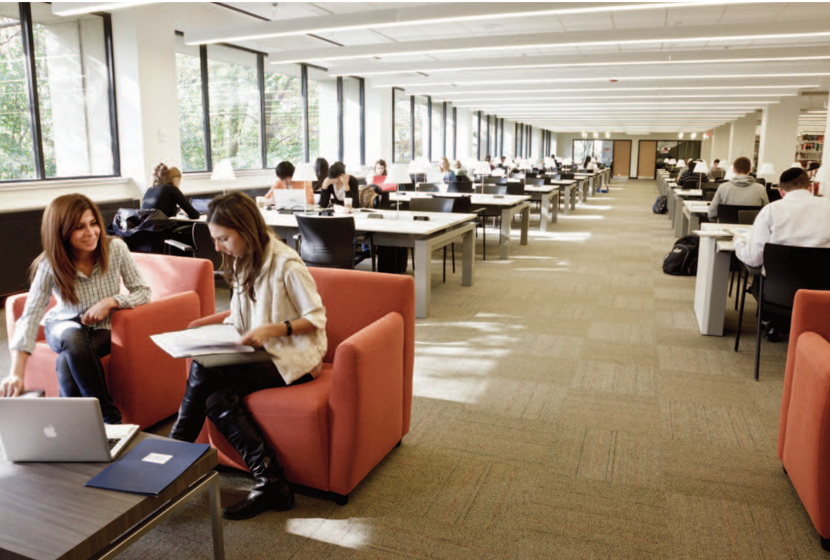
The Harris-Taylor Family Reading Room in the Law Library.

The most critical component in extending the research capacity and learning opportunities of Osgoode students and in promoting greater effectiveness in research for Osgoode faculty and its research centres is the Library.