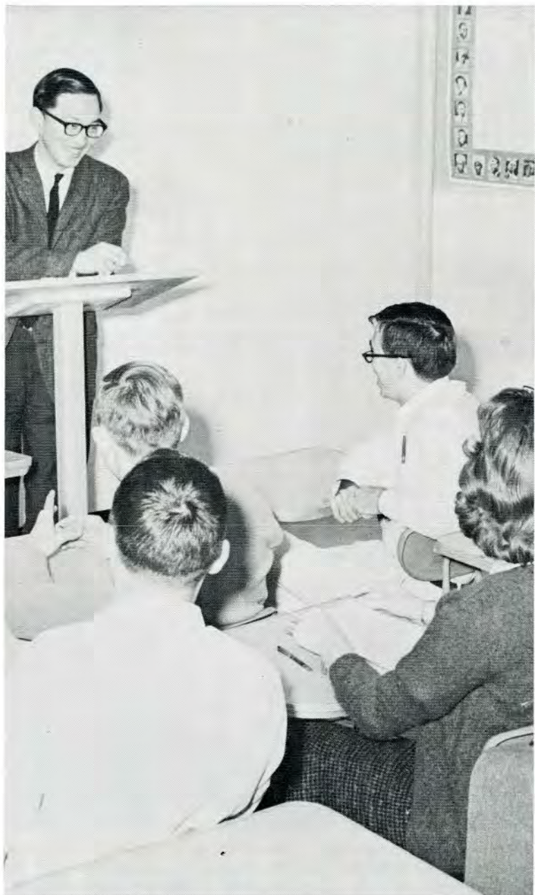
Broad opportunity abounds on the Eastern campus for students of different geographic, social, economic and educational backgrounds who gather to develop their abilities to the fullest extent.