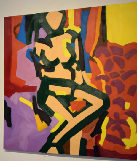
FRANK KAHN III