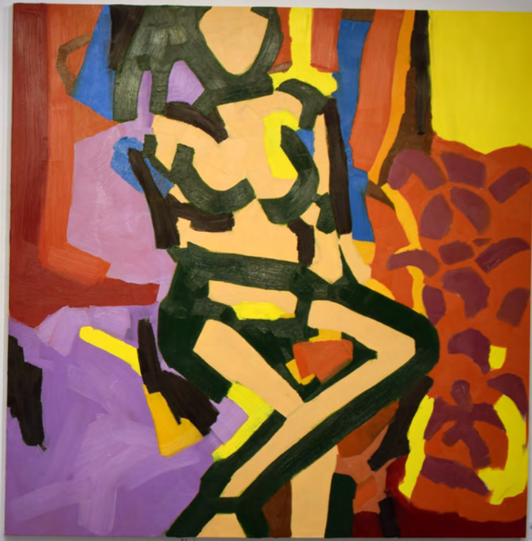
COLOR X LINE IV 1951, OIL ON CANVAS, 100 X 100