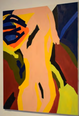
FRANK KAHN III