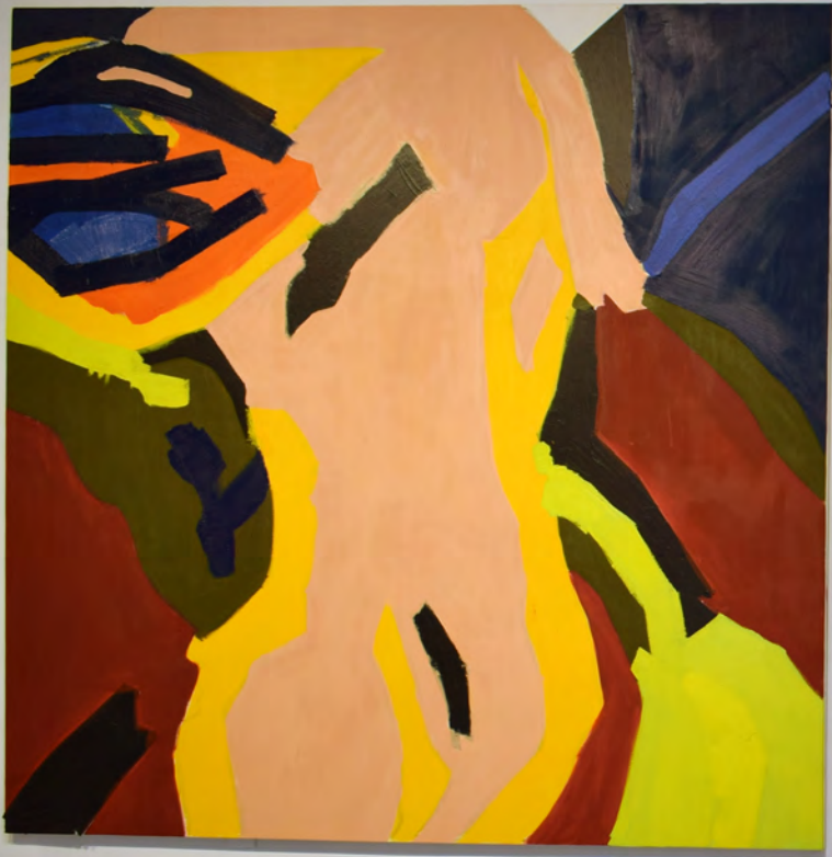
COLOR X LINE III 1951, OIL ON CANVAS, 100 X 100