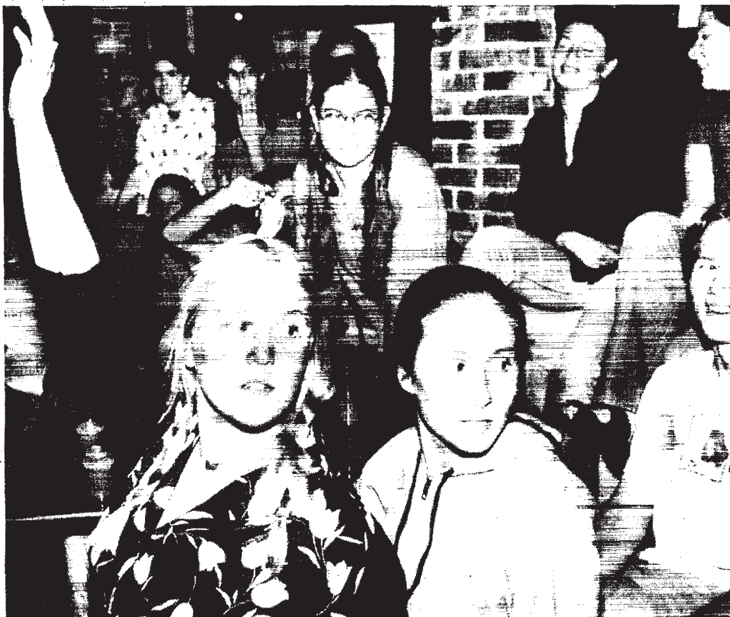
"Point of information": Gretchen Wilson at the Forum.