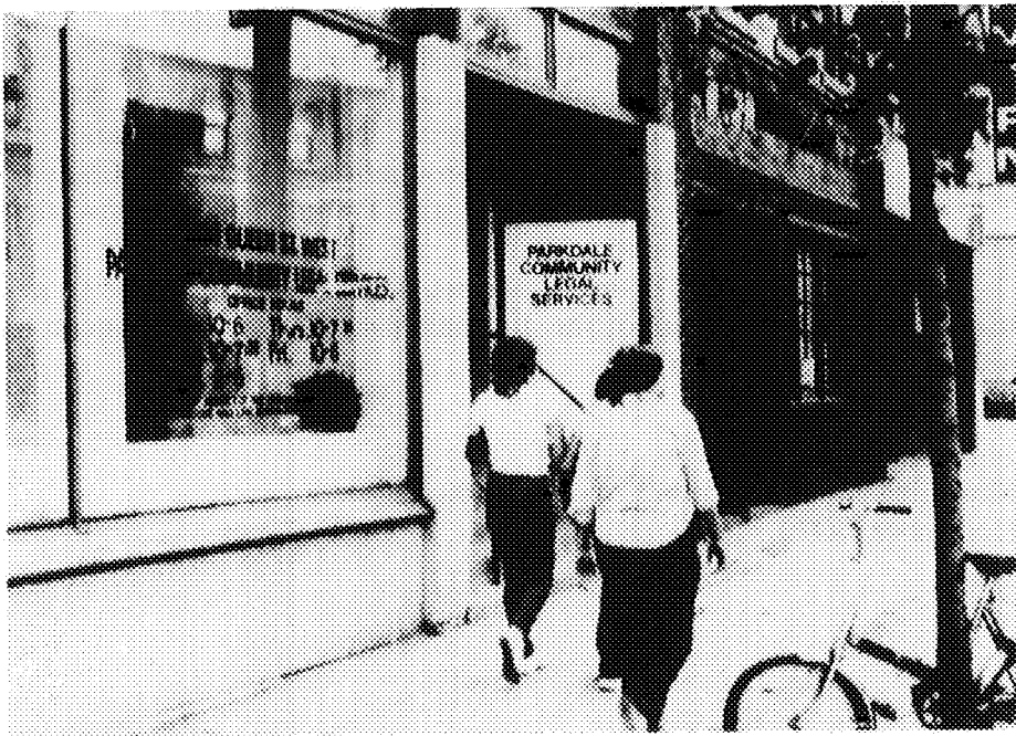
Second location of PCLS on 1239 Queen Street West in the seventies