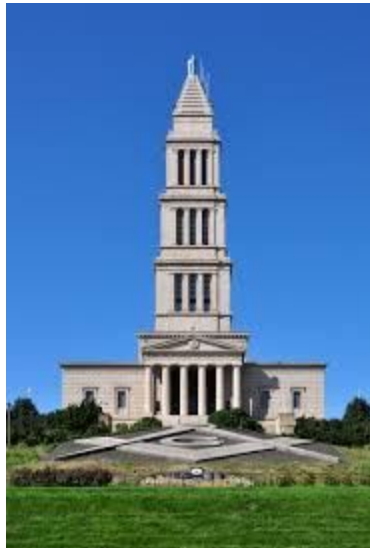
Front view of George Washington Masonic National Memorial. Unknown photographer and date.