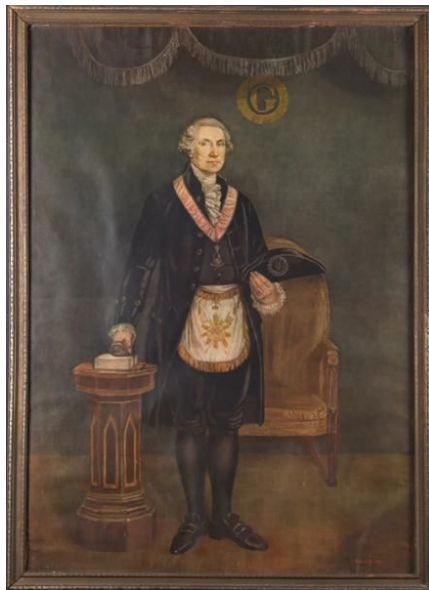
A similar print of Washington in Masonic garb hangs in Ancient's lodge room. Unknown artist and date.