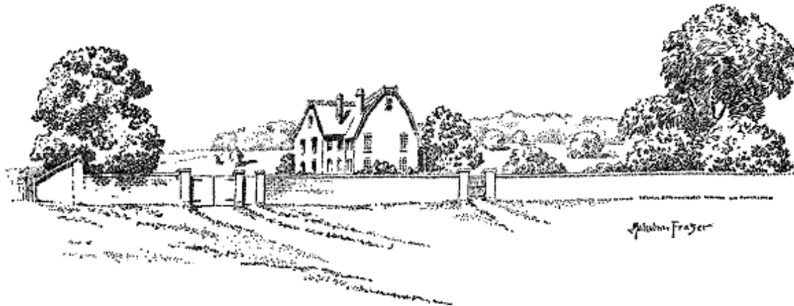
MANSION ERECTED BY HEZEKIAH USHER IN 1684 ON WHAT IS NOW THE CORNER OF TREMONT STREET AND TEMPLE PLACE