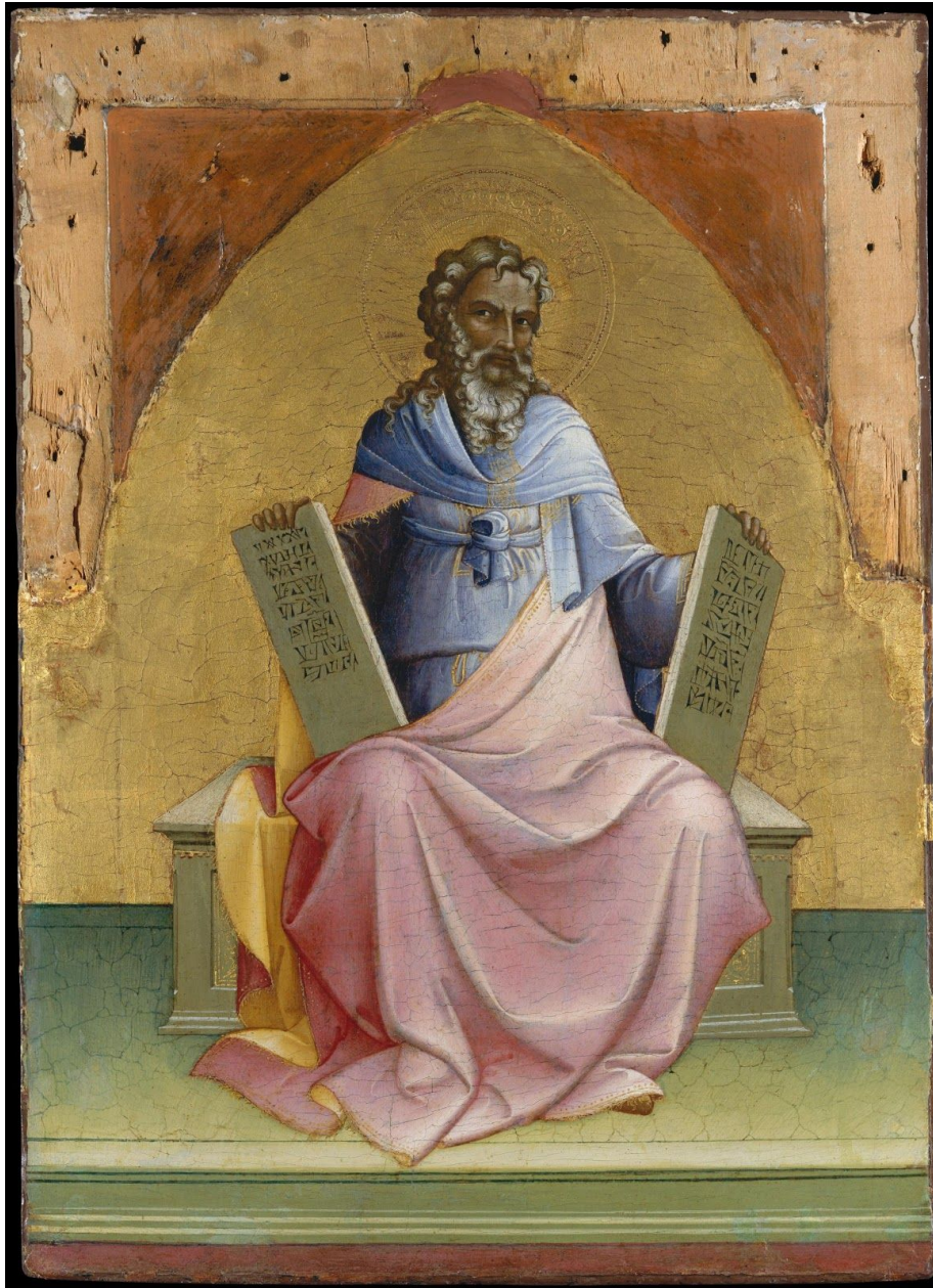
Fig. 15. Lorenzo Monaco, Moses , c. 1408-10. Tempera and gold on wood. 24 1/2 x 17 1/2 in. The Metropolitan Museum of Art, New York.