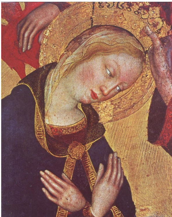
Fig. 14. Gentile da Fabriano, Valle Romita Polyptych , c. 1410-12. Tempera and gold on panel. 110 in × 98 in. Pinacoteca di Brera, Milan.