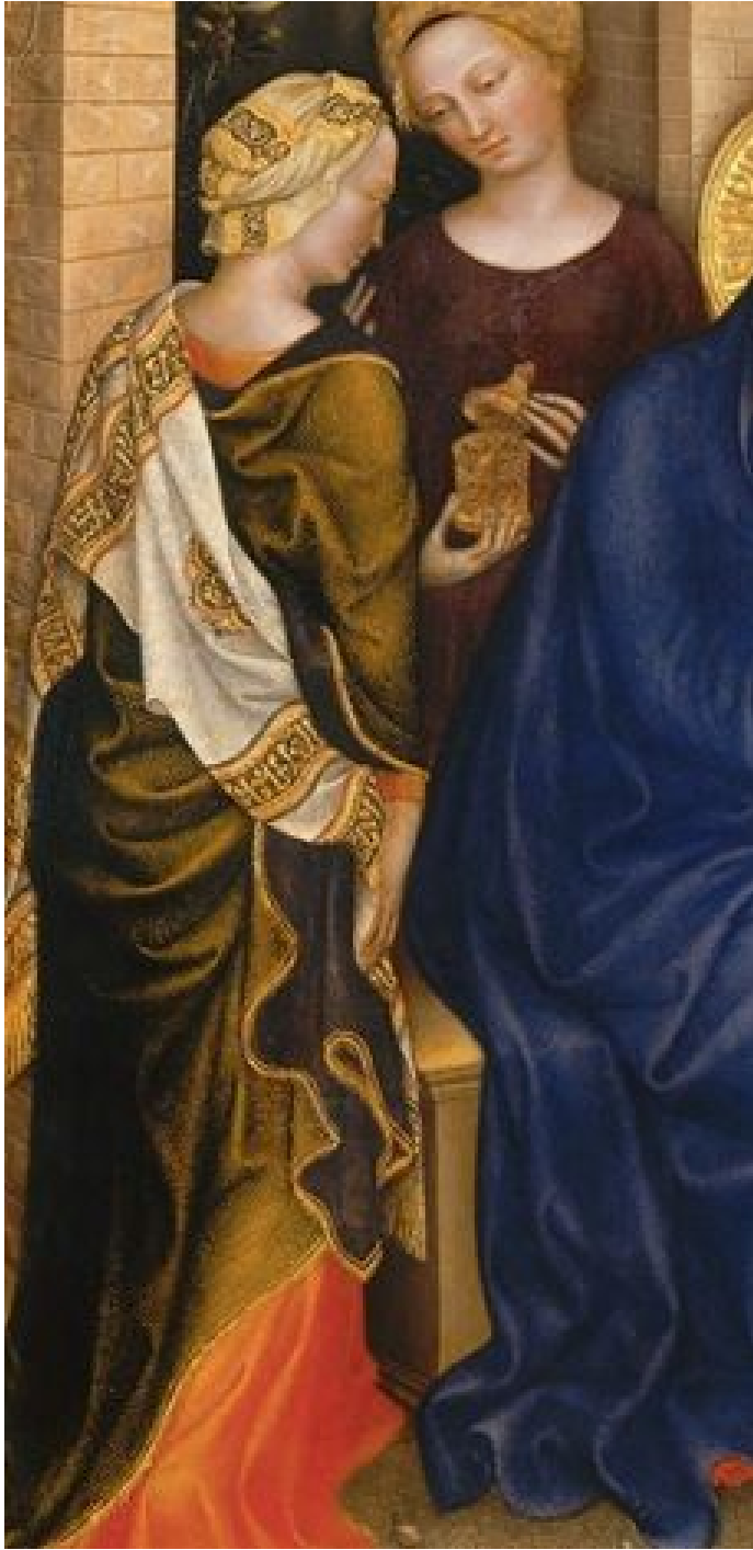
Fig. 9. Gentile da Fabriano, Adoration of the Magi , detail of the woman wearing a pseudo-inscribed mantle.