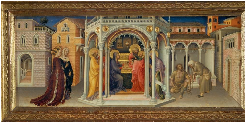
Fig. 6. Gentile da Fabriano, Adoration of the Magi , detail of the predella scene the Presentation at the Temple .