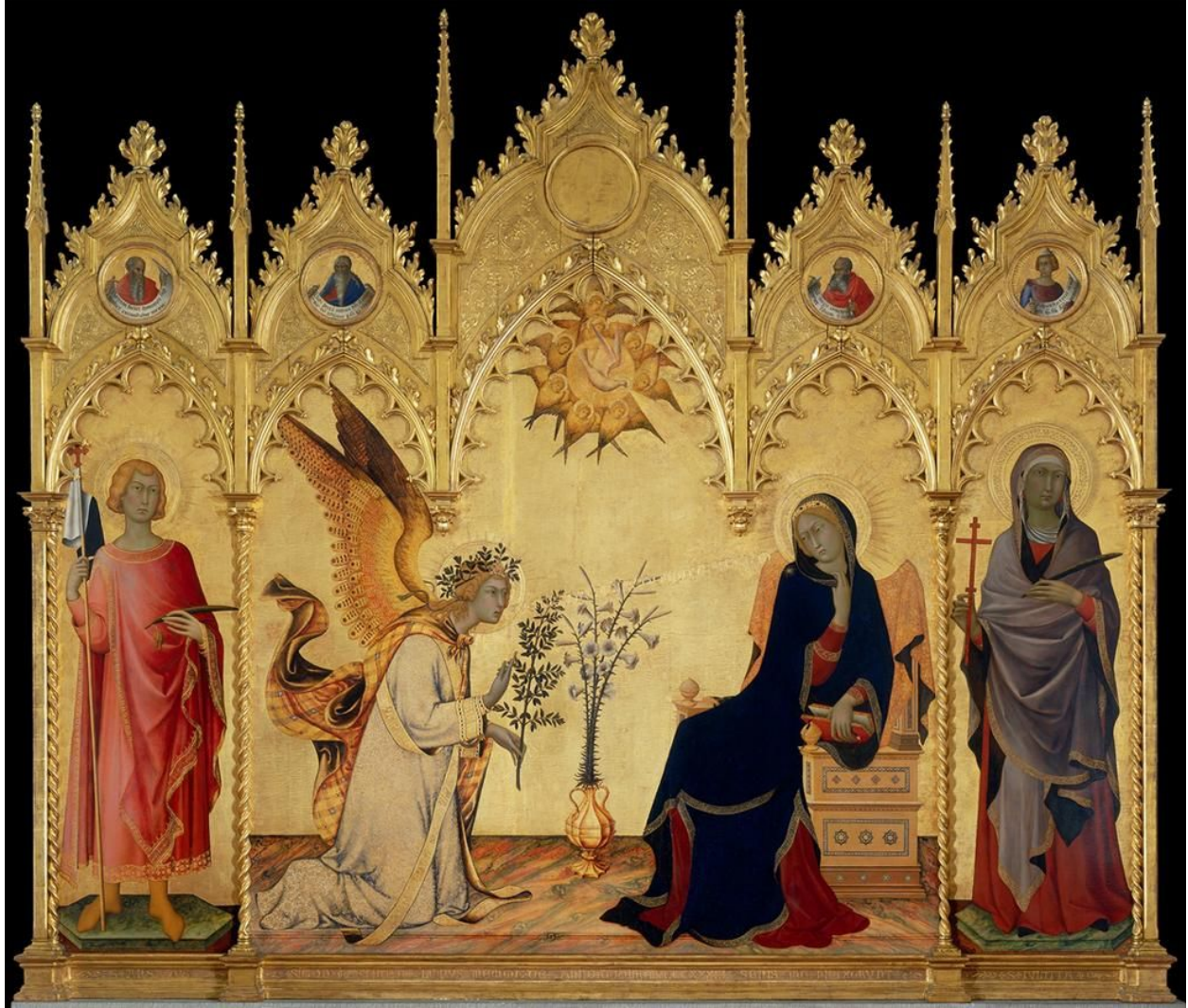
Fig. 16. Simone Martini and Lippo Memmi, Annunciation with St. Margaret and St. Ansanus , 1333. Tempera and gold on panel. 120 in × 104 in. Uffizi Gallery, Florence.