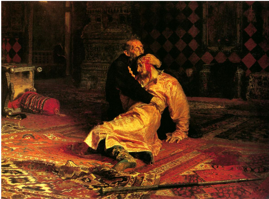
Figure 1. Ilya Yefimovich Repin (1844-1930), Ivan the Terrible and His Son Ivan on November 16 th , 1581, Oil on canvas, 1885. The artist was inspired to recreate this historical episode when reflecting on the bloody episodes from Russian history.

Ivan the Terrible was an intelligent, but brutal, 16 th century tsar of Russia. His giddy delight for all things bloody and carnal was only surpassed by a religious fervor that sometimes overlapped with passionate displays of repentance in Moscow Square or with numerous reports of sacrilegious masses where he oversaw orgies of sex, rape, and torture. His legacy is largely defined by his conquest and expansion of Russia, transforming Russia from a medieval principality into a monarchic state, and frequent bouts of rage and increased mental instability throughout the later part of his life, ultimately culminating with the murder of his heir and the end of his bloodline to the throne.