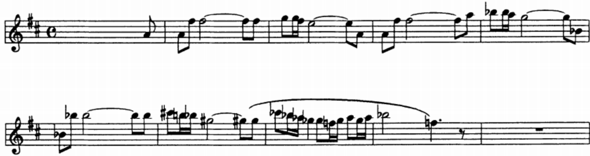
Example 10. John Williams, A New Hope , The Empire Strikes Back , Return of the Jedi : Princess Leia theme