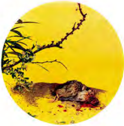
Figure 6 Hong Lei, photo

In another photo he recreated the famous silk fan painting of the Southern Song with their largely empty spaces. Delicate and nostalgic of a lost past they create the sense of loss of the southerners who retreated from the onslaught of the nomadic invaders of the eleventh century. But here nestled in the corner is a small creature, perhaps road kill. The commentary of the loss of a better culture and the rape of the environment is evident. These contrasts are all the more potent because of the contrast of the art of the past and the problem of the present.