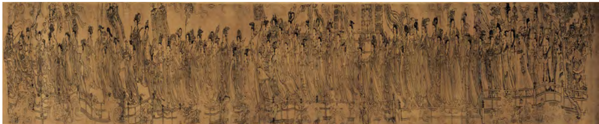
Figure 5. Scroll of Eighty-Seven Immortals , by Wu Daozi, handscroll, ink on silk, 30 x 292 cm, Xu Beihong Memorial Museum, Beijing

Also in the style of Wu Daozi is the Scroll of Eighty-Seven Immortals (Figure 5), measuring 30 centimeters vertically and 292 centimeters horizontally, is currently on display at the Xu Beihong Memorial Museum, Beijing. The painting was a handscroll, painted with ink on silk. The painting depicts 87 Taoist immortals paying homage to the supreme deity. The portrayed images come alive with vivid facial expressions and their dresses and ornaments add a vibrant touch to the painting's artistic appeal. This painting is notable for the painters' imagination and expressiveness with the brush, and is considered one of China's best achievements in line drawing techniques of classical portraits. This is a good example of a composition of outlined figures with black lines. Only black ink and freely painted brushstrokes are used. The lines are vividly expressive and alternately thick and thin, with inner tensions. This painting was in distinct contrast to the other paintings of this era where artists used brilliant color and precise borders used by Wu Daozi's contemporary artists. 12