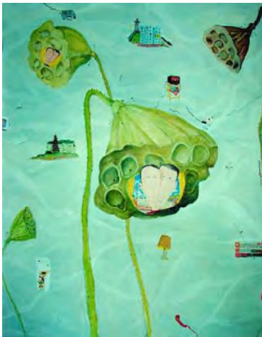
Figure13, Yang Jingsong, Series: Works With No Series

diversity of objects in their apartment. The consumer products are colorfully portrayed in minute detail. 49 In his piece, Works with No Series (Fig.13), shows the pix tradition “Blue and Green” Tang palette. He and his wife’s heads and upper bodies are inscribed within the lotus. We can see that the background uses the pix tradition blue with natural ripple. There are some small details in this painting and he concerns with the disparity in the size of the objects is surrealistic. For example, there is a tiny factory on the top of painting and a small desk lamp on the bottom right of painting. The lotus was drawn relatively large and using different types of green to depict the three-dimensional of painting. Although the portrait is drawn smaller than the other object, it cannot be ignored. This painting makes us think about our life and how when facing social issues we are small. His work always depicts unique paintings into the daily existence of the artist in the China today.