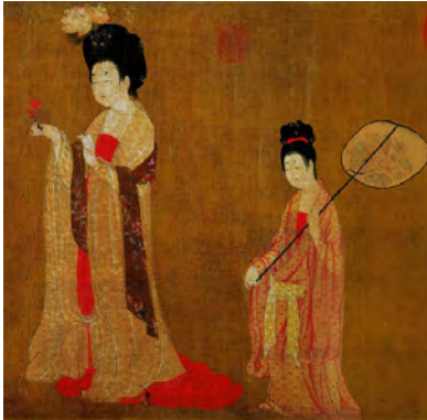
Figure 10 detail of Ladies with Head-pinned Flowers , 46 cm x 180 cm, in the Liaoning Provincial Museum

Court Ladies Playing Double Sixes , (Figure 11) painted by Zhou Fang currently held at Taipei Palace Museum. Double-sixes is a lost chess game that first appeared in China during the Three Kingdoms period (220-280) and became popular in the Sui (581-618), Tang, Song (960-1279), and Yuan (1279-13689) dynasties. 21 In this painting a beautifully dressed woman sits on a stool, looking down at the game board smiling, as the woman opposite her takes her turn. The dignity and elegance are all showed in the cheerful countenances of the ladies and their magnificent clothes. On the contrary, maids look humble with hardly countenance in the court atmosphere. Under the brush of Zhou Fang, the scene of leisure and aristocratic playing seems complex with mixed feelings of joy and sorrow. 22