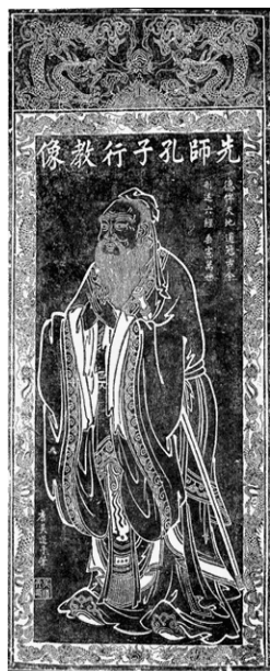
Figure 4. The Portrait of Confucius , rubbing of an engraving after Wu Daozu, eighth century, Qufu, Shandong Province. (After Native Place of Confucius , Kong Yanglin, ed. [Zhejiang peoples Press, 2000]:98)

Wu Daozi drew many art works in his life. The Portrait of Confucius , (Figure 4), Wu Daozi made for the Qufu Confucius Temple in Shandong, an image of Confucius holding jade tablets, which were used to designate feudal rank; it became quite famous. 10 A rubbing of an image attributed to this artist shows the sage as an old bearded man; he turns to the right and slightly inclines his body. Wearing a long, formal court robe with an ornate border and a small cap on his bald head, he clasps his hands together. 11