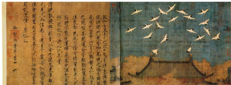
Figure 12, Song Emperor Huizong, Auspicious Cranes , Hand scroll, ink and colors on silk, 51.0 x 138.2 cm. Liaoning Provincial Museum.