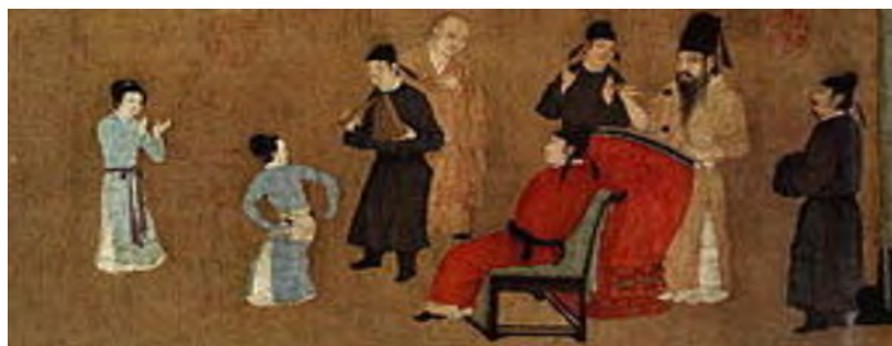
Figure 1.2 The Second Section: Han Xizai and his guests watch dancers.