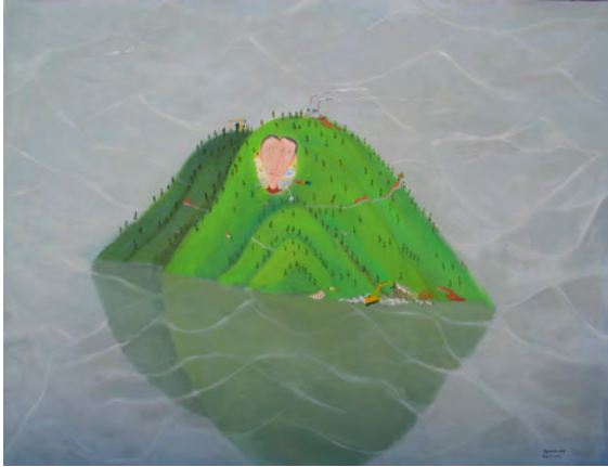
Figure 14, Yang Jingsong, Shanshui