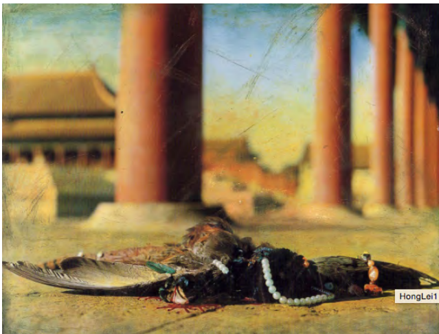
Figure 5. Hong Lei, Autumn in the Forbidden City , East Veranda, 1997 Color photograph, 104.1 x 127 cm

purposes. Hong Lei modeled on the imperial court paintings of the Song Dynasty by using real birds and flowers and arranging them in a composition of the court flower-and-bird painting (Figure 5 and 6) of Song Dynasty with an aristocratic taste. But since he depicted dead birds, the images look sad at the same time. To escalate the “morbid beauty” he found in the historical works, he placed dead birds entangled with bloodstained jade and turquoise necklaces in verandas in the Forbidden City. 61 Employing a ground-level vantage point and a shallow depth of field, Hong has created the sense of infinitely receding space and time, as though the dead bird in the foreground. 62 The dead bird, a common motif in Hong Lei’s work, suggests drama and death at the heart of China’s empire.