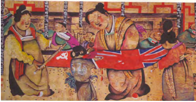
Figure 6, Zhu Wei, b 1966 Comrades , ink and color on paper, 1995