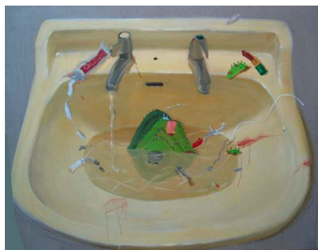
Figure16, Yang Jingsong, Sink 2004.6 (oil on canvas 150cm x 190cm)

similar with the Fig. 14 Yang Jingsong, Shanshui . We can see the though three-dimensional modeling with light green and dark green. The background is red cloud. There is a small airplane and the factory of polluting the air. These large paintings of oversized objects elicit Lilliputian images of a gargantuan race, or the worlds within worlds found under a microscopic lens. 51 His paintings are unique in that they expose intimate and personal views of the world around him in a simple manner. They are not shocking or screaming in color, they are simple renditions of people and objects in his life. 52