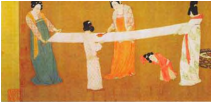
Figure 7, Zhang Xuan, Ladies Making Silk , Tang dynasty eighth century, (later copy), ink and colors on silk, Boston Museum of Fine Arts.

Zhu Wei uses a muted palette, except for the vibrant red, that contributes to a nostalgic atmosphere, while his mastery of ink washes creates unique pictorial transparency and radiant surfaces reminiscent of aged silk. Mounting the panels on vermilion colored silk, Zhu Wei integrates the glaringly brilliant red border into the organic color composition of the painting. Such an inventive and daring use of color, emblematic of Zhu Wei's highly successful works, demonstrates his acute sensitivity to both aesthetics and political symbolism.