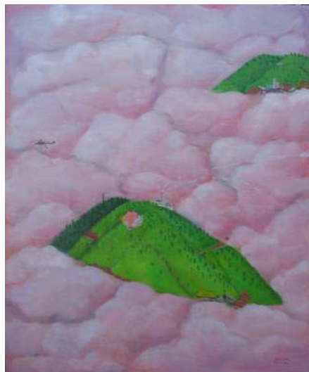
Figure17, Yang Jingsong, Red Cloud 2004.6 (oil on canvas 150 x 190 cm)