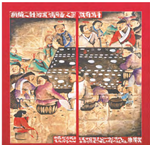
Figure 3, Zhu Wei, Pictures of the Strikingly Bizarre-Hand-Washing Ritual, ink and color on paper, mounted on silk and panel, diptych, framed.

Left: 134 by 67 cm., 52 3/4 by 26 3/8 in. Right: 134 by 64 cm., 52 3/4 by 25 1/4 in. executed in 1994