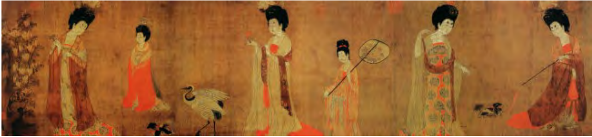
Figure 9. Ladies with Head-pinned Flowers , 46 cm x 180 cm, in the Liaoning Provincial Museum