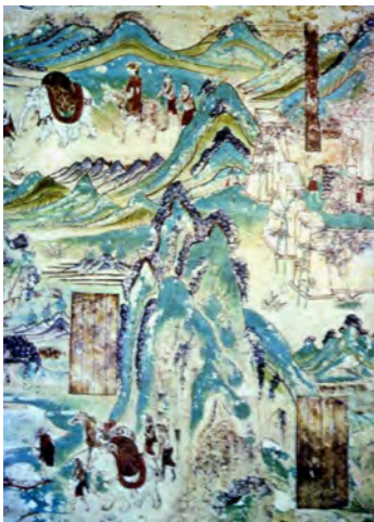
Fig 15. Dunhuang Cave 103 Tang dynasty, Dunhuang Gansu

In the Yang Jingsong's others work, we can also find the inspiration of ancient art and the surrealistic size of the objects, but tells a totally different story. The kitchen sink (Fig.16), filled with water dripping from its faucet, is home to an island: at its crest is a miniscule portrait of the artist and his wife. Spent cigarettes and watermelon rinds float in the surrounding sea; an electric plug immersed in the water dangles off the side of the sink; and near the faucet, toothpaste oozes out of its tube. Yang Jingsong still likes using the pix tradition Blue and Green Tang palette to depict the hills. We can clearly see the three-dimensional of this painting. Another painting, Red Cloud 2004.6 (Fig.17), is