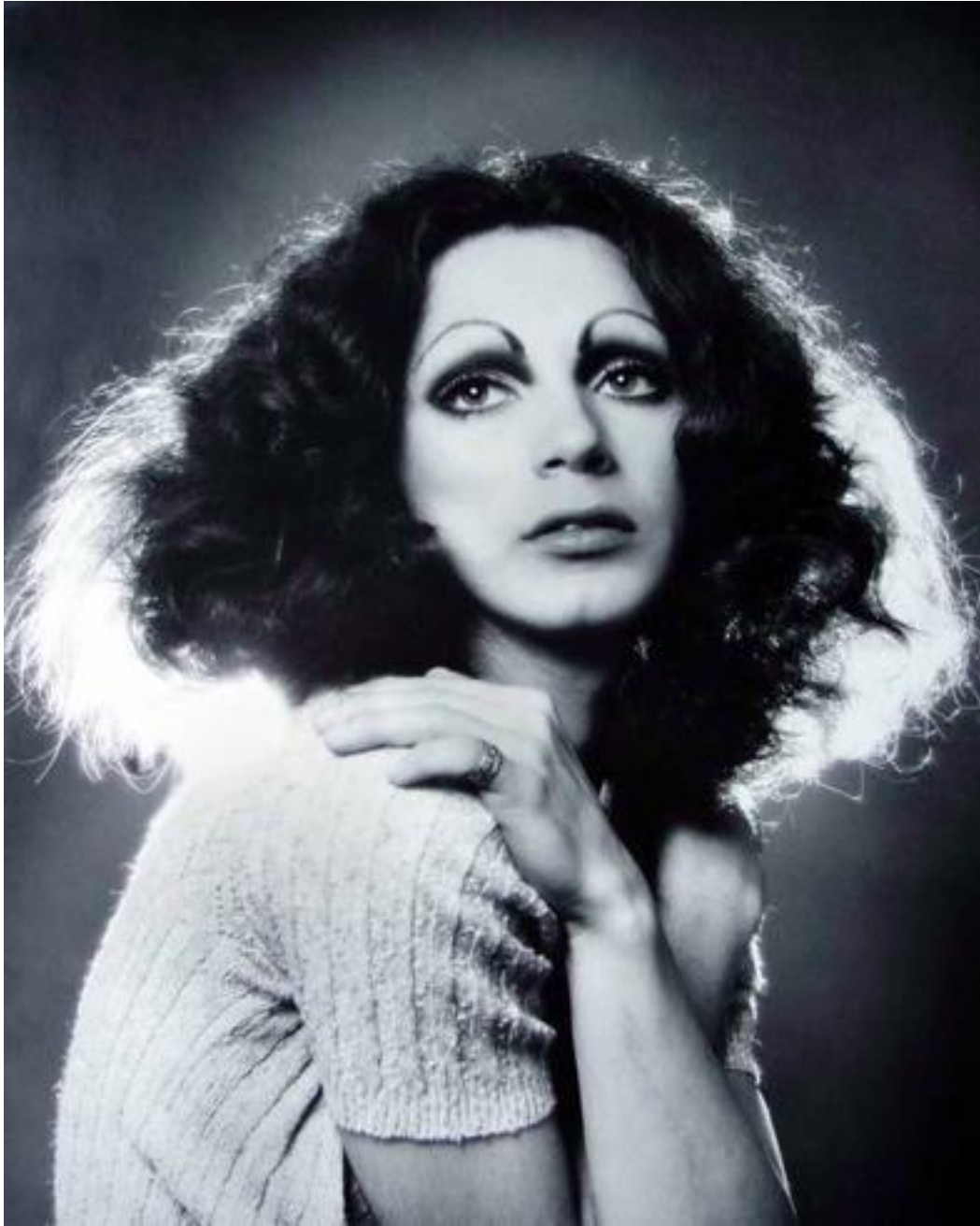
Figure 16 Jack Mitchell, Photograph of Holly Woodlawn, 1970, Photograph.