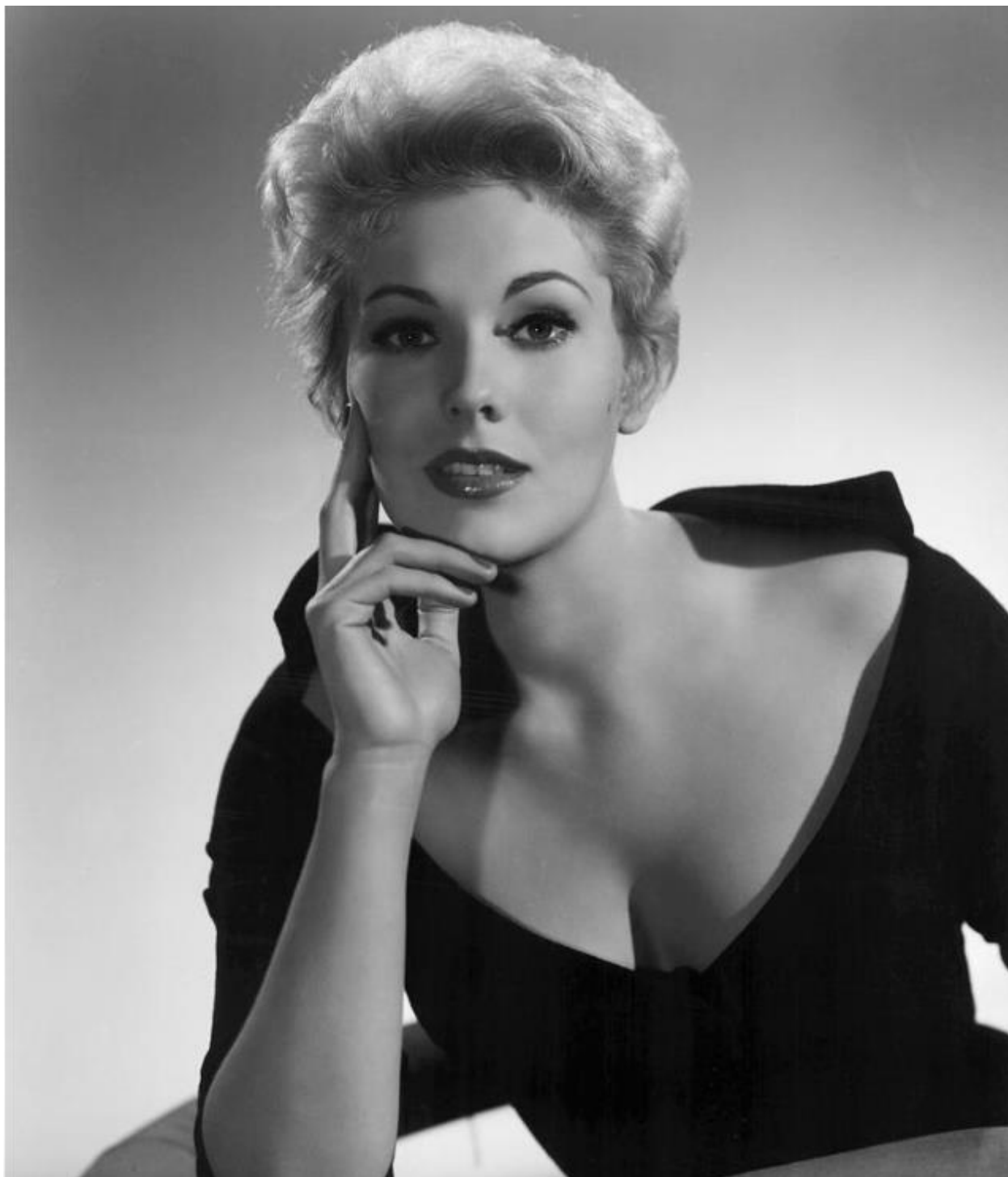
Figure 12 Everett, Photograph of Kim Novak, 1956, Photograph.