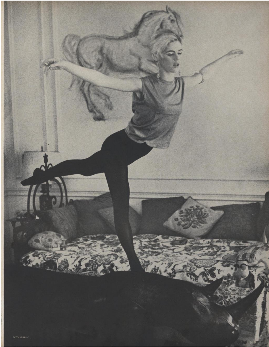
Figure 21 Enzo Sellario, Edie Sedgwick, Photograph. Available from: The Vogue Archive, (accessed April 13, 2016).