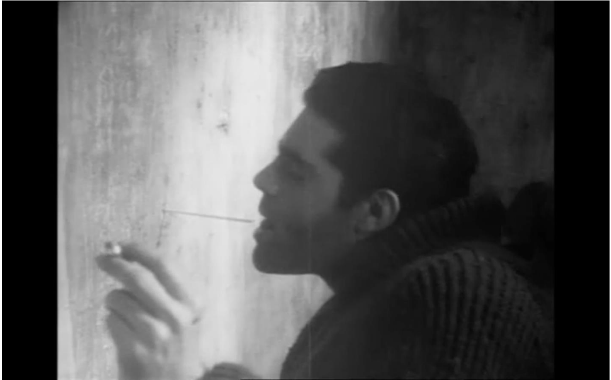
Figure 2 Jean Genet, Un Chant d'Amour, 1950, film, black and white.