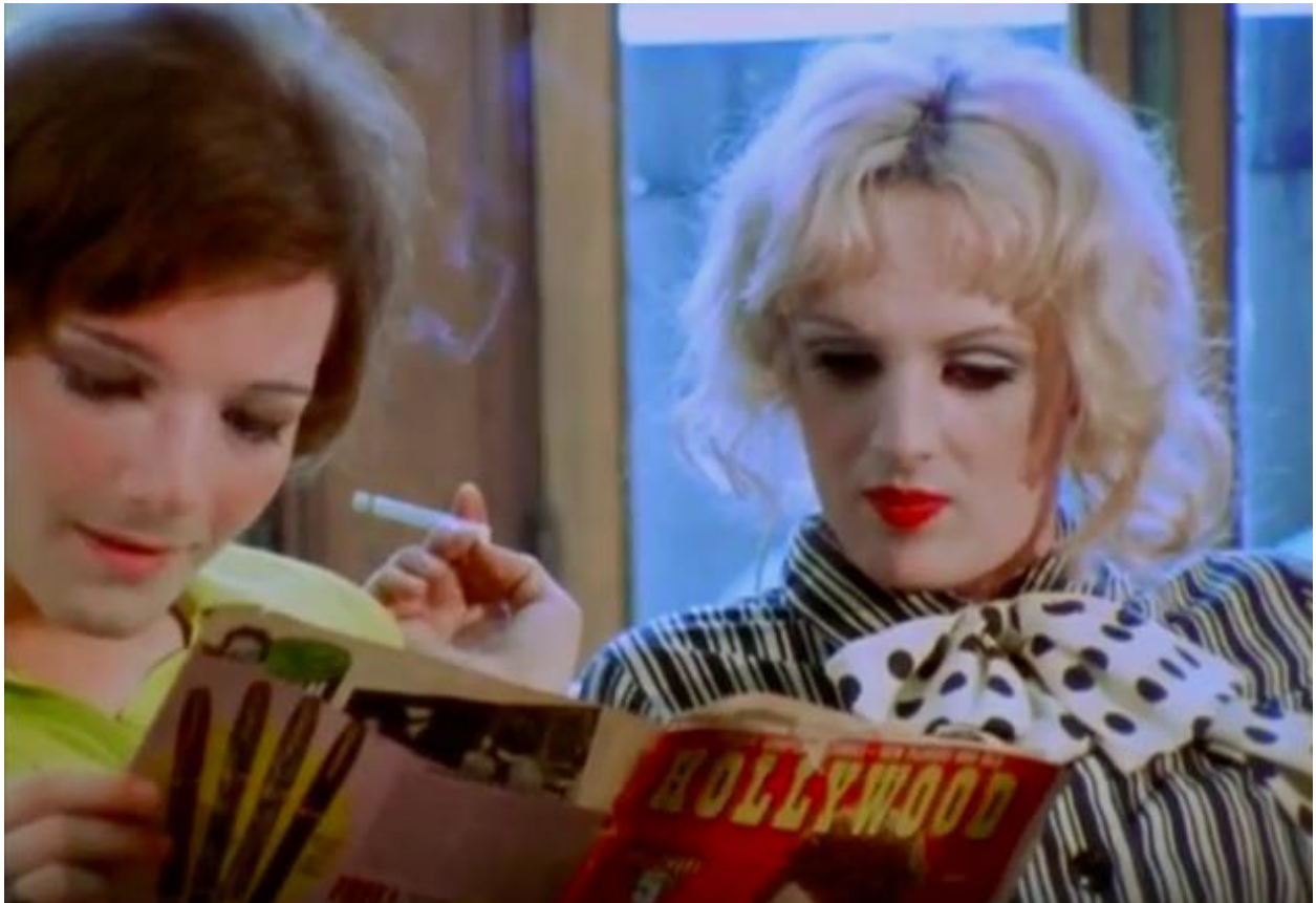
Figure 18 Jackie Curtis and Candy Darling in Paul Morrissey's Flesh, 1968, Film still.