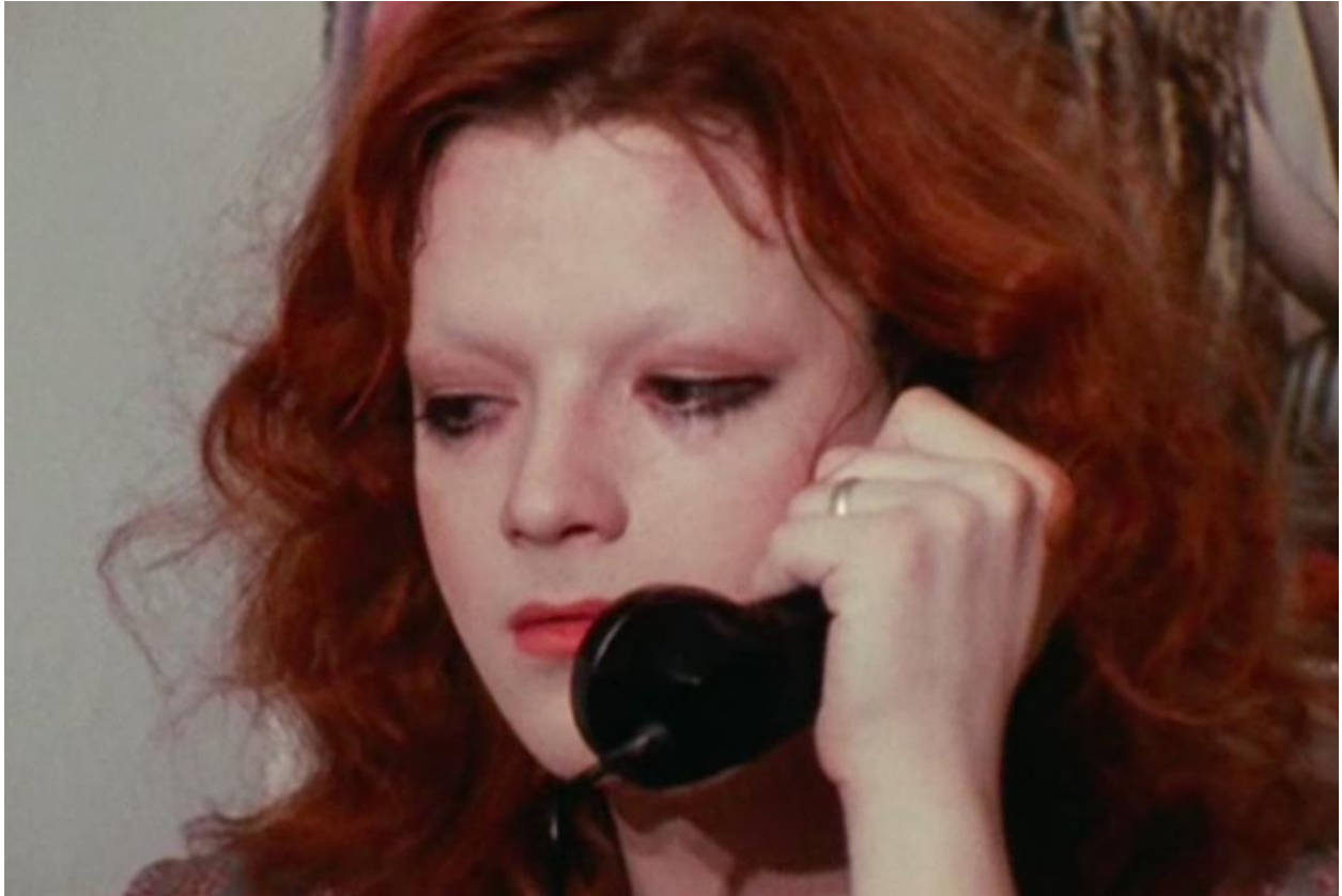
Figure 20 Jackie Curtis in Andy Warhol's Women in Revolt, 1971, Film still.