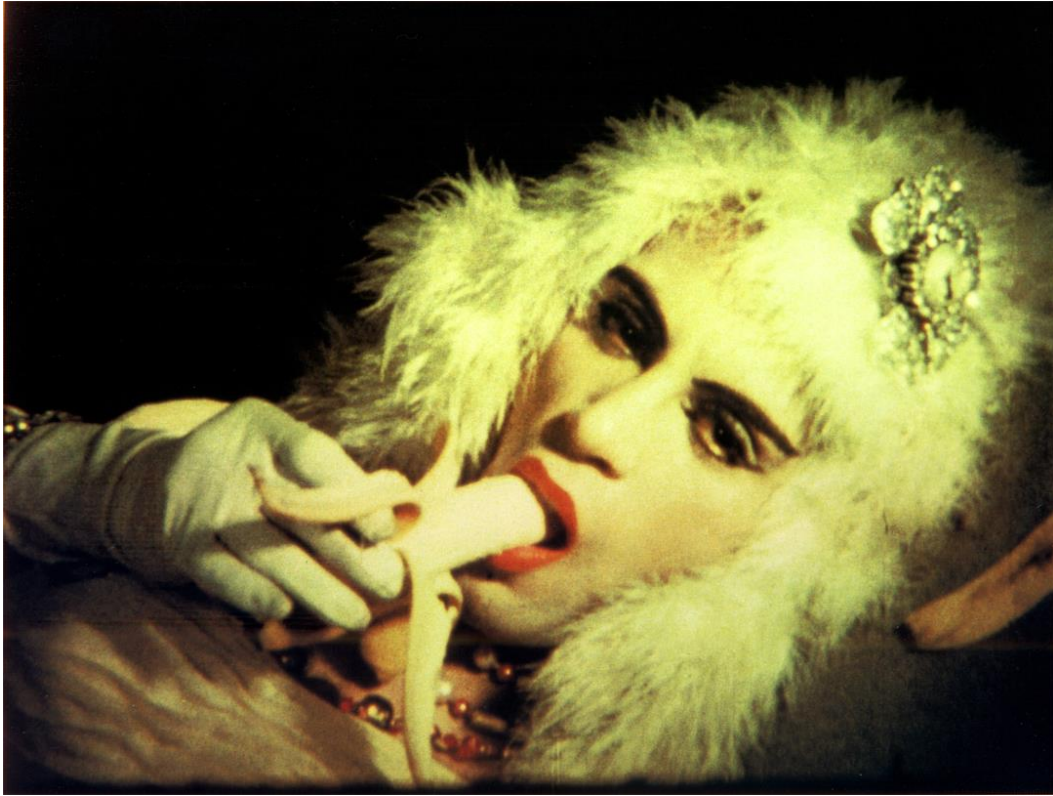
Figure 9 Mario Montez in Andy Warhol's Mario Banana, 1964, Film Still