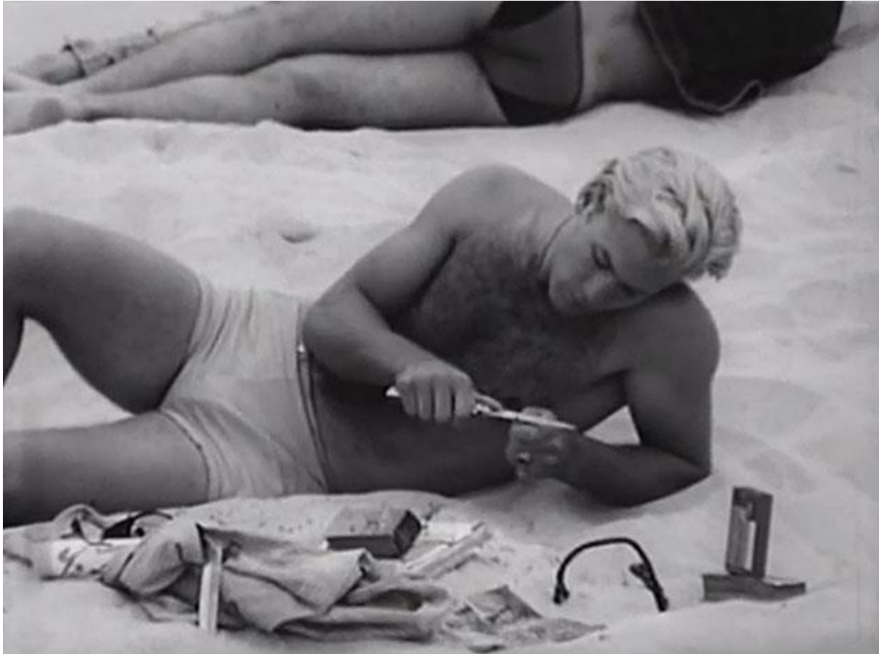
Figure 4 Andy Warhol, My Hustler, 1965, Film, Black and white. Available from Advocate, advocate.com (Accessed April 20, 2016).