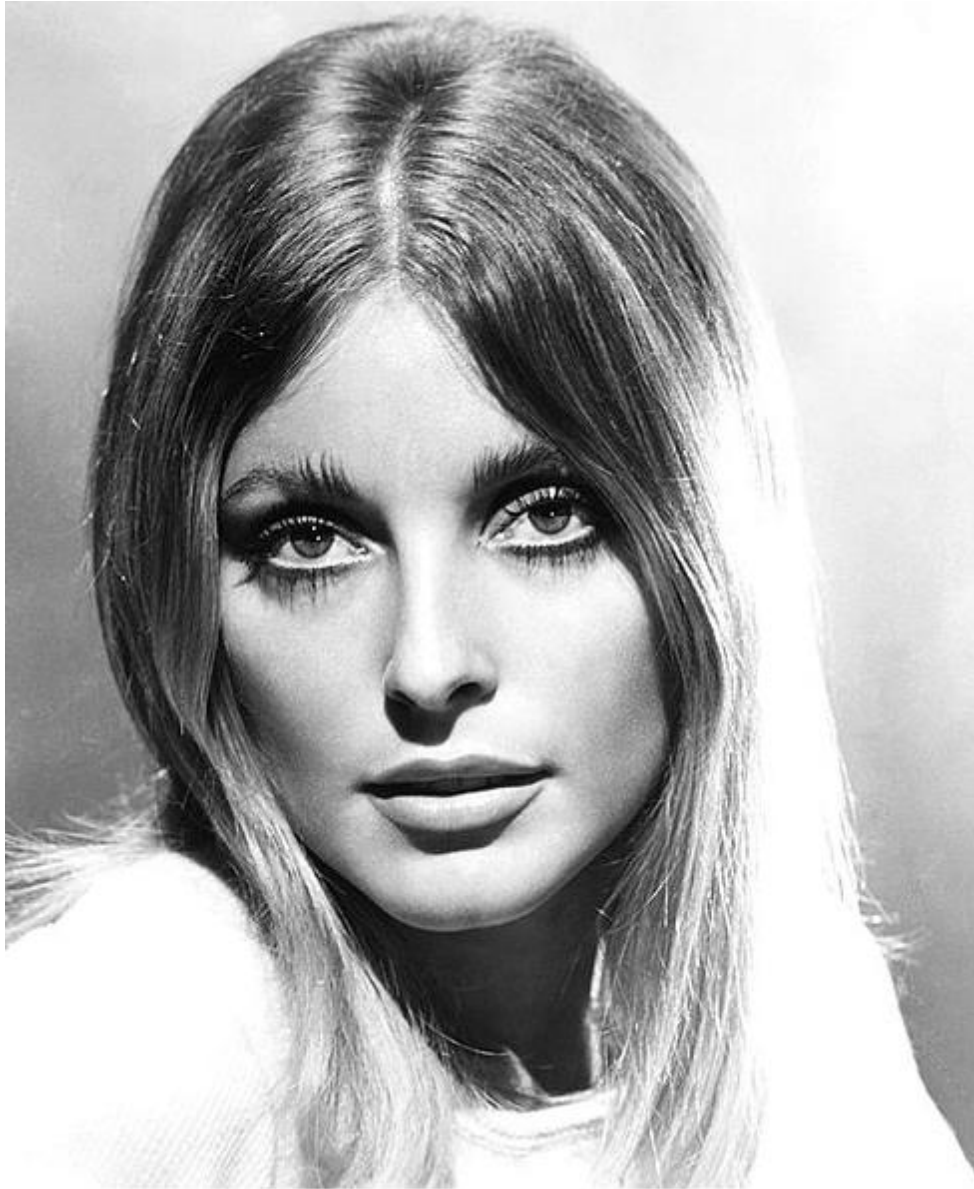
Figure 17 Twentieth Century Fox, Photograph of Sharon Tate, 1967, Photograph.