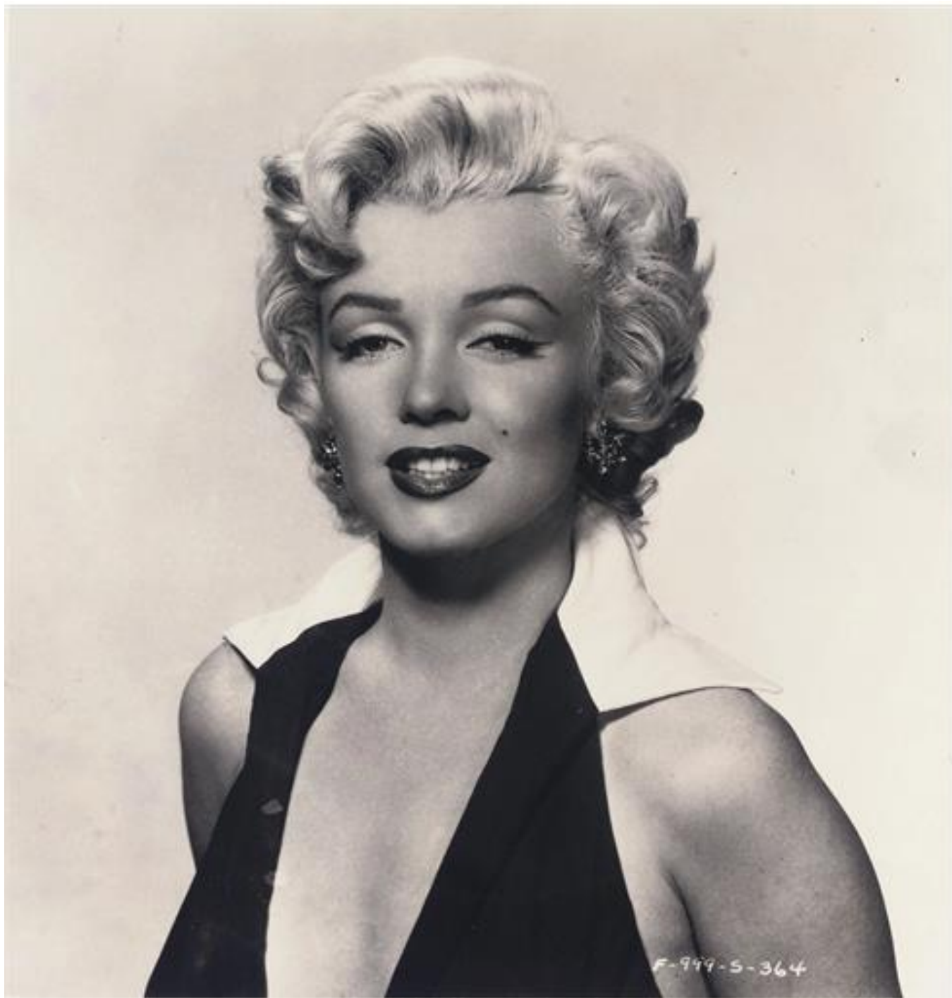
Figure 13 Frank Powolny, Marilyn Monroe, 1953, Gelatin silver print.