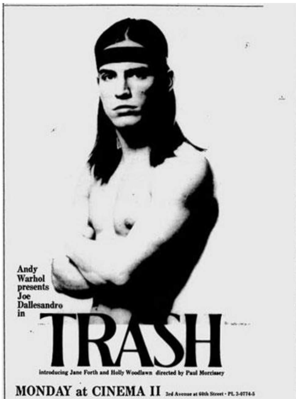
Figure 8 Village Voice advertisement for the opening of Trash, 1970, Advertisement. Available from Warholstars.org, warholstars.org, (accessed May 1, 2016).