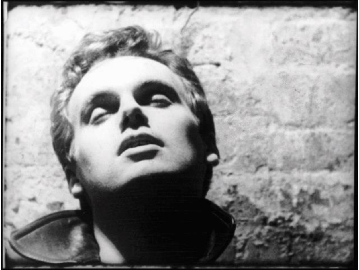
Figure 1 Andy Warhol, Blow Job, 1964, 16mm film, black and white.