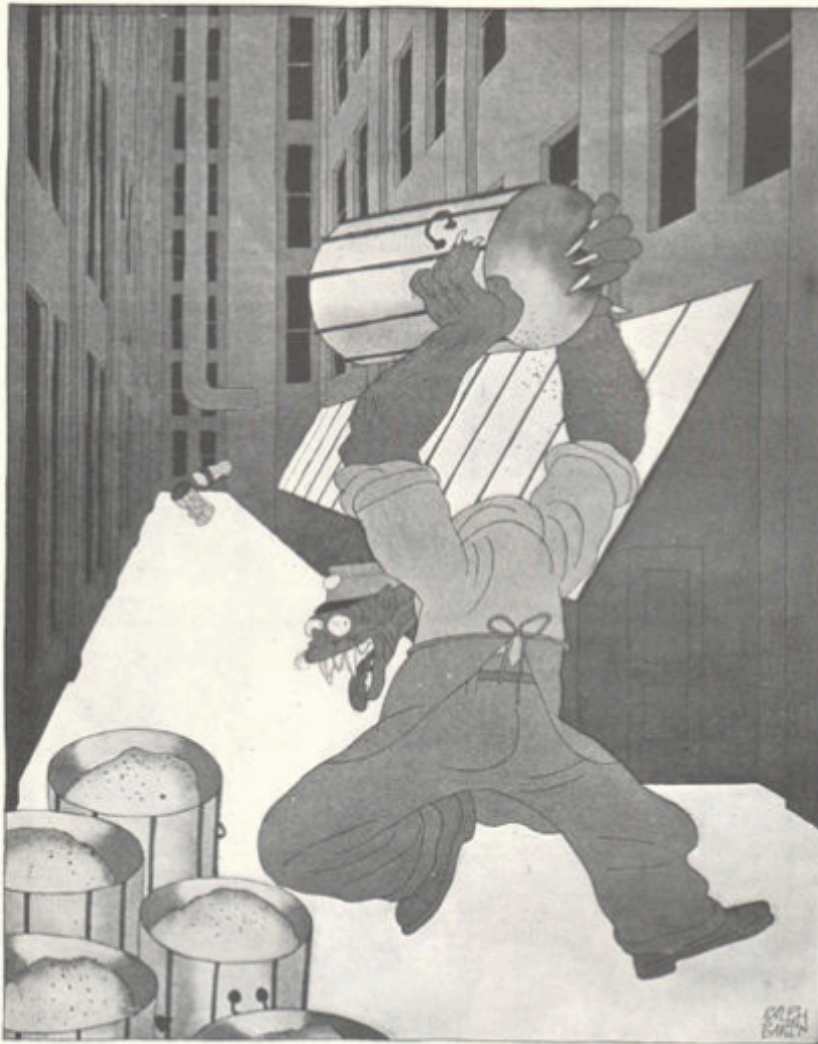
THE SORT OF THING THAT BRINGS JOY TO THE ASHMAN'S BLACK HEART A WHOLE, NICE, NEW, BIG, TWENTY-STORY, CO-OPERATIVE APARTMENT HOUSE TO WAKE UP AT SIX IN THE MORNING