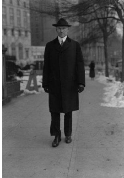
Walker D. Hines in 1919. 181