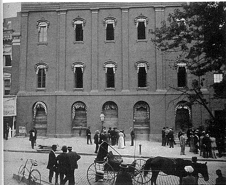
Ford's Theatre, Washington, D.C. 1893.

These romantic tastes persisted down to the closing days of the war, when the last and greatest of the dioramas announced as its climax: