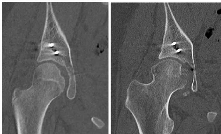
Fig. 2. A and B. Representative slices of CT scans at the same depth taken 2 years apart demonstrate the interval development of CAM lesion of femoral head. A). Immediate postoperative CT scan. B). 14 months postoperatively the posterior wall fracture has healed with no degenerative changes seen. There has been interval development of a CAM lesion.