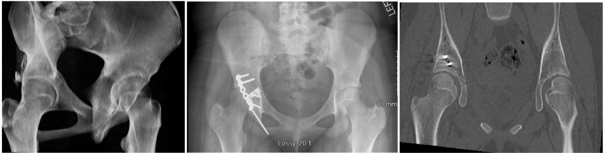
Fig. 1. A–C. A). 3D Recon image of a right posterior wall acetabulum fracture. B). Immediate postoperative radiographs and C) immediate postoperative CT scan showing interval hardware placement and no preexisting CAM lesion.

acetabular fracture with substantial capsular attachments was identified. The fracture fragment was reduced, wired provisionally, and then secured with a spring plate pelvic reconstruction plate used in buttress fashion (Fig. 1). The obturator internus and piriformis tendons were approximated to the posterior aspect of the greater trochanter. Post-operative imaging demonstrated an anatomic reduction and no evidence of intra articular screw placement. She was discharged on hospital day 8 and remained weight of leg weight bearing for six weeks. She maintained weight of leg weight bearing and was ambulatory with the use of a walker the following day. She subsequently healed her acetabular fracture and advanced to weight bearing as tolerated at 3 months. At six months post-op she could run without pain. At one year she had complaints of right anterior thigh pain and occasional pain with rotation of the hip and was prescribed Ibuprofen. Radiography showed no evidence of osteoarthritis or degenerative changes. She then presented to clinic a month later outside of normal follow up for continued right hip pain and subjective instability after running in gym class. At this point she was referred to a hip preservation specialist for evaluation of femoroacetabular impingement that had advanced radiographically (Fig. 2).