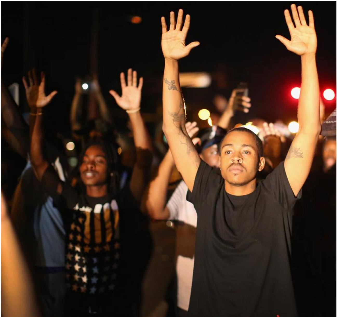
Figure 6: Demonstrators protest the killing of Michael Brown on August 12, 2014 in Ferguson, Missouri.