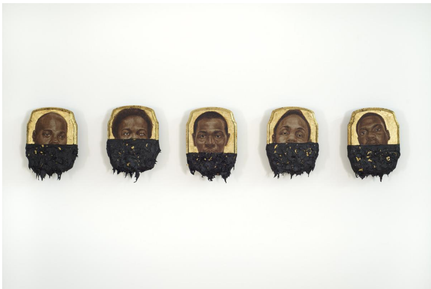
Figure 3: Titus Kaphar. The Jerome Project series, 2014 (Oil, gold leaf, and tar on wood panel) 76.5 x 59.5 in. Private collection, The Studio Museum Harlem.