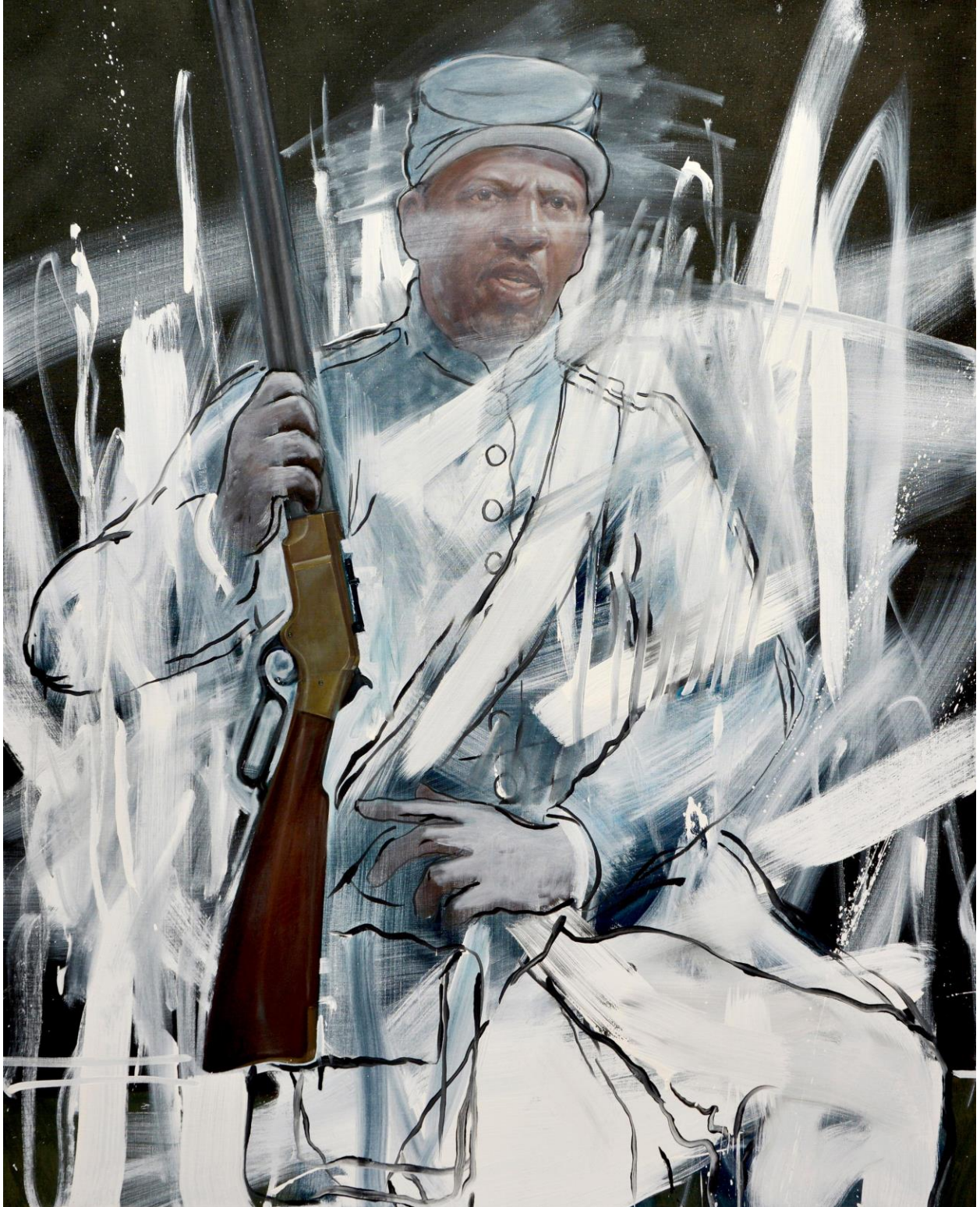
Figure 5: Titus Kaphar. The Fight for Remembrance II , 2013 (oil on canvas) Dimension unknown. Represented at Jack Shainman Gallery.