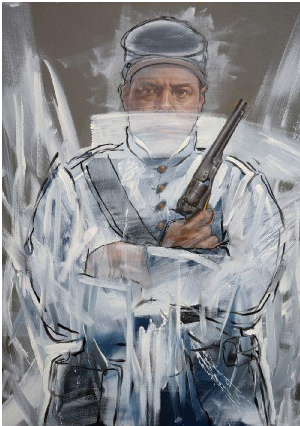
Figure 4: Titus Kaphar. Fight for Remembrance I , 2013 (oil on canvas) 62 x 50 in. Represented at Jack Shainman Gallery.