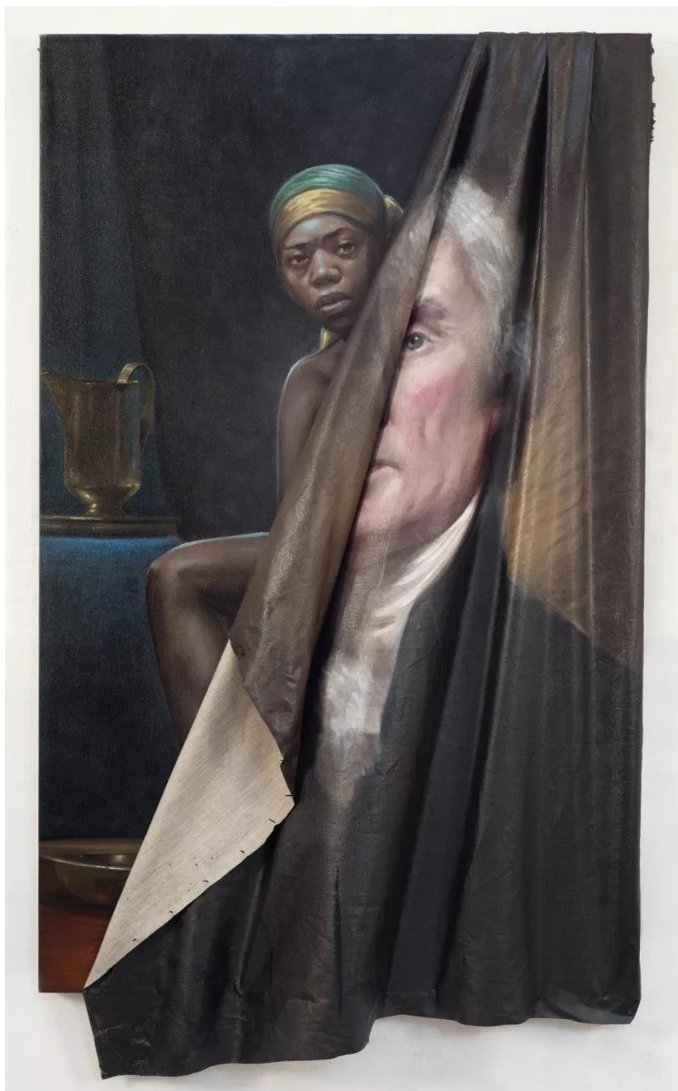
Figure 2: Titus Kaphar. Behind the Myth of Benevolence , 2014 (oil on canvas) 59 x 34 x 7 in. Represented at Jack Shainman Gallery.