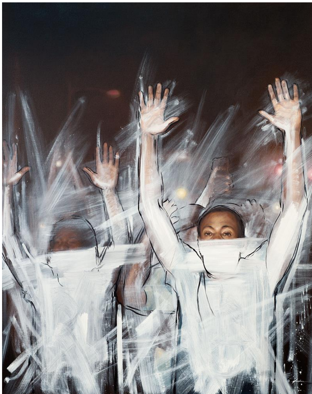
Figure 1: Titus Kaphar. Yet Another Fight for Remembrance , 2014 (oil on canvas) 60 in x 48 in. Commissioned by Time magazine. Represented at Jack Shainman Gallery.