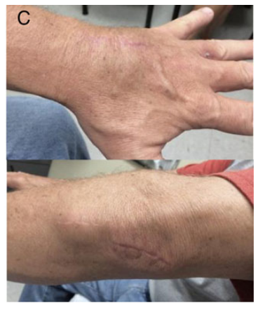
Figure 1. (A) Left wrist and elbow swelling due to Mycobacterium marinum infection. (B) Two tubes of Lowenstein Jensen medium were inoculated with the isolate and were grown in the dark. One of the tubes (tube 2) was unwrapped and exposed to direct light for 1 hour. Both tubes were reincubated for 24 hours and then assessed for pigment production. (C) The panel shows left wrist and elbow after surgical debridement and 4 months of antibiotic therapy for M marinum .

patient received 4 months of rifampin as part of M marinum/ LTBI antibiotic regimen.