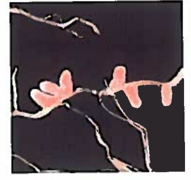
Figure 6. The bright pink color of clover nodules is a sign that the rhizobia inside are probably actively fixing N.

Rhizobia are added to clover and other forage legumes to increase their capacity to fix nitrogen (N) (Fig. 6). Mycorrhizal fungi respond to the type of crops present, and by infecting the plant roots create a 'second' root system that can exploit insoluble nutrients, like P, in the environment.