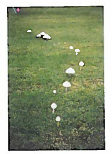
Figure 5. Fungi are the main decomposers of organic matter in soil. Mushrooms are just the above-ground manifestation of miles of fungal hyphae beneath the soil surface.