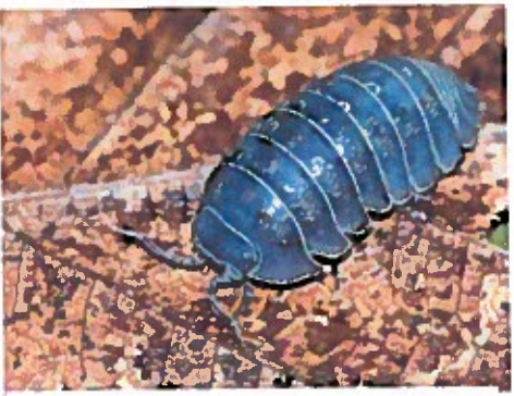
Figure 4. The isopod Armadillidium vulgare, is a species with worldwide distribution.