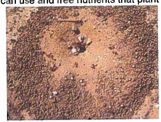
Figure 3. Ant mounds are a common scene in grasslands showing the extent to which ants help excavate subsoil and return it to the soil surface.

Large organisms such as earthworms and ants are ecosystem engineers. They burrow into soil making channels, mix organic matter (like dung beetles), and help bring leached nutrients up to the soil surface (Fig. 3). Isopods like pillbugs (Fig. 4) play a critical role in chewing up plant litter to make it accessible for microorganisms such as fungi (Fig. 5) and bacteria, which are ultimately responsible in soil for turning the complex polymers in plant and animal material into soluble compounds microorganisms can use and free nutrients that plant roots can