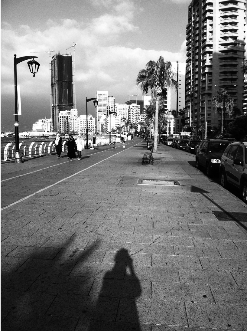
FIGURE 1.4. The Corniche.

parks, 46 the city in fact looks like it perhaps will become less, rather than more, green in the near future: in June 2103, the municipal government announced plans to demolish—and later replace parts of—a park known as the Jesuit Garden in Geitawai, a neighborhood of winding, narrow lanes on the eastern side of the city, in order to build a parking garage. Vigorous