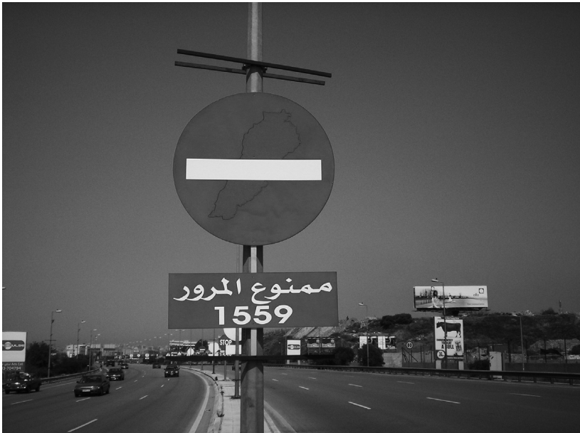
FIGURE 3.2. Traffic sign: “No foreign intervention! 1559 prohibited from passing.”

In March 2005, amid the heated contention between the just-formed March 8th and March 14th political camps, I took a taxi out toward the airport to see traffic signs that had appeared overnight along the median of the highway. They were, in fact, faux traffic signs that used the commonly recognized symbols and vocabulary of traffic control to express political sentiments