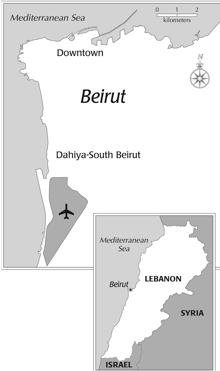
FIGURE 1.1. Map of Beirut in Lebanon and the region.