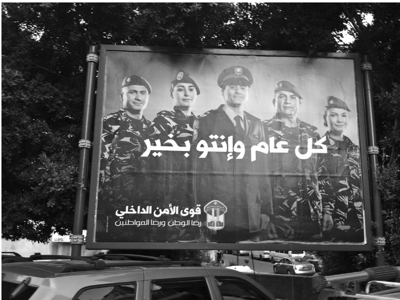
FIGURE 1.1. Internal Security Forces billboard: "Making the nation and the citizens content."

During summer 2013, in the context of a deteriorating domestic security situation because of the spillover from the Syrian civil war, billboards throughout Beirut aimed to send a comforting message about the state's interest in taking care of citizens. The billboards pictured five members of the national police agency, the Internal Security Forces (ISF). The billboard's message was "May you be well and in good health every year," an Arabic sentiment expressed on holidays and special occasions and, below, "Making the nation and the citizens content." With its kind message of well-being and smiling visages of police officers, the billboard cannily personalized and made accessible the state's security apparatus by foregrounding its workforce. This was a strikingly different political sensibility than those expressed by the banners, posters, and images that were draped throughout