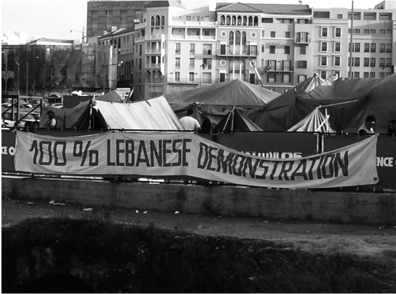
FIGURE 2.1. Tent City: Downtown protestors demand the truth about who killed Hariri and independence from Syrian control, spring 2005.

assassination in front of the seaside Phoenicia Hotel on February 14, 2005, Hariri was buried downtown across from a vacant area known as Martyrs' Square, where a statue that commemorates the nationalists hanged by the Ottoman Turks in the early twentieth century is situated. From the time of his funeral and for months afterward, a line of people wanting to visit his burial site extended out into the street, and Martyrs' Square became a tent city for demonstrators with signs demanding al-haqeeqa (the truth) about the identity of Hariri's assassin. 39