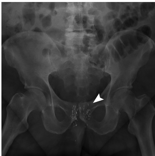
Fig. 3 – Thick maximal intensity projection series derived from a CT Urogram of the prostate shows prostate seeds in situ (different patient). The arrow indicates the location of the brachytherapy seeds.

There are sparse reports of unusual sequelae of seed migration. Single examples of radiation pneumonitis, acute myocardial infarction, and small-cell lung cancer associated with seed migration to the thorax have been reported [5–7]. Migration of seeds directly into the parenchyma of the right ventricle, as with the case detailed herein, has been reported and proven previously at autopsy, although rare [2]. Most concerns of these reports are related to fear of secondary malignancy or mortality from the radiation effect and embolization, respectively. However, a number of convincing