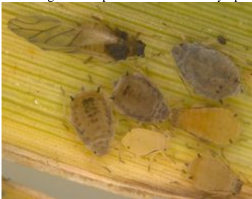
Winged and wingless adults and their nymphs.

For more information on scouting and control go to KY Pest News: www.kentuckypestnews.wordpress.com/2016/07/19/