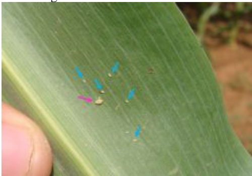
Adult sugar cane aphid and first instar nymphs.

Sugarcane aphids can be identified by their grey to tan yellow body color. Also, their cornicles or “tailpipes,” feet, and antennae are dark. (Figure 2). Sugarcane aphids feed on the lower surface of the leaves, and their feeding produces yellow to red or brown leaf discoloration, which is visible on both sides of the leaf. Indirect damage is caused by the abundant honeydew, which may support the growth of black, sooty mold fungi.