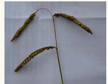
Infected Dallisgrass seedheads are often swollen and rusty or black in color

Dallisgrass (a warm season grass) is not common in Kentucky, but is slowly encroaching into the area with recent warmer summers. Pastures containing dallisgrass should be kept mowed to remove seedheads, therefore removing the risk of Claviceps paspali infections. Hay harvested from pastures containing dallisgrass should be carefully inspected for signs of infection and not fed if sclerotia bodies are found. Dr. Ray Smith believes this to be an isolated event in Kentucky and not a widespread challenge to the area. Horse and cattle owners should be vigilant to check hay and pastures regularly for the presence of dallisgrass. Since there are numerous causes of tremors and neurological abnormalities in horses, owners should contact their veterinarian immediately if they notice any animals showing neurological signs. ~ Dr. Megan Romano and Krista Lea.