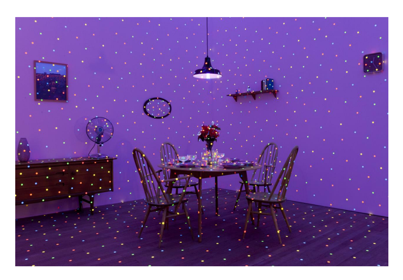
fig. 3 Yayoi Kusama, I'm Here, but Nothing , 2000-Dot sheet, ultraviolent fluorescent lights, furniture, household objects Dimensions variable

https://www.huffingtonpost.com/heidi-kim/kusama-and-cornell-an-unl\_b\_1580210.html