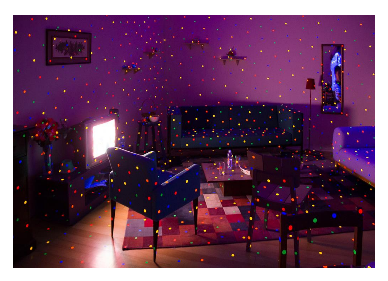
fig. 6 Yayoi Kusama, I'm Here, but Nothing , 2000-Dot sheet, ultraviolent fluorescent lights, furniture, household objects Dimensions variable

https://www.flickr.com/photos/maxunterwegs/12484562693