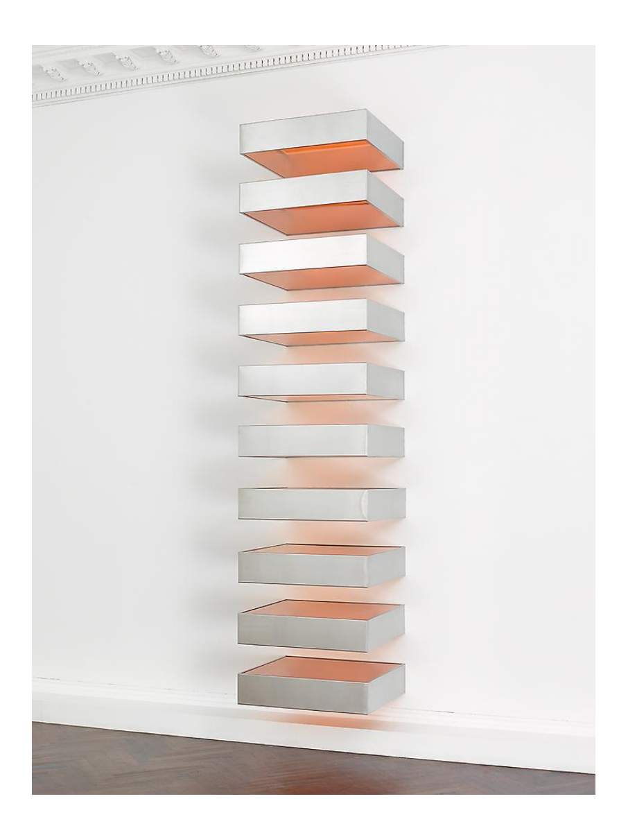
fig. 1 Donald Judd, Untitled (DSS 120) , 1968 Stainless steel and amber Plexiglass 10 units, each 6 x 27 x 24 inches (15.2 x 68.6 x 61 cm)

http://www.mnuchingallery.com/exhibitions/donald-judd