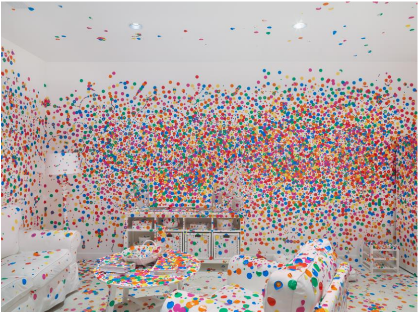
figs. 7 (before stickers) and 8 Yayoi Kusama, Obliteration Room , 2002-Furniture, white paint, dot stickers Dimensions variable

https://www.curbed.com/2015/6/3/9953460/a-prefab-house-becomes-interactive-art-in-yayoi-kusamas-obliteration