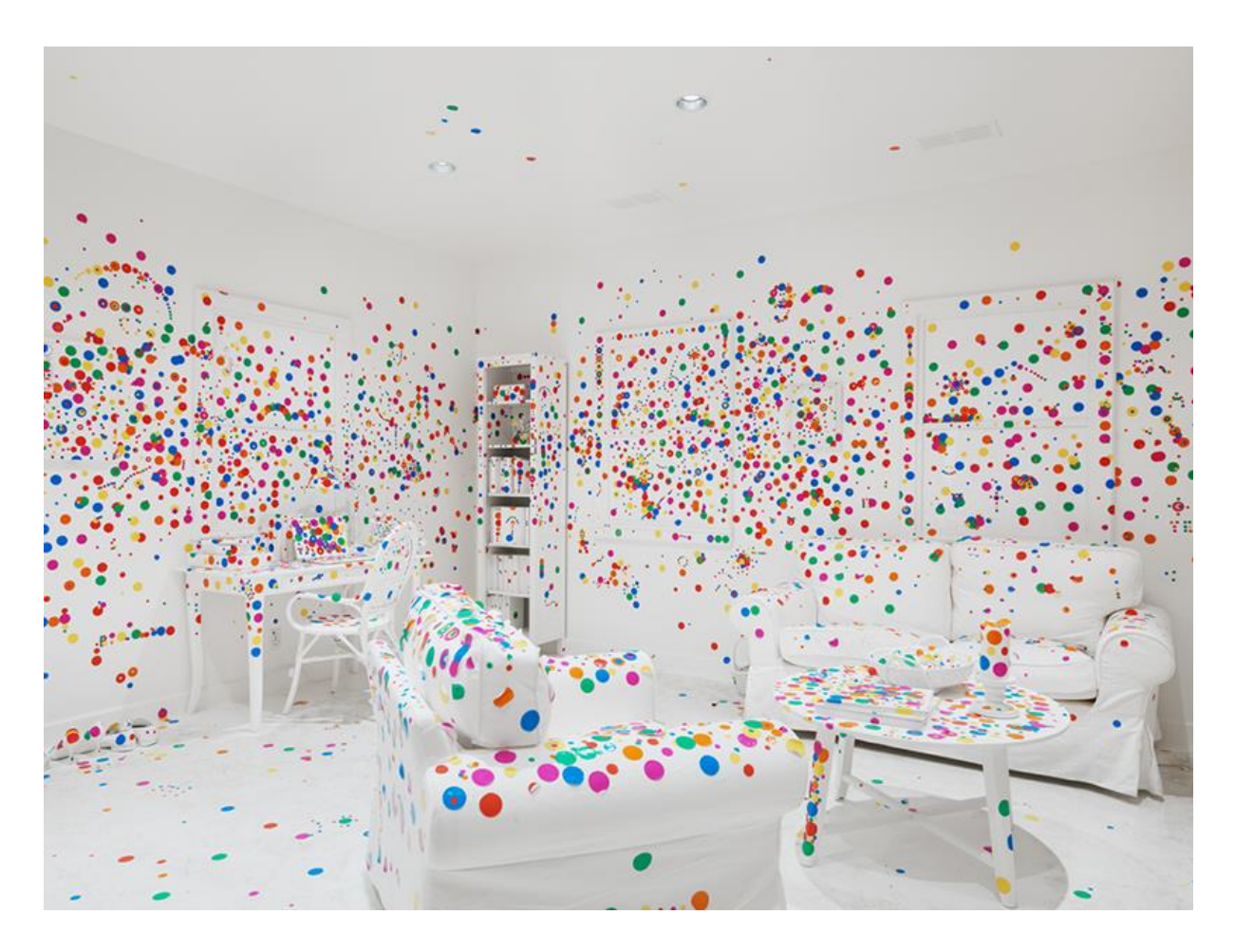
fig. 2 Yayoi Kusama, Obliteration Room , 2002-Furniture, white paint, dot stickers Dimensions variable

https://www.designboom.com/art/yayoi-kusama-david-zwirner-obliteration-room-new-york-05-26-2015/