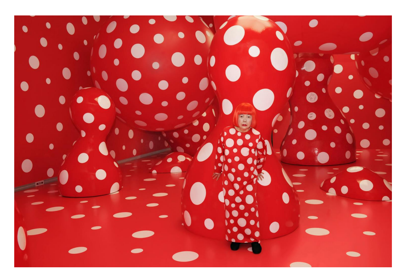
fig. 9 Yayoi Kusama with Dots Obsession , 2012

https://www.modernamuseet.se/stockholm/en/exhibitions/yayoi-kusama/