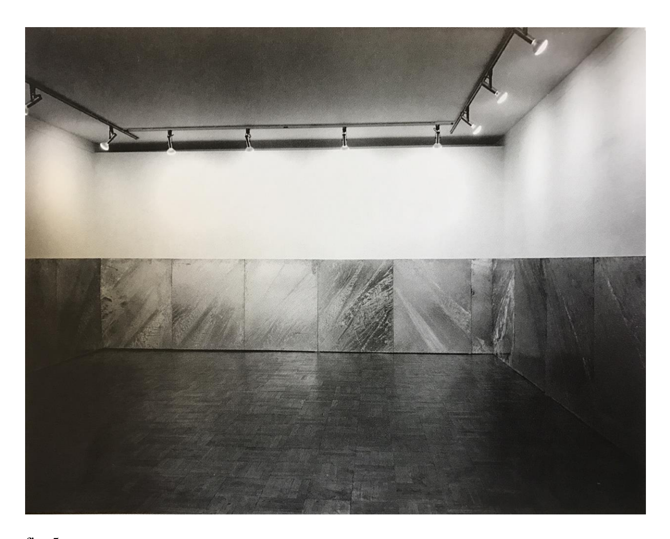
fig. 5 Donald Judd, Untitled (DSS 221) , 1970 Hot-dipped galvanized iron 15 units: each 60 x 14 in (152.4 x 122 cm); 2 units: both 60 x 41 in (152.4 x 104 cm); 1 unit: 60 x 13 in (152.4 x 33 cm)