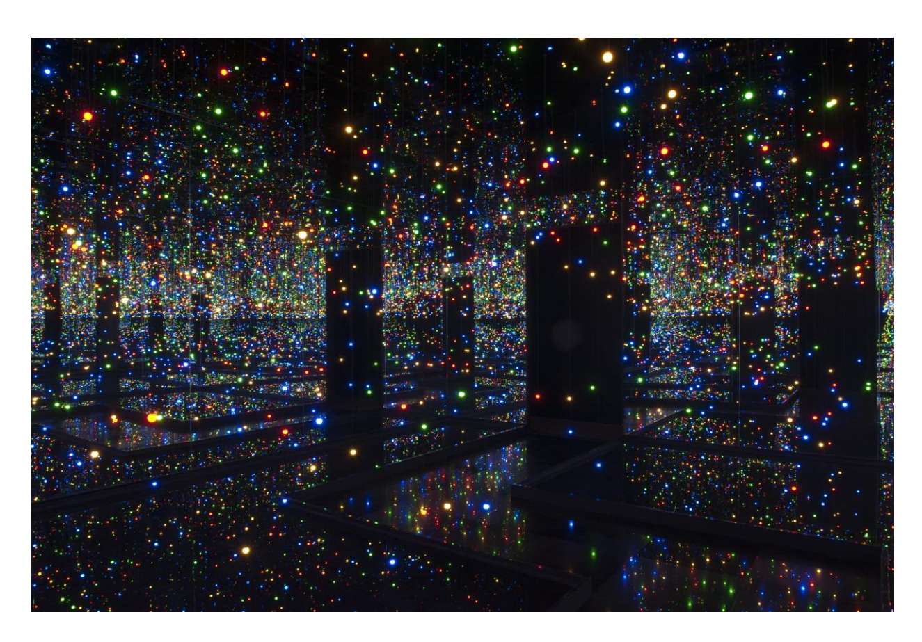
fig. 4 Yayoi Kusama, Filled with the Brilliance of Life , 2011-Room with mirror, LED lights, water pool 296 x 622.4 x 622.4 cm