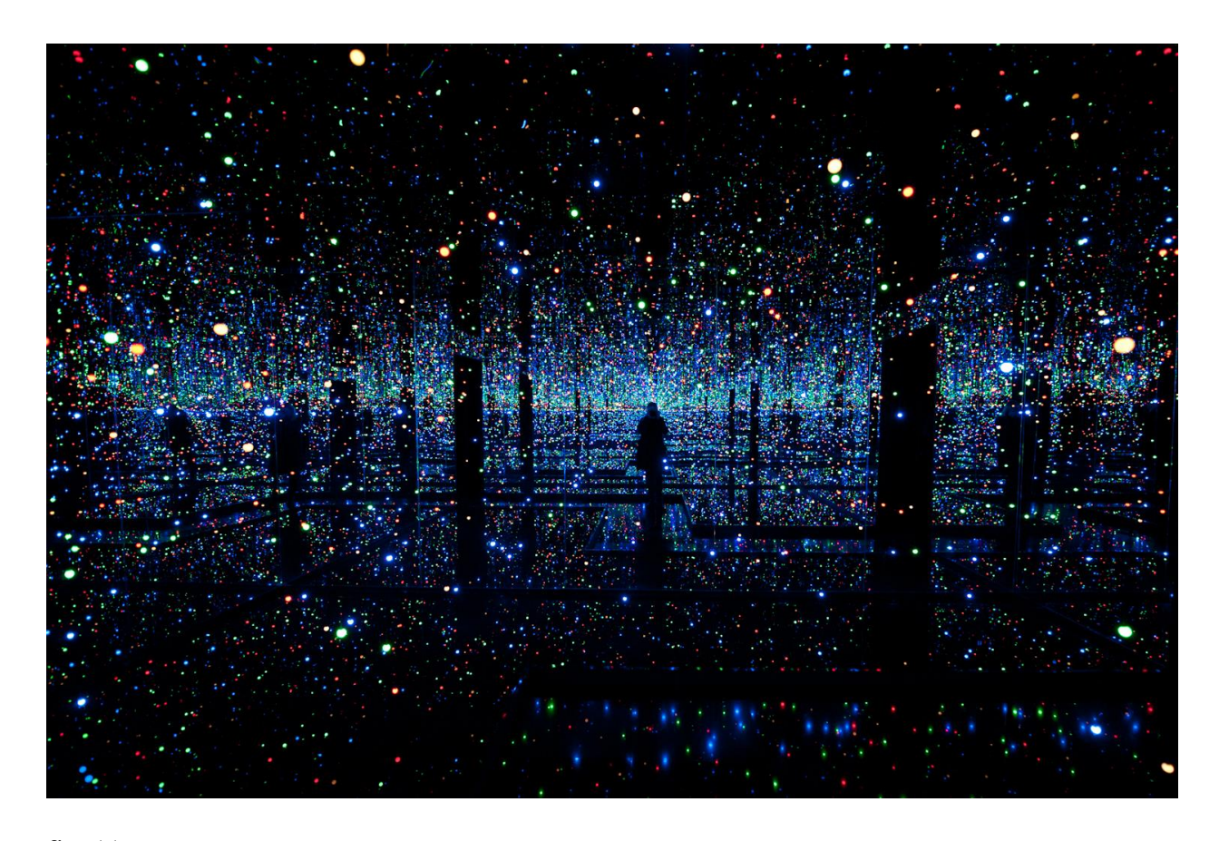
fig. 11 Yayoi Kusama, Filled with the Brilliance of Life , 2011-Room with mirror, LED lights, water pool 296 x 622.4 x 622.4 cm

https://starlightarchitecture.wordpress.com/2014/01/09/space-is-yayoi-kusamas-infinity-mirrored-room/