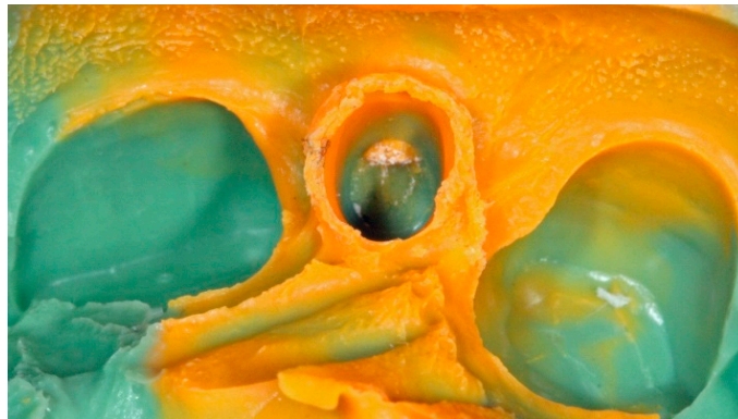
Figure 9. Conventional crown and bridge impression technique for implant abutment.

The all ceramic or metal ceramic restorations are evaluated and the contacts and occlusion are adjusted as needed then cemented on the definitive abutments with permanent cement (Figures 11 and 12). Occlusion is evaluated with an 8- \mu m foil (Shim stock Occlusion Foil, Patterson Dental, St. Paul, MN, USA) to achieve resistance to withdrawal only under maximal intercuspation [7,18]. All prosthetic restorations should utilize the manufacturer's recommended components and protocol.