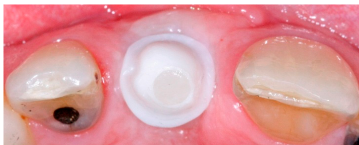
Figure 5. Zirconia custom abutment in place for anterior implant restoration with anatomic emergence profile.