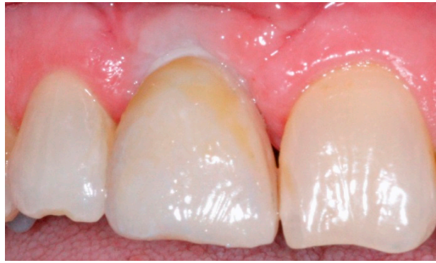
Figure 7. Provisional crown restoration for anterior implant.