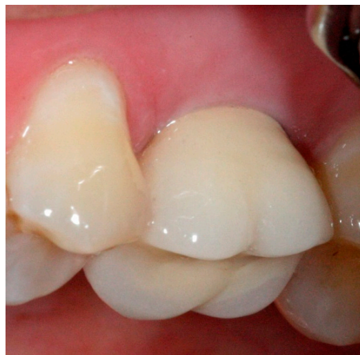
Figure 12. Posterior definitive crown cemented over definitive implant abutment.