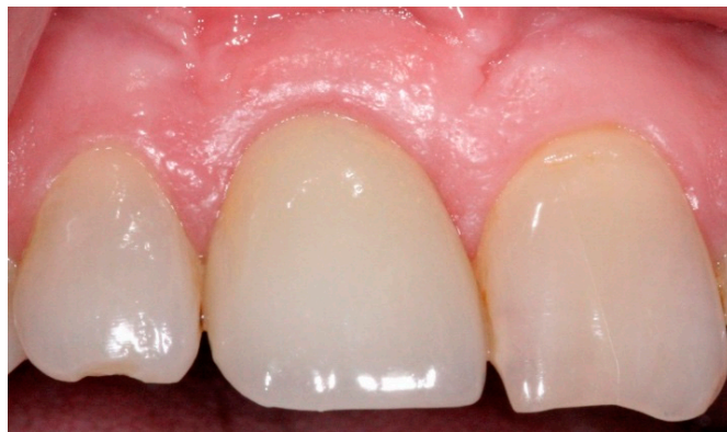
Figure 11. Anterior definitive crown cemented over definitive implant abutment.