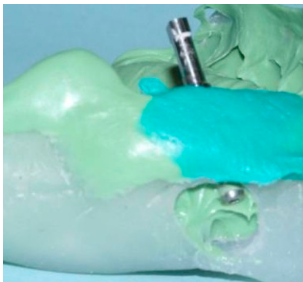
Figure 4. Implant replica connected into impression coping incorporated in PVS (polyvinyl siloxane) open tray impression technique due to malposition implant placement.