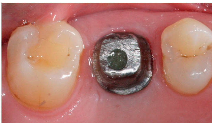
Figure 6. Titanium custom abutment in place for posterior implant restoration with anatomic emergence profile.