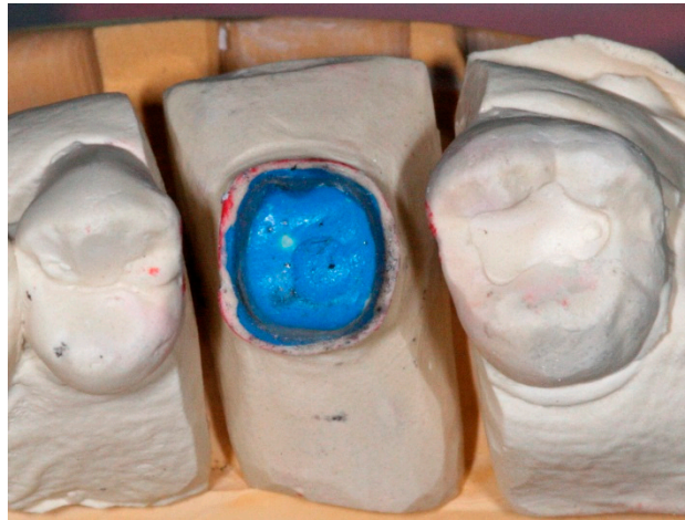
Figure 10. Conventional die for implant abutment supported crown fabrication.