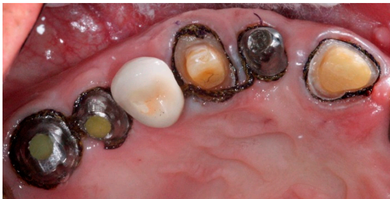
Figure 8. Abutment level impression as conventional crown and bridge impression technique.