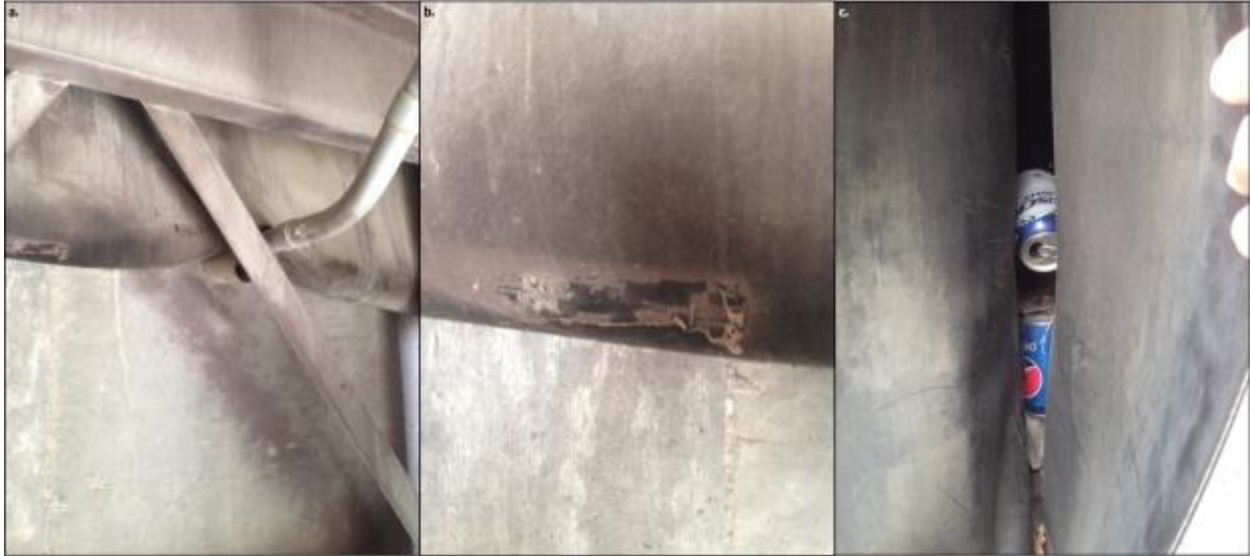
Figure 7 Sources of Poor Trough Performance: (a) Conduct Obstructing Material Flow; (b) Tear in Neoprene Trough; (c) Choke Point Caused by Debris