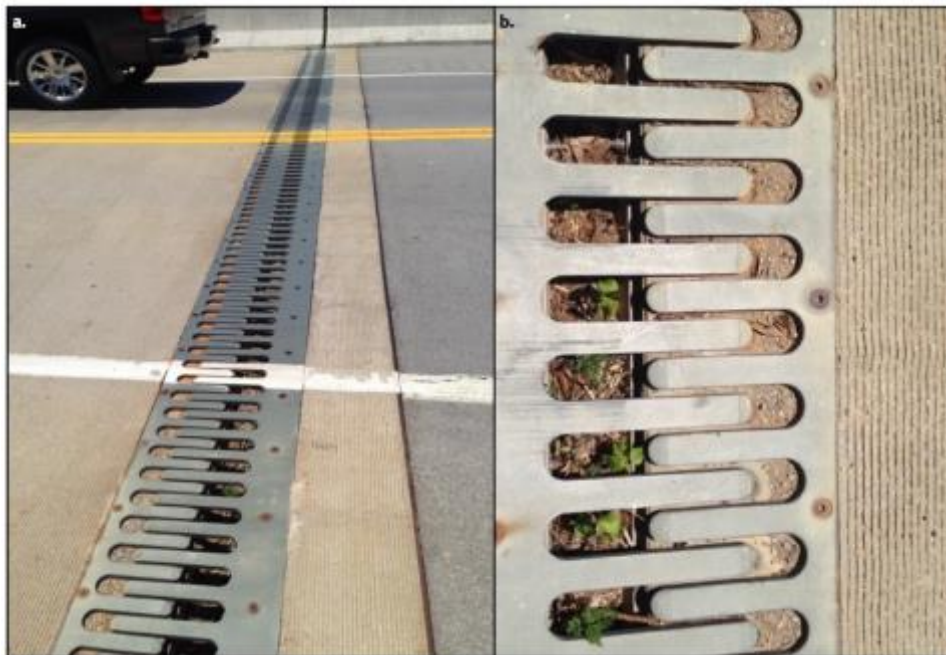
Figure 4 (a) Hybrid Finger Joint–Sliding Plate Joint; (b) Debris and Vegetation Accumulation in Trough Below the Joint

Although this unique joint design has performed well, the troughs located beneath the joints have clogged with debris such as twigs, leaves, sediment, and other litter. Due to the buildup of sufficient organic material in the trough, vegetation recruitment has begun (Figure 4b). Many state DOTs encounter this problem because they lack the personnel to make regular field visits to clean out troughs. Clogged troughs can lead to problems elsewhere on a bridge. For example, a trough on the I-65 John F. Kennedy bridge in Louisville continuously overflowed due to the presence of excess debris and clogged drain pipes. The overflow of salt-laden runoff collected in the gap between an uplift bearing base plate and an anchor bolt, causing the anchor bolt to corrode and fail. Because of the costly maintenance issues occluded troughs present, DOTs are looking for solutions such as innovative trough designs that would keep troughs free of debris without regular maintenance. To that end, the Kansas DOT (KDOT) has developed a self-purging trough that takes advantage of air flow and the vibrations produced by bridge traffic to divert materials away from the bridge.