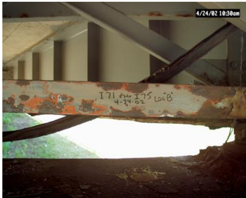
Figure 1 Detached Compression Seal Drooping Below a Deck Joint

One problem with neoprene compression seals is that they sometimes lose their flexibility and detach from decks (Figure 1). Strip seals can be torn or punctured. While new joint types are being proposed and seeing wider use, KTC researchers believed that use of different seal materials or seal designs within the framework of the existing seal types might result in a more durable and longer-lasting seal.