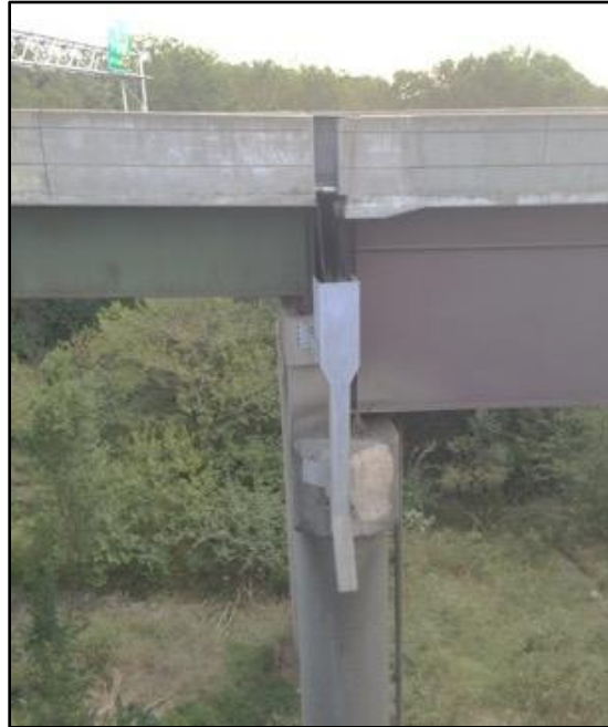
Figure 6 Collector for Self-Purging Trough

KDOT maintenance officials have reported good performance of self-cleaning troughs. Nonetheless, they are not invulnerable to potential problems, as documented in Figure 7. The installation will not work where pipes or other elements of a bridge structure can sometimes impinge on troughs, which introduces a slope discontinuity that prevents the passage of debris and water to the drains. The troughs must allow free movement along their entire length to promote the self-cleaning feature. Troughs may also be susceptible to damage. The neoprene sheet used for the trough is susceptible to tearing if it repeatedly rubs up against a hard object such as a beam end. Choke points may also develop if the sides of the trough are constricted and cause debris to become lodged. If there are impediments near the entry point of the trough that dampen vibration, the trough may be unable to transport debris and water toward the drain (Figure 8).