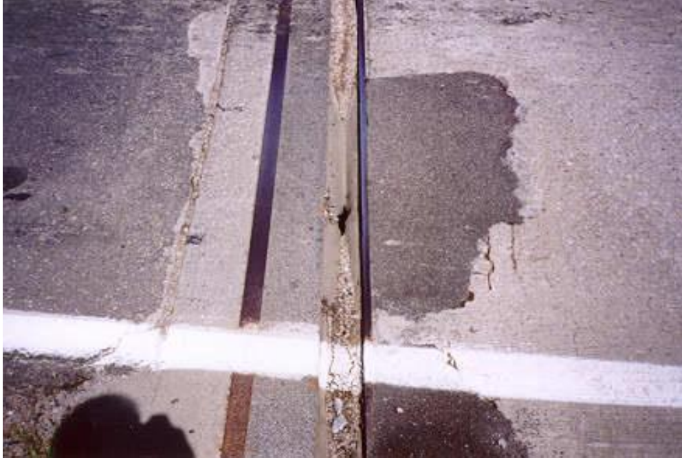
Figure 2 Torn Strip Seal Gland

Aside from expansion joints, each synthetic rubber is used in a wide range of industrial applications. One salient point to note is that some products fabricated from synthetic rubbers incorporate fiber reinforcement to improve their resistance and durability. For example, some rubber tires integrate steel and polymers — including Aramid — to improve puncture resistance. Because fiber reinforcements have performed well in other applications, researchers at KTC reasoned that incorporating them into strip seals would result in improved performance and better long-term durability. Using better materials will bolster the long-term durability of compression and strip seals. That could help state DOTs significantly reduce maintenance costs.