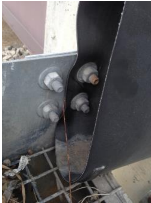
Figure 8 Unnecessary Bracket Attached to End of Self-Purging Trough Preventing It from Vibrating Properly