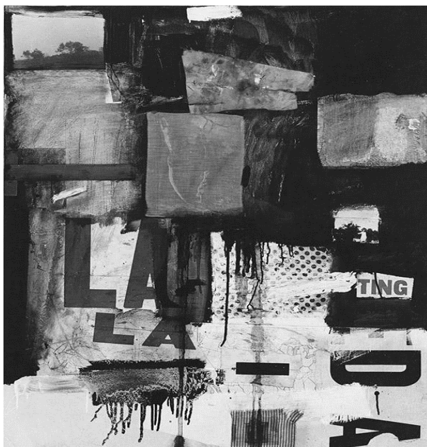
Robert Rauschenberg, Thaw (1958)

A “resale royalty right” or droit de suite (resale right) is a legal right that gives certain artists the right to claim a percentage of the resale price of the artworks they created. 4 The Berne Convention for the Protection of Literary and Artistic Works 5 and the Tunis Model Law on Copyright for Developing Countries 6 provide for an optional resale royalty right. Many countries have created a resale royalty right, although the particulars of the right differ from country to country. But the United States has repeatedly declined to create a federal resale royalty right, and a federal court recently held that a resale royalty right created by California is preempted by federal law. 7 However, the United States