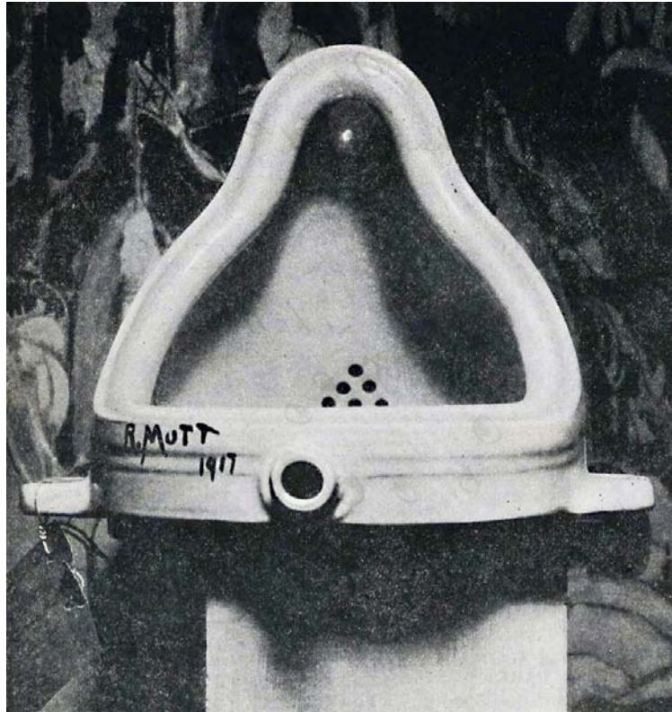
Marcel Duchamp, Fountain (1917)

gesture, deployed in a dialectic with its rejection. The cynicism of contemporary art feeds on the sincerity it purports to reject. 161 If contemporary art needs the vernacular, why shouldn't the resale royalty right subsidize vernacular art?