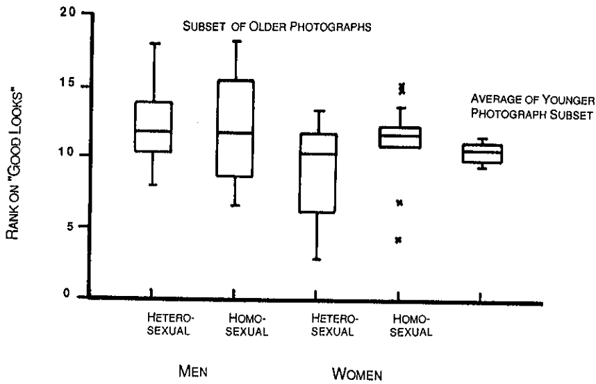
FIGURE 3. Effects of rater sex and relative age of photograph model, as shown by box plots of the average ranks given the older photograph subset ( n = 3 ). The rank of the younger subset ( n = 17 ) is shown for comparison. The median is denoted by a horizontal line. The interquartile range is boxed, and the entire range of the data is indicated by vertical lines. Other outliers are shown by asterisks.

consistency of rankings differed by sex, ranking dimension, age of target, and somewhat by sexual orientation.