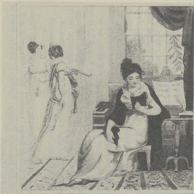
Beauty in her Prosperous State.