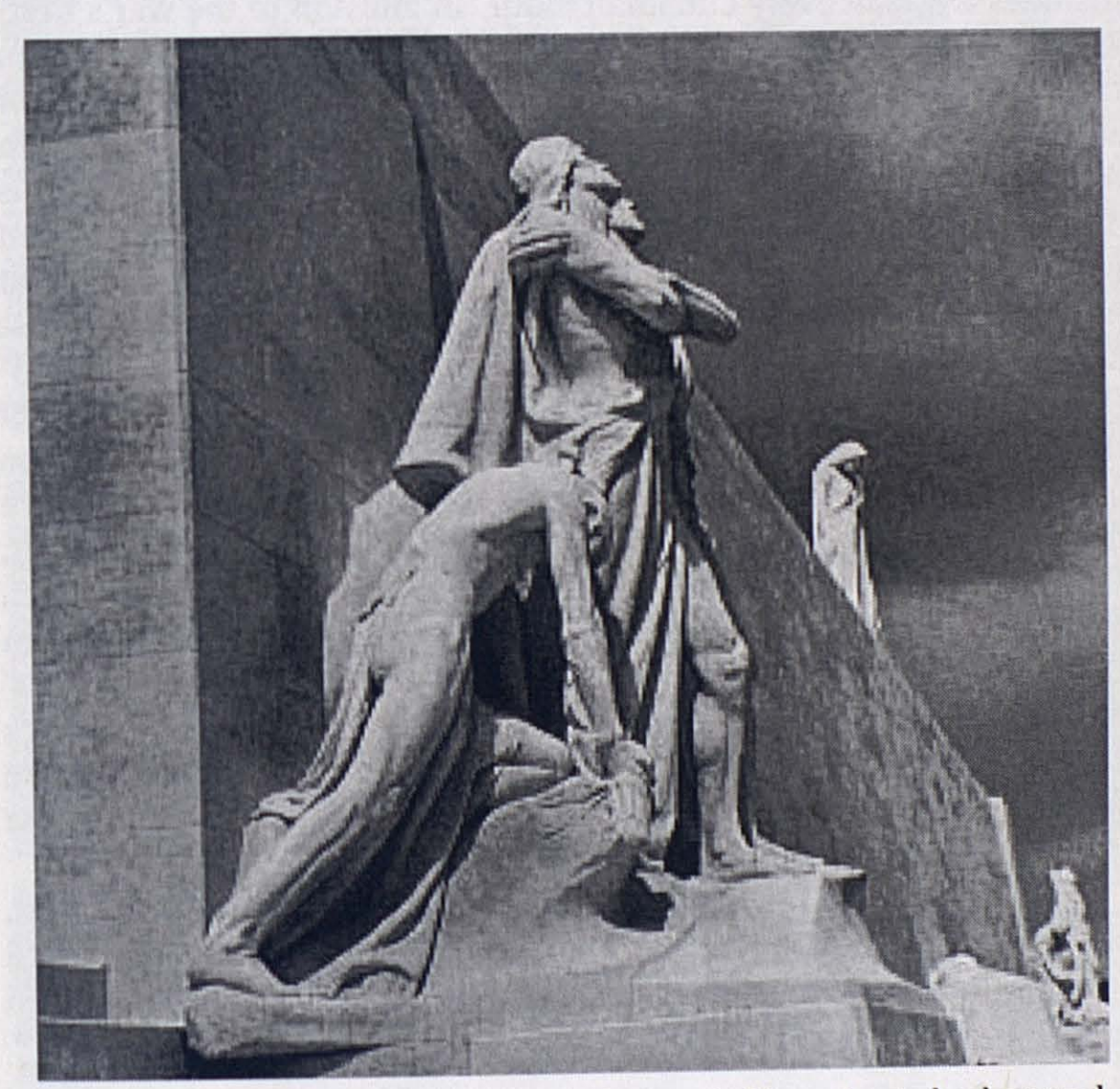
Figure 2. Defending the Helpless, with Canada Mourning in background.

without a cross. Above that figure loom other allegorical figures representing peace, justice and other idealized virtues. Again, the intensity of the attempt to create a post-Christian shrine displays itself in two readily apparent ways: the provision of a disassembled pieta-like figuration (the sorrowful Mother in the person of Canada Mourning, the crucified Son in the contorted pose below), and the assemblage of statues who lack traditional iconographic reference points but whose sacral nature remains clear.9