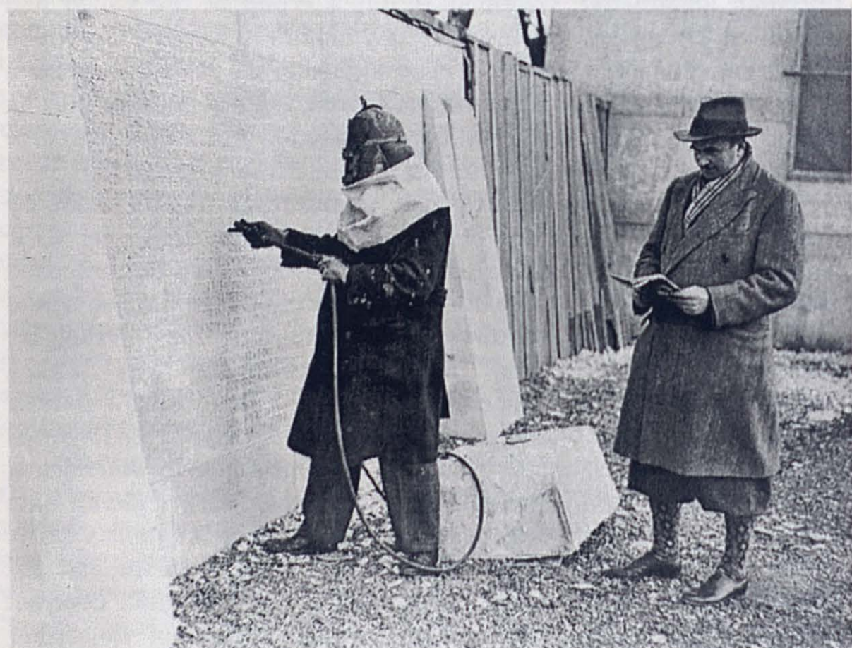
Figure 3: A sandblaster inscribes the names of the Missing on the Vimy memorial.

website now downplays the memorial's allegorical figures, concentrating instead on the names of the Missing (Veterans' Affairs Canada 2005).