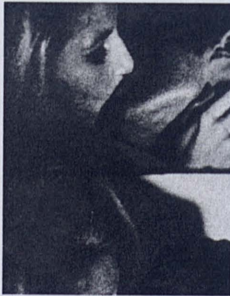
Figure 1. Warhol, Andy. Kiss .

But like so much of Warhol's art, it isn't that he simply reflected what he saw: His significance is in what he chose to represent. Warhol wasn't passively archiving the experiences of post-War America: he was bringing to light cultural traditions that had, until then, been invisible. Warhol was, in the words of Catherine Russell, "an ethnographer of a particular subculture" (1999, 170). The first of his films to be publicly screened, Kiss , features a sequence of three and one half minute shots of couples kissing. "The film becomes a documentary of a promiscuous culture," Russell argues, "naturalizing bisexuality, homosexuality, and interracial sexuality within the conventions of the cinematic kiss" (1999, 172). By selecting these folk groups for representation, Warhol made their culture, previously ignored or taken for granted, visible.