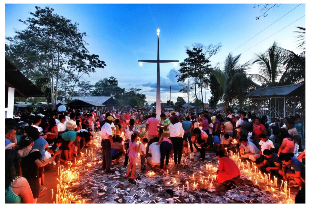
Figure 5. Families in the regional capital city of Puerto Maldonado congregate at the cemetery during Día de todos los Santos (All Saint's Day), during which they celebrate their deceased loved ones by consuming their favorite foods and drinks, dancing to music in their honor, and lighting candles at their graves. Countless people in Madre de Dios have died while toiling in the mines.

During fieldwork I occasionally heard the terms "charapita" (little turtle), "peladita" (little stripped thing), and "jovencita" (young sweet girl, the diminutive suffix 'cita' denotes affection) in reference to highly desired child prostitutes who work along the river in the pueblos where miners stock up on supplies, imbibe between shifts of work, and seek the service of prostitutes. The trafficking and exploitation of the female body and molestation of adolescent girls are the perverse effects (and local embodiment) of the global gold trade on local and migrant communities in Madre de Dios.