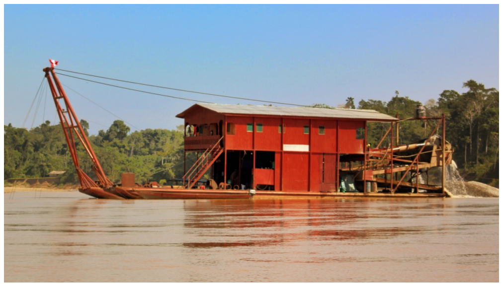
Figure 9. A draga (barge) mines for gold on the Madre de Dios River before they were banned in 2011. The draga completely mechanizes the process of alluvial gold mining.

Most literature describes fiebre de oro (gold fever) in Madre de Dios as resulting from commercial interests running amok in what Yu et al. (2010) call "low-governance areas," where state enforcement of regulations and laws is absent.<sup>23</sup> Thus, miners and their absent government are considered the culpable forces of destruction and exploitation. But how is it that the peasant who migrated to Amazonia to escape destitution and who now works 24-hour shifts operating mining machinery for a meager short-term wage has come to represent unfettered capitalism rather than the multi-millionaire investment banker on Wall Street who profits most from deforestation, pollution, prostitution, slavery, illness, and death in Madre de Dios?