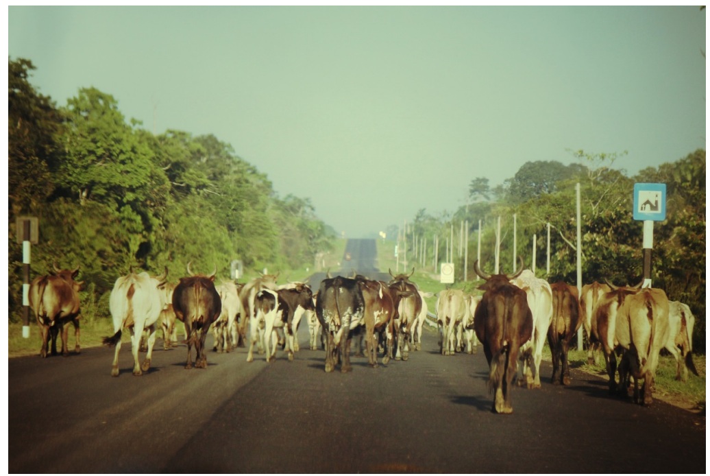
Figure 2. A view of the Transoceanic Highway on the way to the mining corridor.

during the global recession and enabled migrant workers to access Madre de Dios mining areas from the neighboring Andean departments of Cusco and Puno (fig. 2).