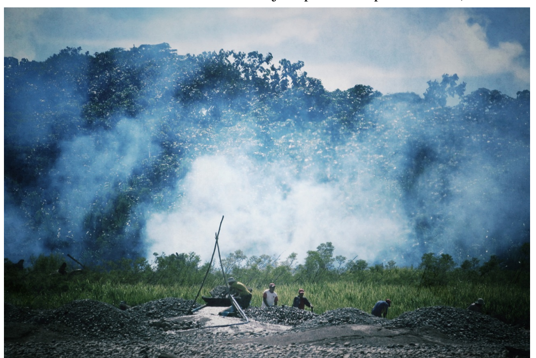
Figure 7. Artisanal miners clearing vegetation to expand beaches along the Madre de Dios River

Local residents in Puerto Maldonado, the capital city of the Madre de Dios region, nostalgically remember their hometown when it was a small pueblo where residents could leave their front doors open and children could safely ride their bicycles down the main streets without concern. But rapid development from the booming gold industry has upended local lives. Crime has escalated in recent years and is usually cited in interviews with residents when asked about the greatest changes they have seen in the city during their lifetimes. "Carreteristas" (lit. 'Highwayers') ride on motorcycles and snatch purses and backpacks from pedestrians and people on the back of motorcycle taxis. "Choros" (slang for 'thiefs') frequently assault residents in certain barrios (neighborhoods) of town. Denizens of Madre de Dios also complain about the inflated price of goods when compared to other parts of Peru where gold mining is not the predominant economic activity. Some locals who describe themselves as "neto" (native) from the region lament growing disappearance of local foodways, as local dishes such as tacacho con cecina (jerk pork with plantain balls) or