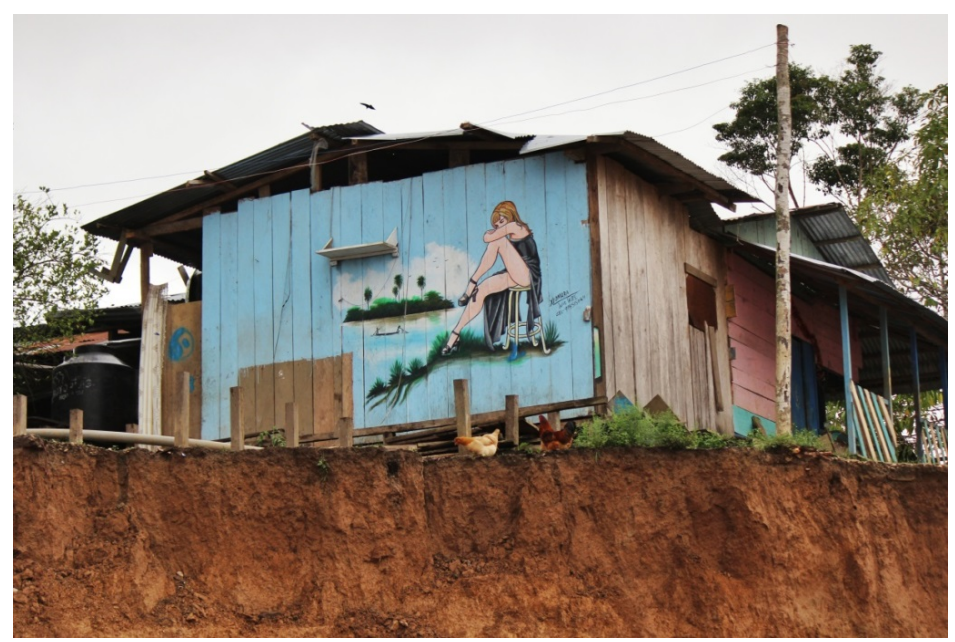
Figure 4. A prostibar (prostitution bar) in a remote riverine pueblo along the Madre de Dios River.

on the type of semi-mechanized mining method) which are often followed by alcohol binging and prostitution, the latter of which may lead to increased risk of contracting sexually transmitted infections. <sup>16</sup>