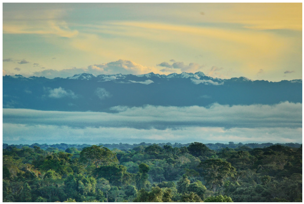
Figure 11. Where the Andes and Amazon meet, biogeographically, economically, and culturally

related to structural inequality, migration, and mining. Most miners in Madre de Dios are impoverished migrants from the Andes (fig. 10, 11). Global gold prices and poverty in the Andes are often given as reasons for the mass exodus from the Andes in recent decades. However, these "push" and "pull" factors superimpose the laws of supply and demand onto complex human situations and have