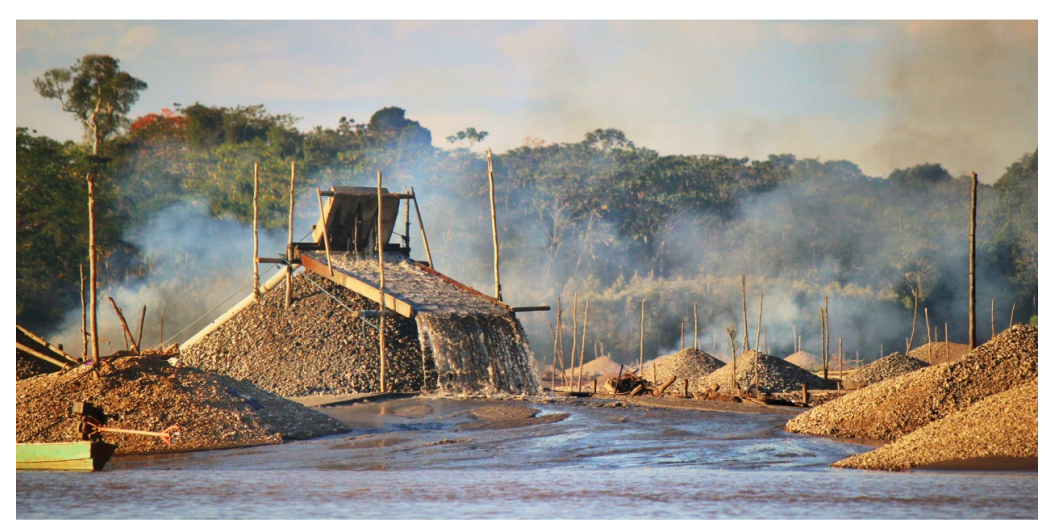
Figure 1. Caranchera (semi-mechanized mining machine) on the Madre de Dios River in Peru