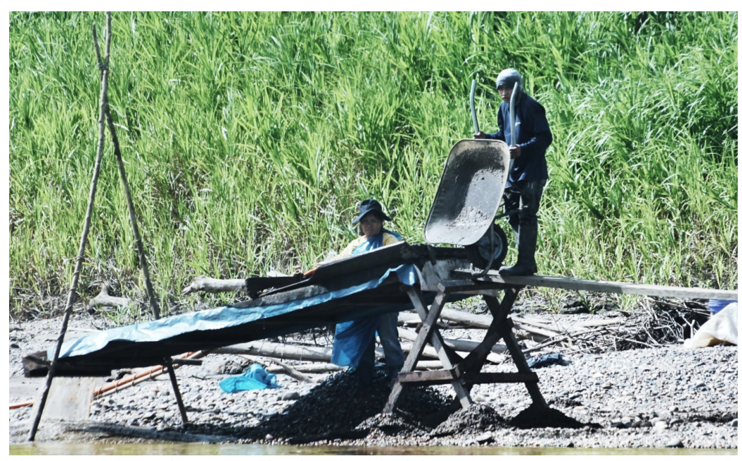
Figure 10. Andean migrants working in artisanal mining on a riverbank

This scapegoating is part of the process of mystification, which entails obfuscating capitalist production, veiling unequal social dynamics, and treating them as if they were natural and inevitable. The belief in market prices and advancements in technology are part of what Hornborg (2001) calls machine fetishism , in which machine technology (i.e. notions of development and progress) mystifies social relations and conceals unequal material exchanges. Miners in Madre de Dios represent environmental destruction because they are the most immediate, visible appendage of the global machinery of extraction and capital accumulation.<sup>24</sup>