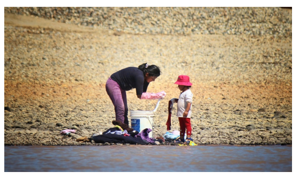
Figure 3. A small child helps her mother wash clothes for miners on the banks of the Madre de Dios River in the mining corridor, where Ribereño communities are exposed to exceedingly high levels of mercury.

hypertension in African Americans is the physical embodiment of material and socio-political factors, such as occupational and residential segregation, discrimination, and exposure to toxic substances. From this perspective, illnesses are often "biological expressions of social relations" in which physical afflictions are signs of social inequality. Paul Farmer's (1999) penetrating analysis reveals how significant differences in morbidity and mortality rates in Haiti from HIV, malaria, tuberculosis, and other preventative diseases "track along social fault lines." Moreover, it demonstrates that both local and global forces of inequality determine why some people are predisposed to illness (due to political economic factors rather than physiological ones) while others are safeguarded from risk. These linkages between labor, embodiment, and inequality call for an analysis that should "inscribe this relationship into a broader historical and sociocultural framework." Embodiment theory enables us to see how local