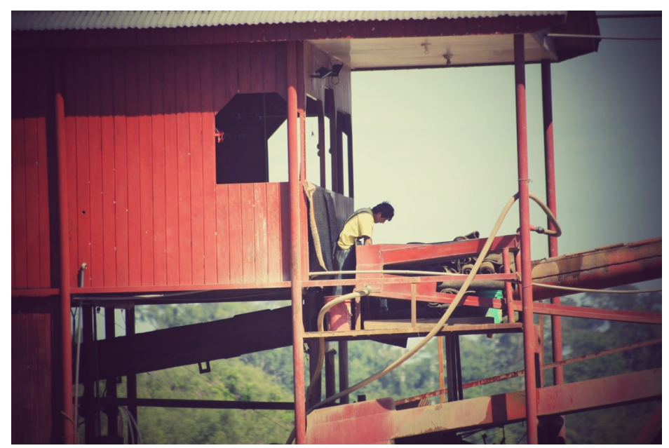
Figure 8. A miner working on a draga (barge) on the Madre de Dios River

Although scholarly articles, gray literature, and mainstream media acknowledge a correlation between global gold prices and the consequences of gold mining in Madre de Dios, most publications continue to vilify local miners