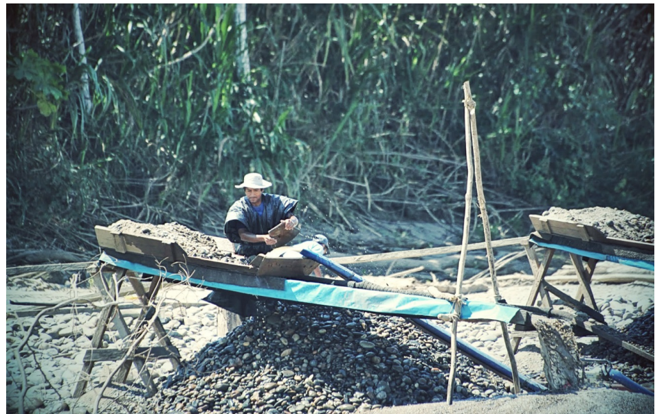
Figure 12: Small-scale "cholobomba" operation on a riverbank

Problems from gold mining in Madre de Dios cannot be reduced to binary distinctions of good and evil or perpetrators and victims; such reifications continue to mystify these issues rather than to help us critically think about them. Moreover, miners in Madre de Dios are not passive responders—they have agency, motives and ambitions. Many miners are aware of mercury contamination, but some are skeptical and do not trust data on its deleterious effects from NGOs or government institutions, which are sometimes suspected to be colluding to thwart local livelihoods. Mistrust of the government must be understood historically, considering that Andean communities were persecuted during Peru's civil war and many continue to suffer from centralismo policies. Thus, history, power, culture, health, and environment are inseparable issues and we must examine their linkages to further shed light on the realities of global trade.