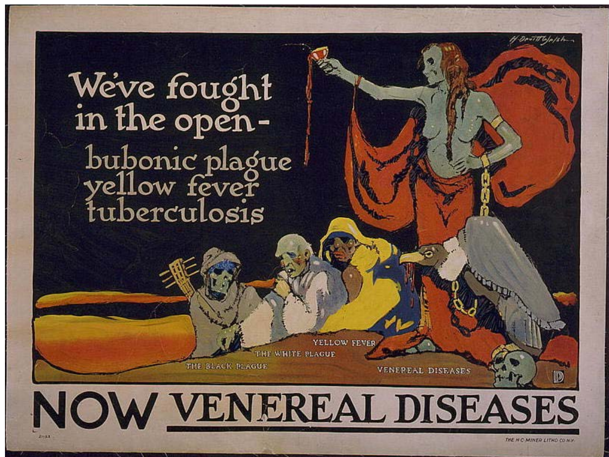
Figure 2: The female body chained to a vulture stands as a symbolic representation of venereal disease in this World War I poster. H. DeWitt Welsh, “We’ve fought in the open,” 1918, New York: H.C. Miner Litho. Co., Library of Congress Prints and Photographs Division, Washington, D.C.

became the targets of wartime propaganda, expanded police powers, and fears over the venereal disease menace.