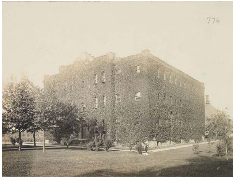
Figure 5: Women sent to Albion State Training School in Albion, N.Y. were first sent to the Reception Cottage. First opened in 1893 as the Western House of Refuge for Women, the institution changed its name to the Albion State Training School in 1923 before becoming the Institution for Mentally Delinquent Women in 1931. The institution detained women classified as "defective delinquents" for