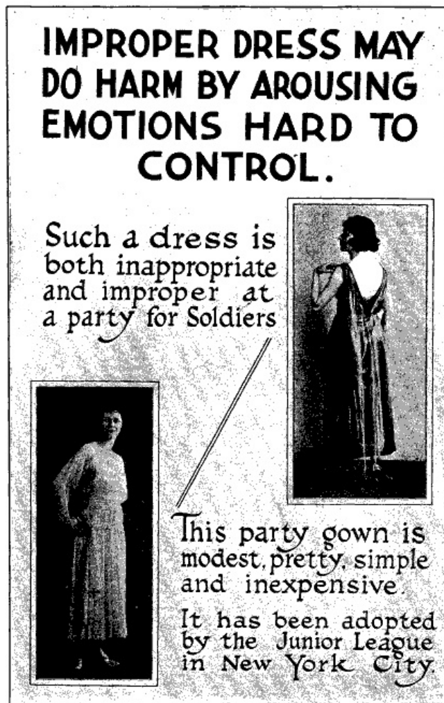
Figure 1: This poster printed in 1918 in the Journal of Social Hygiene offered instructions for how women should dress when around soldiers.