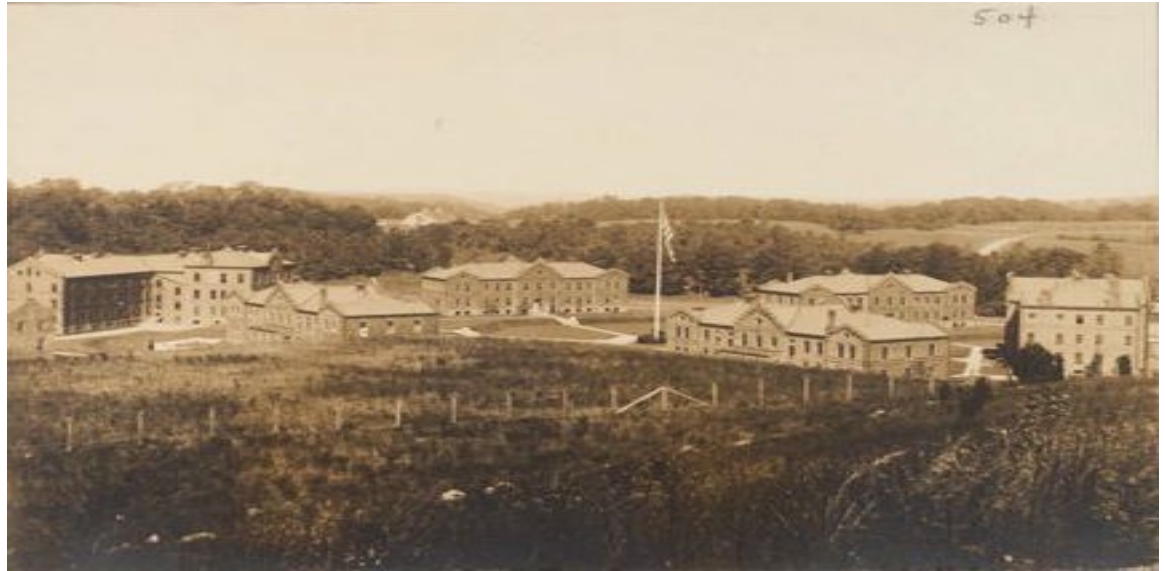
Figure 4: Bedford Hills Reformatory (renamed Westfield State Farm in 1932) in Bedford Hills, N.Y., panoramic view pictured above, opened in 1901 for misdemeanor offenders between the ages of sixteen and thirty. “State Reformatory for Women, Bedford, N.Y.: Panorama of Principal Buildings,” circa 1900, Harvard Art Museums/Fogg Museum, transfer from the Carpenter Center for the Visual Arts, Social Museum Collection.

for having a venereal disease infection. 24 The expansion of judicial power and laws that left the definition of vagrancy and prostitution to open-ended interpretation influenced the commitment of women to the reformatory.