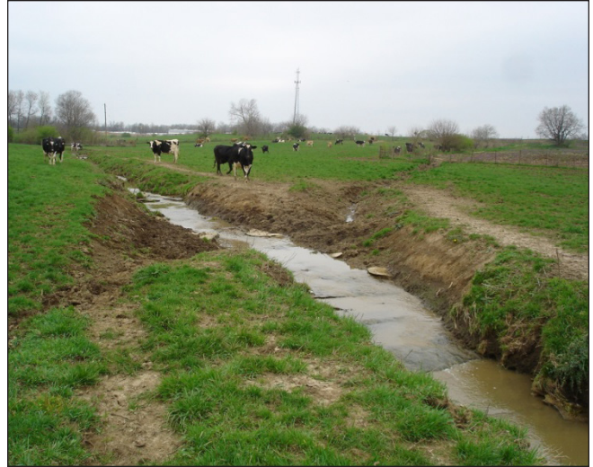
Figure 1. This figure shows how dairy cows with full access to a stream can erode stream banks and pollute surface waters with sediment, manure, and bacteria.

Cows should be excluded from creeks, streams, and ponds using temporary or permanent fencing, and they should be offered alternative water sources. Cows will drink more if they have access to clean water, and they will consequently eat more and be able to produce more milk. From an environmental standpoint, cows can erode stream or pond banks and harm water quality in a short amount of time (Figure 1). The public can also be very critical of cows in natural waters,