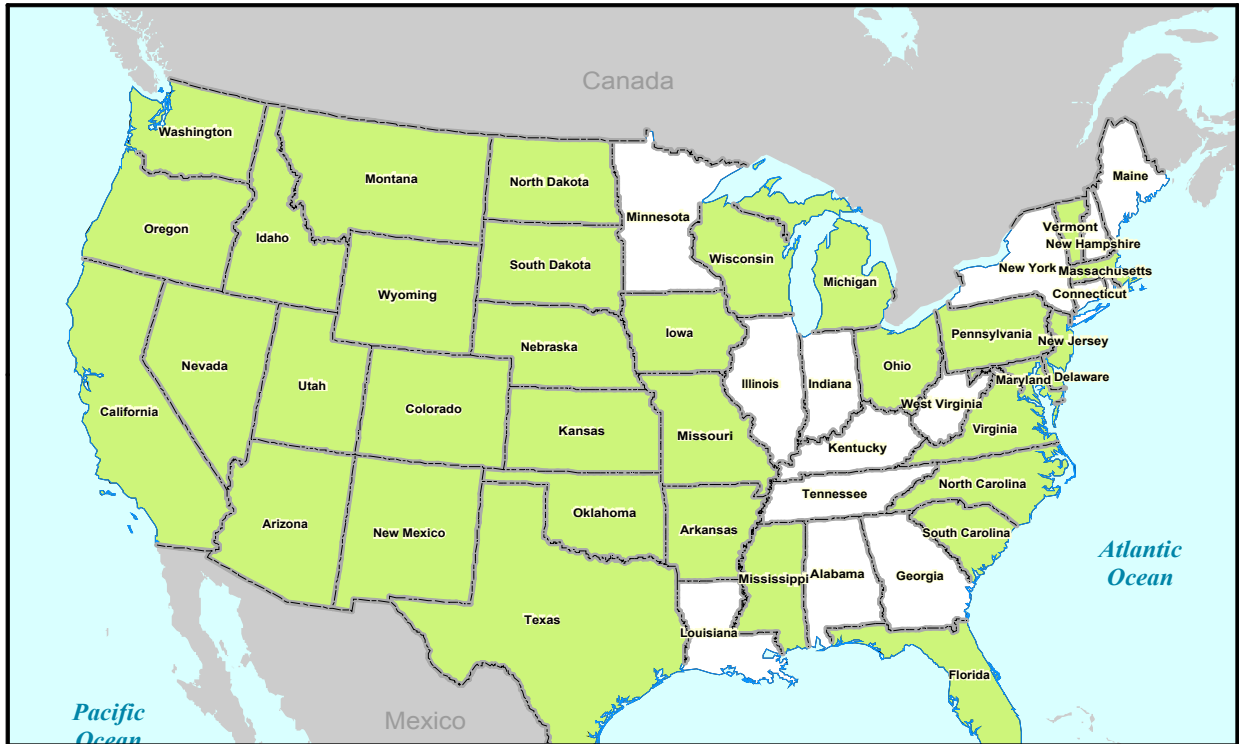
Figure 1: Commission States (Gray) vs Non-Commission States (White)

Using the Commission Involvement Index, we determined whether the commission had limited, average, or greater involvement in the five governance and management functions. Table 3 presents these results.