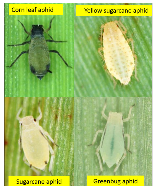
Figure 7. Other aphid species pests of sorghum

Scouting and identification of grain sorghum insects, including economic thresholds for each insect pest, is discussed at length in IPM-5: Kentucky Integrated Crop Management Manual for Field Crops—Grain Sorghum ( http://www.uky.edu/Ag/IPM/manuals/ipm5s-org.pdf ).