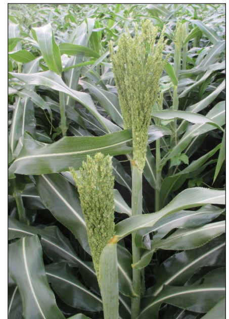
Figure 5. Emerging grain sorghum panicles