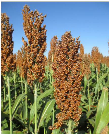
Figure 3. Grain sorghum hybrid with a large head exertion (distance between the bottom of the sorghum head and the flag [top] leaf)

Insect management is essential when producing grain sorghum in Kentucky because there are several insect pests that can negatively impact grain sorghum