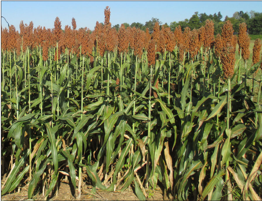
Figure 1. Grain sorghum ( Sorghum bicolor )