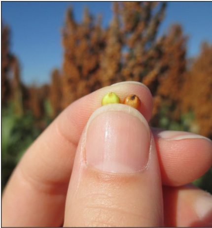
Figure 6. Grain sorghum kernels at hard dough stage (left) and at black layer (right)

yield and quality. Insect pests are generally divided into two groups: those that effect the grain directly and are indirect feeders, and those that feed on the leaves and stalks and generally reduce the vigor of the plant and the flow of nutrients to the grain heads.