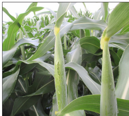
Figure 4. Grain sorghum plant at boot growth stage. Note the swollen flag leaf sheath of the right plant and the swollen leaf sheath and visible panicle of the left plant.