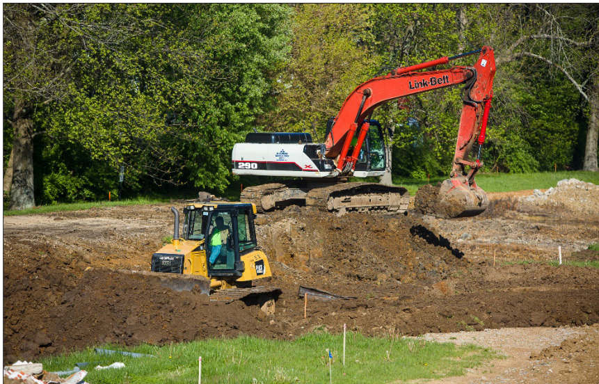
Figure 1. Sources of sediment in watersheds include (a) construction sites and (b) stream beds and banks.

Sediment is one of the most common pollutants in waterbodies such as streams, rivers and lakes. Sources of sediment include upland areas, meaning lands above the floodplain, as well as the waterbodies themselves (Figure 1). Human activities that reduce or remove vegetation increase the amount of soil eroded. In the uplands, examples of sediment sources include tilled crop fields, grazed pastures, construction sites, and timber harvesting areas. Along water bodies, the beds and banks erode due to the force of moving water. Streambank erosion, for instance, contributes anywhere from 15 to 90% of the suspended sediment load in streams.