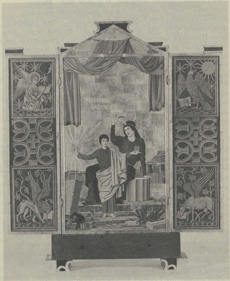
Victor Hammer, Hagia Sophia Crowning the Young Christ , triptych, 27 1/4" x 23 3/4". (Private Collection)