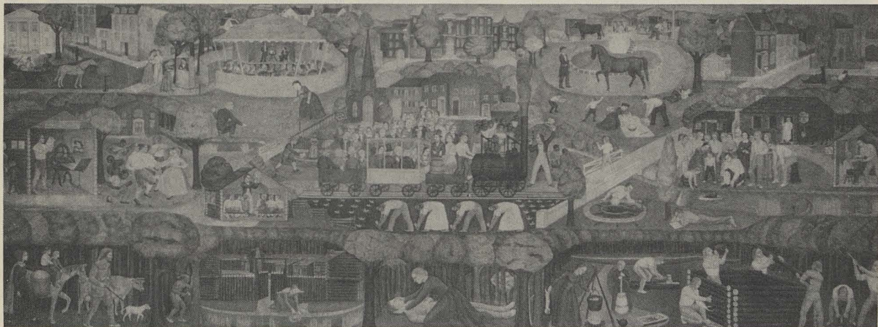
The central section of the Memorial Hall mural.