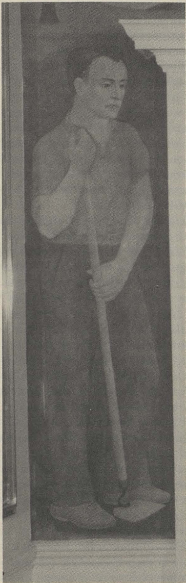
Detail of left of mural.