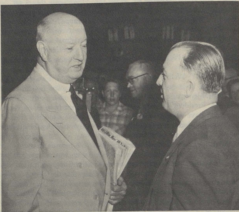
National Democratic Party Chairman James A. Farley and Gov. Albert B. Chandler of Kentucky at the 1956 Democratic national convention in Chicago.

Stevenson for that nomination at that time. With all due respect to the president.