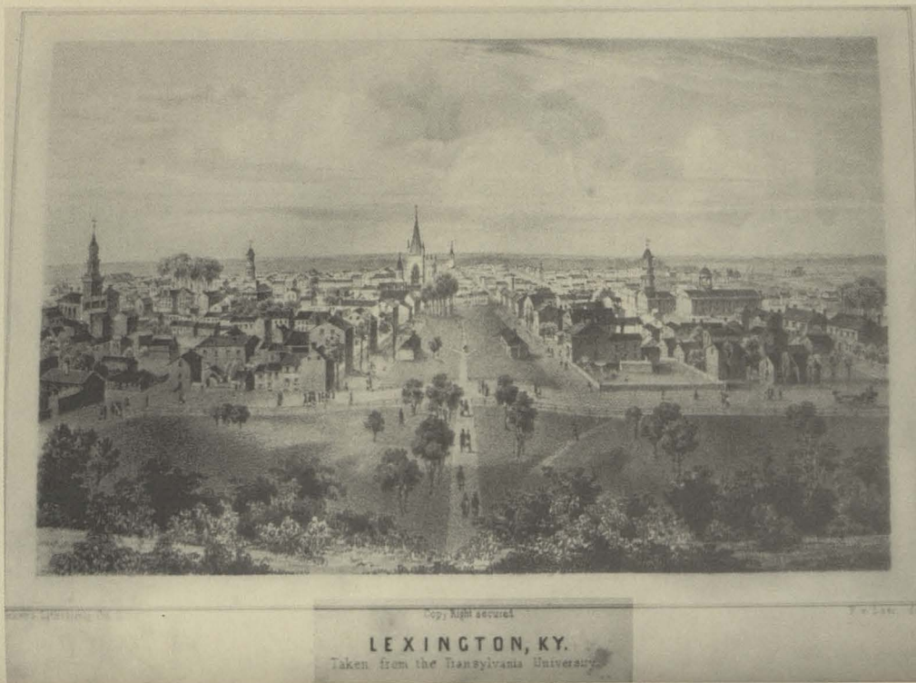
copy, right secured LEXINGTON, KY. Taken from the Pennsylvania University