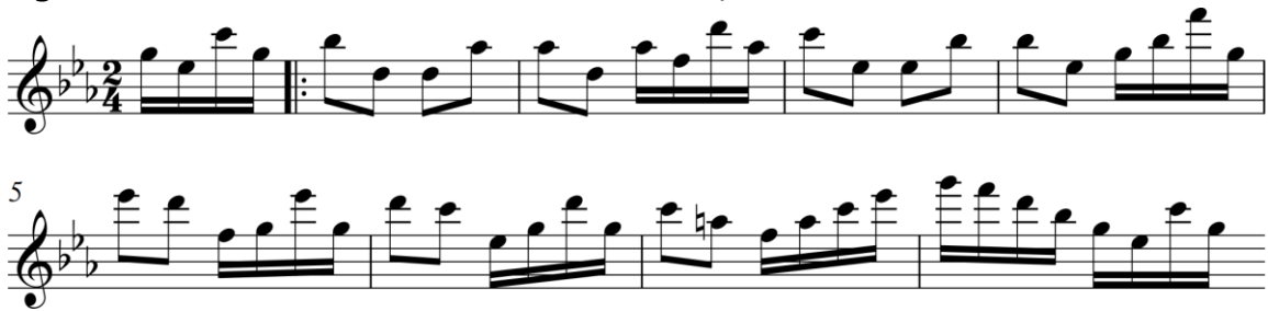
Figure 3.24: Saudades do Cais da Gloria , mm.1-7.

Structurally, this polka is built as a simple five-part Rondo form (AABBAACCA). The five-part form (ABACA), along with the seven-part form (ABACADA), was widely used by Callado and became the standard in choro composition. 217 The melody tests the five-keyed flute player's abilities due to its tonal structure, rapid large intervallic motions and constant octave changes. The A section for instance, begins in the key of E-flat Major, the piece then moves to the key of C minor in the B section and then modulates to A-flat Major in the C section.