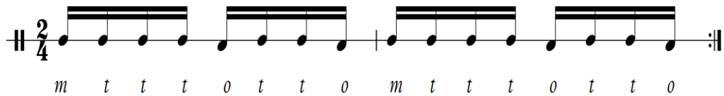
Figure 2.1: Rhythmic Pattern of the Pandeiro in Choro

Such instrumentation, along with the way the music itself was performed, created the authentic and popular choro . The authors Marilyn Mair (n.d.) and Paulo Sá (n.d.) describe precisely the atmosphere of the “roda de choro” by saying: