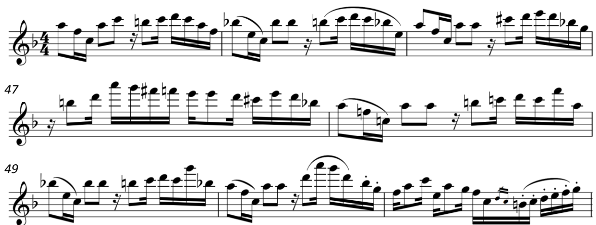
Figure 3.38: Cruzes Minha Prima!!! , mm. 44-51.

Although chromatically challenging, this would be another showpiece for Callado and his five-keyed flute. The flourished but mostly conjunct melodic line falls comfortably “under the fingers” of a five-keyed instrumentalist. The keys in which the pieces were