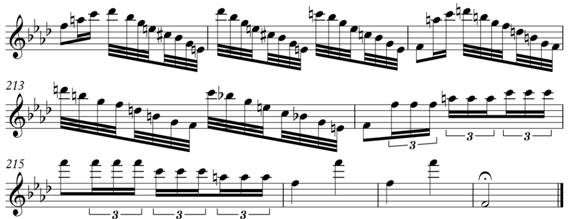
Figure 3.34: Lundu Caracteristico , mm. 210-218.

Lundu is a challenging piece for both the pre-Boehm and the Boehm flutist, however, after considering the key signature, fingering and melody, the analysis of this pieces suggests it is easier to perform on the Boehm flute than the five-keyed instrument, making a strong case for Callado's use of the Boehm flute.