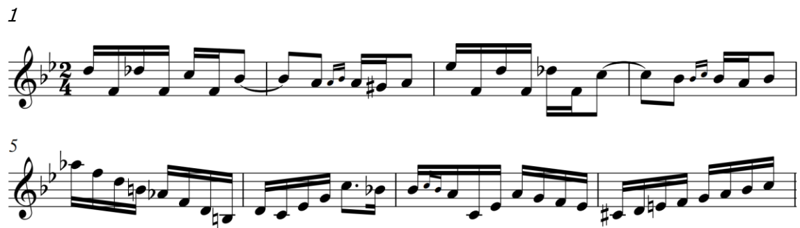
Fig.3.35: Improviso , mm.1-8.

The polka Improviso was most likely written during this period of Callado's life. The melody has a syncopated character. The sixteenth-note leaps and the constantly moving melodic lines capture the informal, improvisatory atmosphere that are present in similar works from this time.