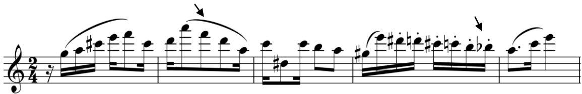
Figure 3.37: Cruzes Minha Prima!!! , mm. 23-27.

The piece shares many characteristics with the previously analyzed tunes: the melody begins with an anacrusis. The piece consists of seven parts: AABBCDDAB coda. The following passage (Figure 3.37) shows elements of the characteristic melodic syncopation (m. 24) as well as Callado’s use of a chromatic descending progression (m.26).