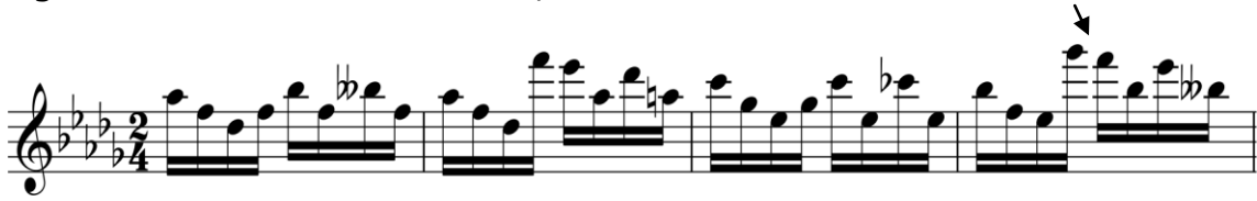
Fig.3.31: Lundu Caracteristico , mm.98-101.

In figure 3.31 above, the interval on measure 101, where the melody moves from G6 to F6 (see arrow), requires a finger change that would be quite awkward for the five-keyed flutist, whereas the same passage on the Boehm flute, although demanding the same number of finger changes, does not require as much effort from the player due to finger placement. (see Figure 3.32 and 3.33)