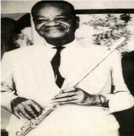
3. Alfredo da Costa Vianna Jr. (Pixinguinha) 165 (1897-1973)