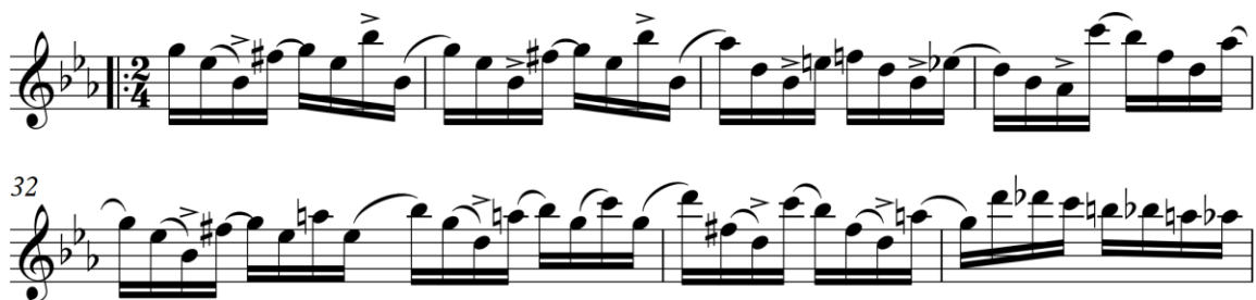
Figure 3.36: Improviso , mm 28-34.

One would argue that the overall tonal structure of Improviso , favors the Boehm flute. However, one can also argue that a skilled five-keyed instrumentalist, such as Callado, could also perform