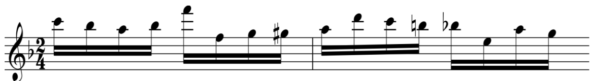
Figure 3.43: A Flor Amorosa , mm. 40-41.

The chart below illustrates the fingering used in both pre-Boehm and Boehm flutes in measure 40 and 41.