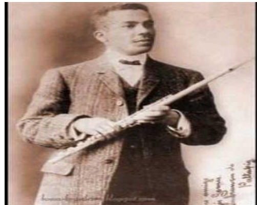
2. Patápio Silva 164 (1880 - 1907)