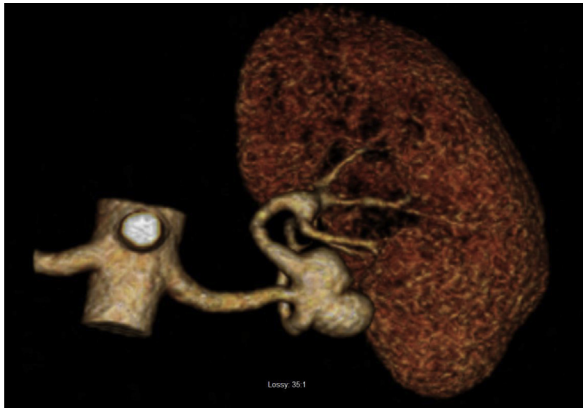
Fig 1. Three-dimensional rendering of the left renal artery aneurysm (RAA).