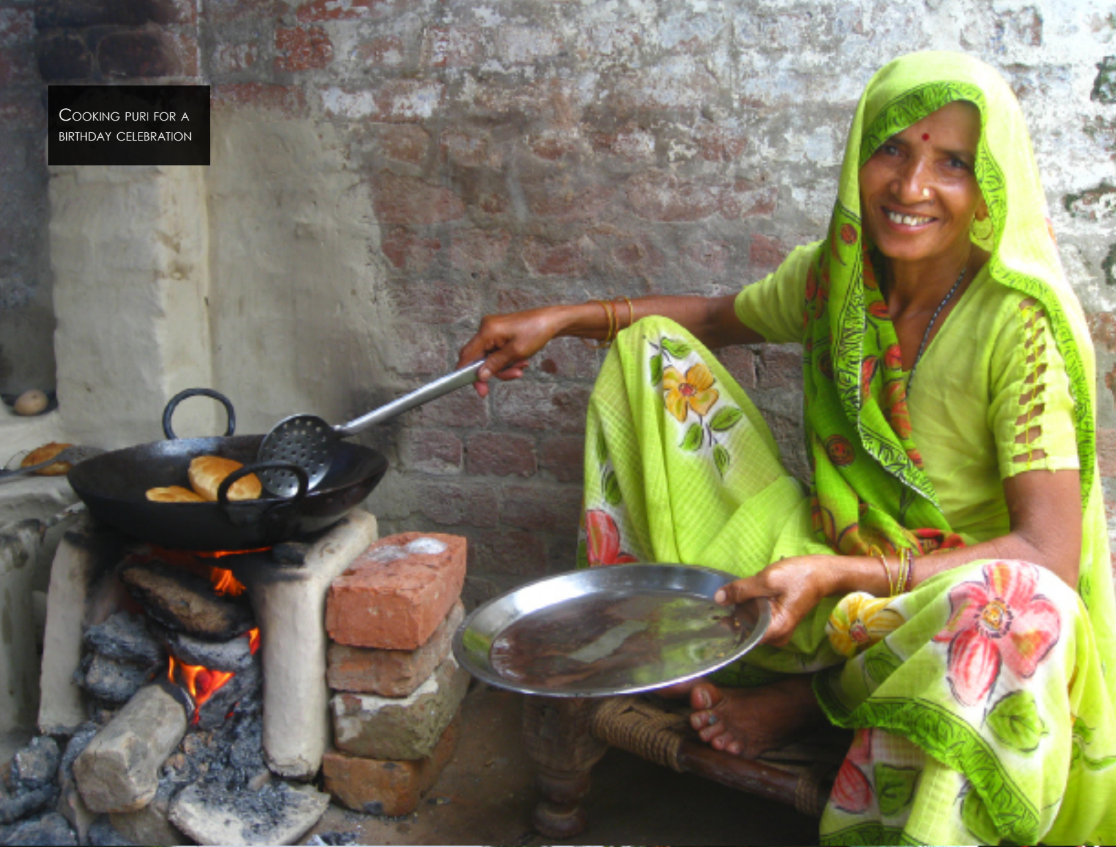
COOKING PURI FOR A BIRTHDAY CELEBRATION