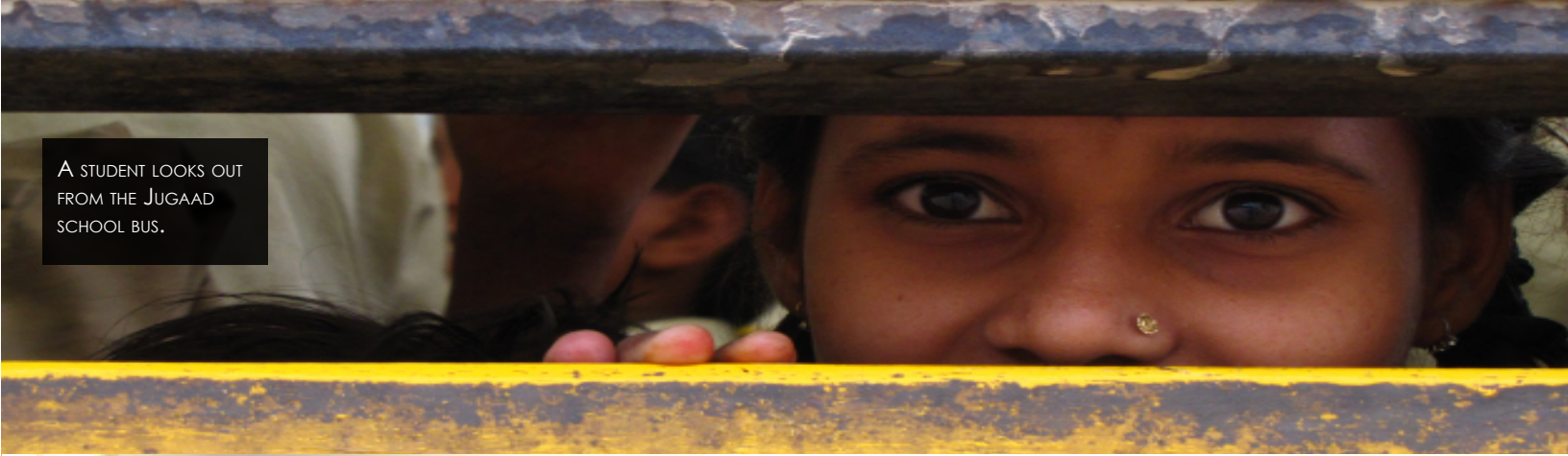
A STUDENT LOOKS OUT FROM THE JUGAAD SCHOOL BUS.