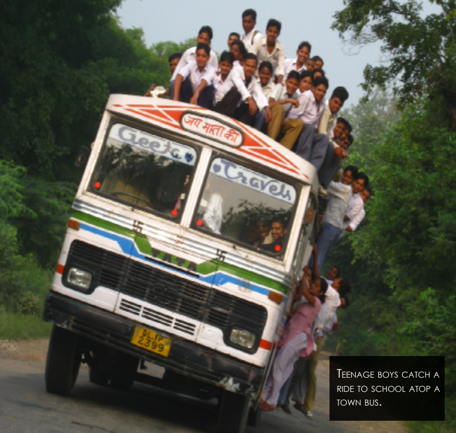
TEENAGE BOYS CATCH A RIDE TO SCHOOL ATOP A TOWN BUS.