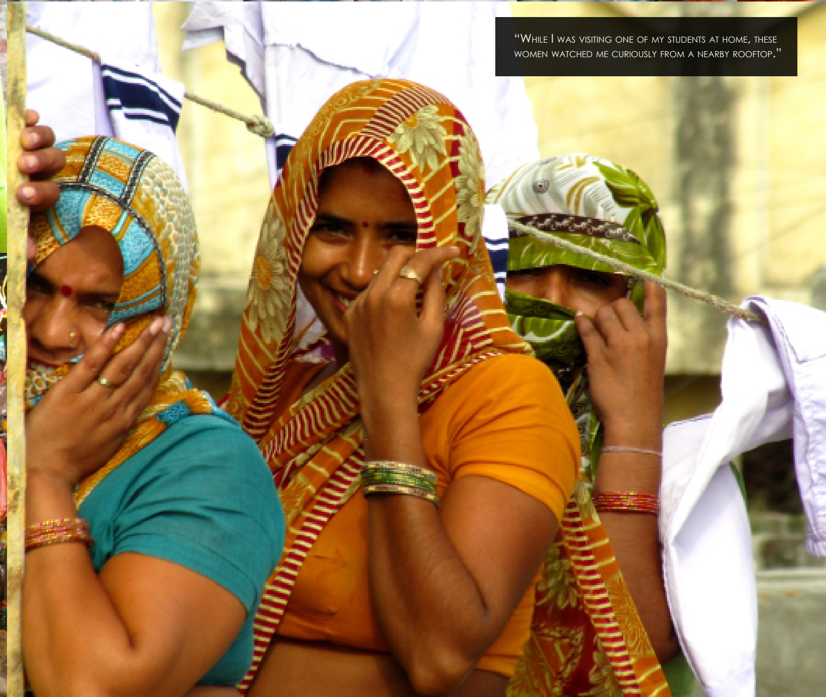
"WHILE I WAS VISITING ONE OF MY STUDENTS AT HOME, THESE WOMEN WATCHED ME CURIOUSLY FROM A NEARBY ROOFTOP."