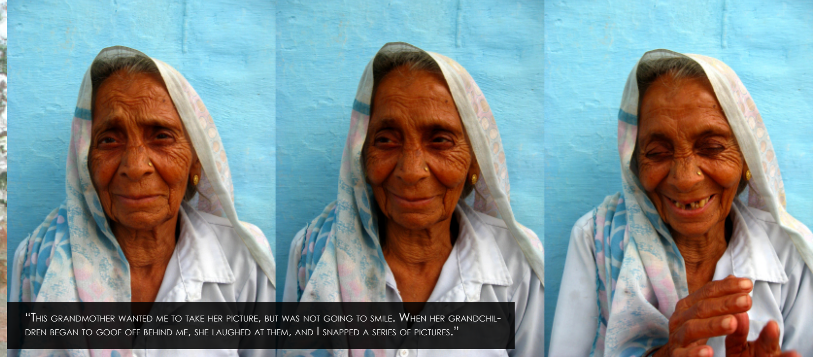
"THIS GRANDMOTHER WANTED ME TO TAKE HER PICTURE, BUT WAS NOT GOING TO SMILE. WHEN HER GRANDCHILDREN BEGAN TO GOOF OFF BEHIND ME, SHE LAUGHED AT THEM, AND I SNAPPED A SERIES OF PICTURES."