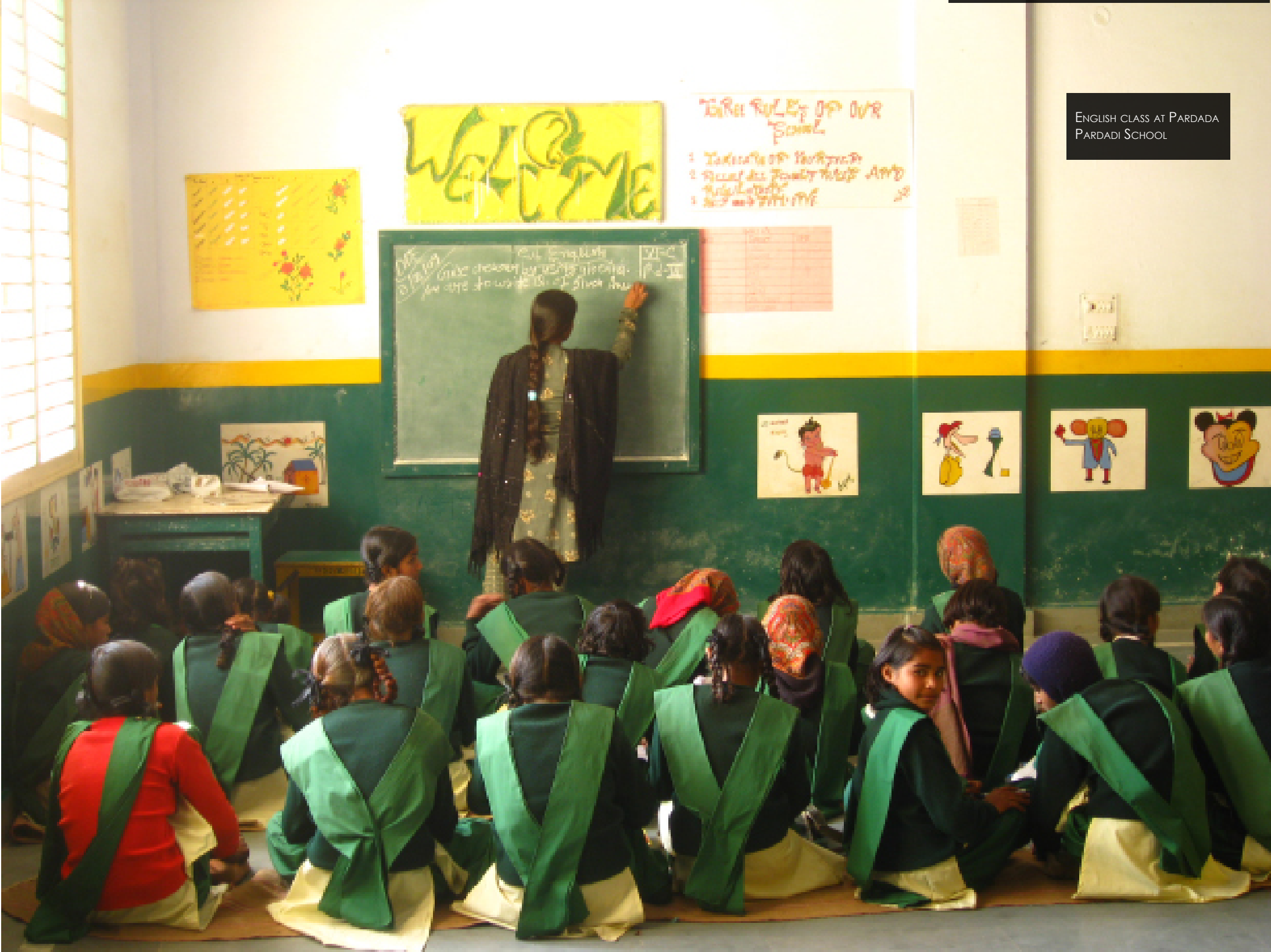
ENGLISH CLASS AT PARDADA PARDADI SCHOOL