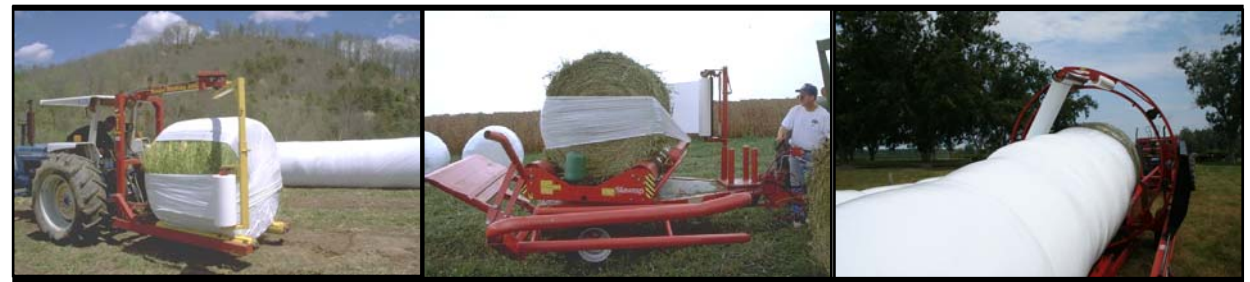
Figure 1. Examples of three basic categories of Balage wrappers: (L to R) individual bale wrapper on a 3-pt. hitch platform, individual bale wrapper on a trailer platform, and an in-line bale wrapper.

Bale wrappers can generally be classified into three basic categories (Figure 1 and Table 1). Table 1 provides generalizations about each of these three basic categories with respect to wrapping rate, labor requirement, and bale capacity.