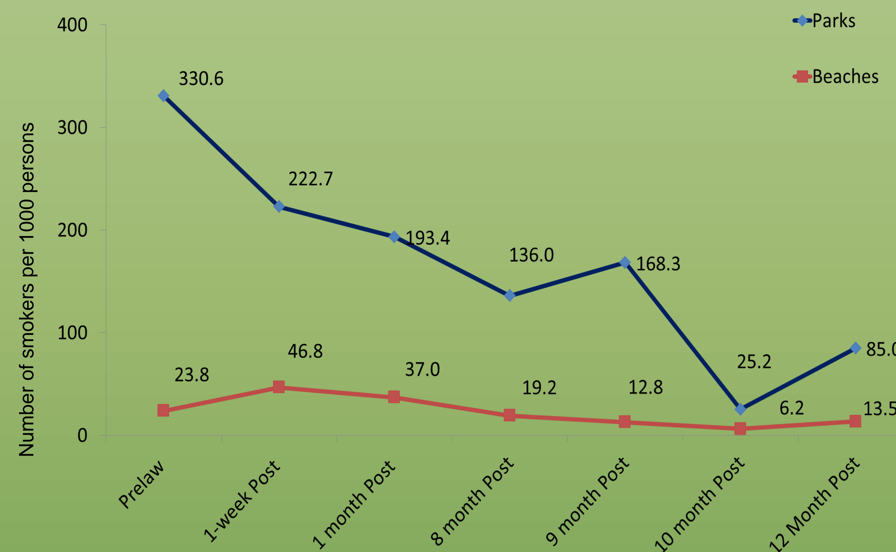
Fig. 1. Changes in rate of observed smoking (per 1000 persons) in all selected Vancouver parks and beaches (n = 6) by observation period

* Several activities were occurring at Vancouver parks and beaches, including a 'Dyke March' and Firework displays in the beaches