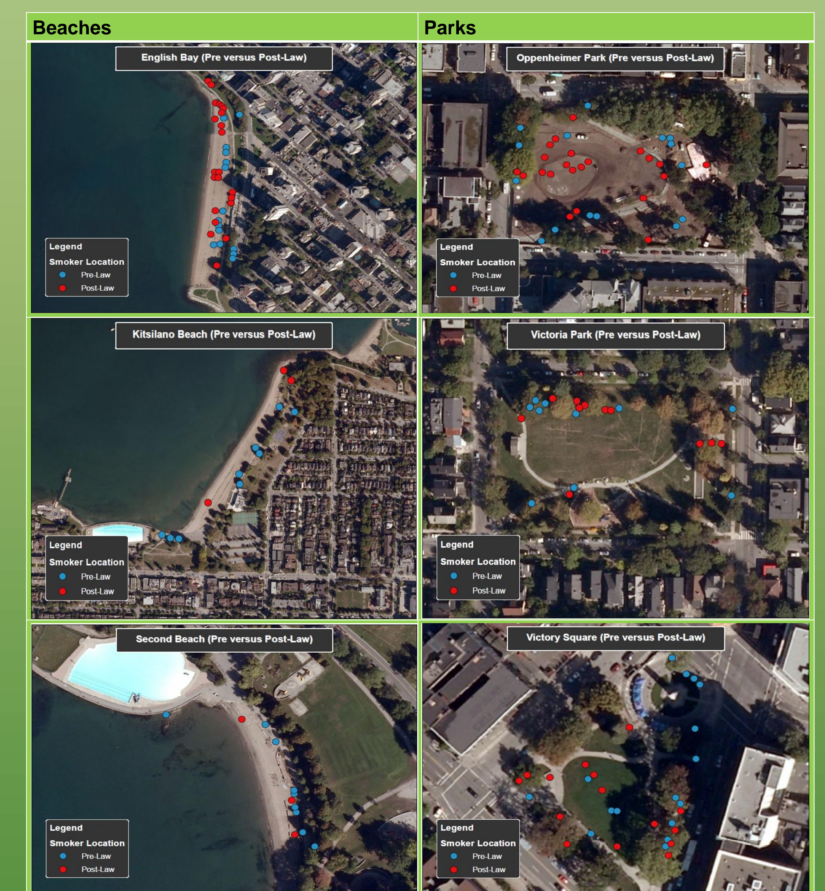
Figure 3. Changes in spatial location of smokers at prelaw vs. 12-month post-law in selected Vancouver parks and beaches